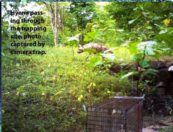
Hyena passing through the trapping site. photo captured by camera trap.