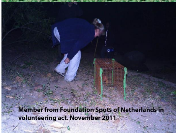
Member from Foundation Spots of Netherlands in volunteering act. November 2011