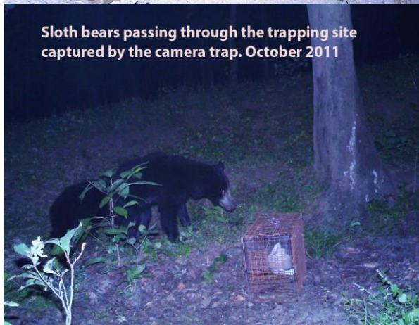
Sloth bears passing through the trapping site captured by the camera trap. October 2011