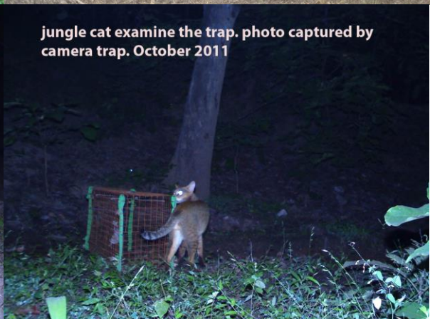
jungle cat examine the trap. photo captured by camera trap. October 2011