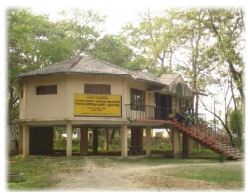
Picture 3: Conservation information center/wildlife museum at Sauraha