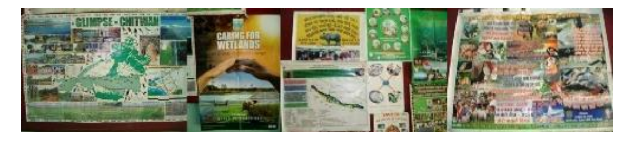
Picture 2: Some posters published for raising conservation awareness

A number of conservation awareness programs have been conducted through formal and informal ways in the project area. Conservation Education is one of the regular activities being conducted annually by the Park management through its buffer zone management program. Celebration of special days and weeks such as World Wetland Day, International Mountain Day, Wildlife Week, and International Day for Biological Diversity, World Environment Day, public meetings, broadcasting, and conservation message through local and national mass media such as radio, television and local FM stations are some of the many activities being conducted for raising awareness among public. Besides, school education program, video shows, wildlife games, competitive events like elocution, essay, quiz, art etc. targeting youths and school children are being conducted in the Buffer zone. Furthermore, the Department regularly publishes and distributes promotional materials such as brochures, posters, newsletter and bulletins. In addition, print and electronic media are in use to disseminate the conservation message.