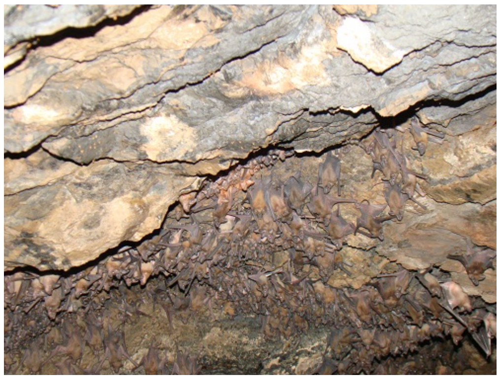
Sipa Mine, Near Jambughoda wildlife Sanctuary showing dominant congregation of Rhinopoma microphyllum and R. hardwickii.