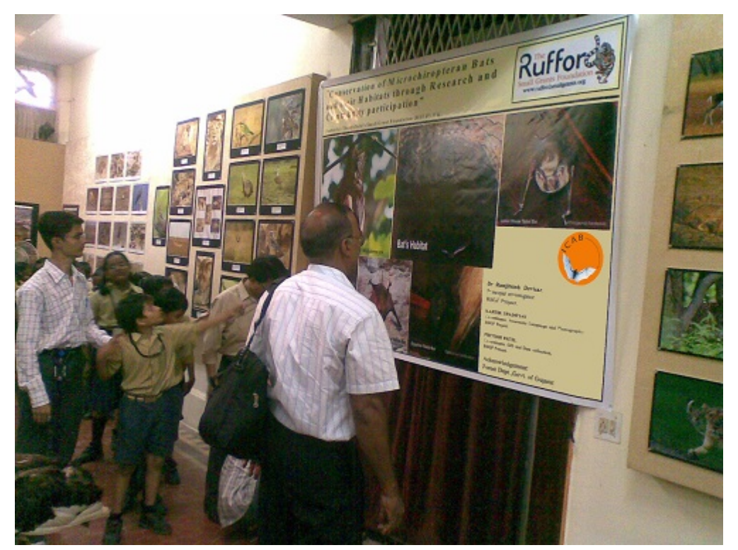
Poster on microchiropteran bats and its conservation displayed at Baroda Museum, Vadodara, during wildife week celebrations, 2nd to 10th October, 2010.