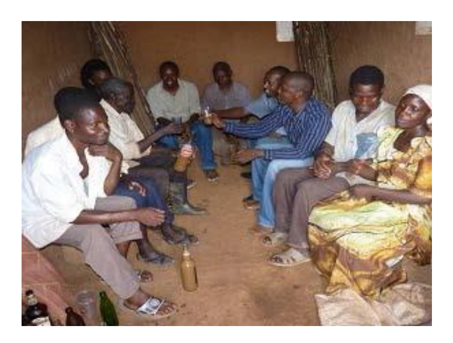
Project team having an informal meeting with the communities to create awareness about on-farm biodiversity conservation through cultural values approach