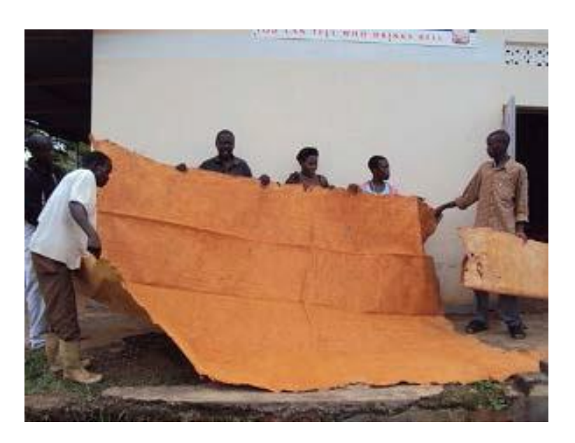
Community members displaying backcloth samples to be sent to Nairobi in quest for markets