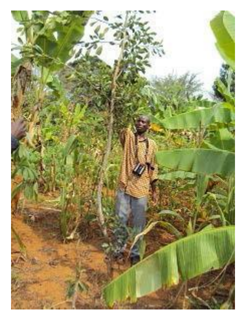
Community member showing extent of growth of one of the Ficus spp planted in the gardens