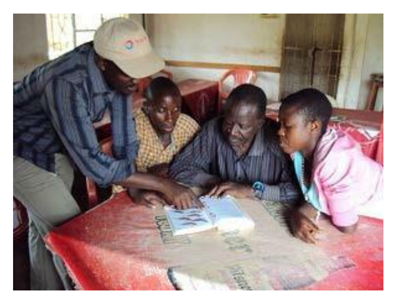
Team leader, having a preliminary chat with selected community members on bird identification skills and importance to conservation