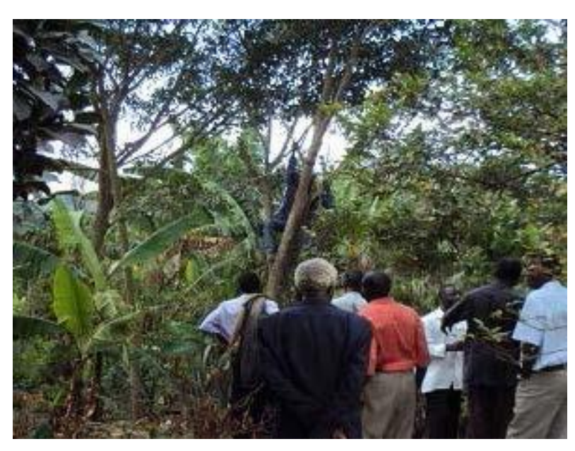
Community members during peer-review of Ficus trees progress with trainer