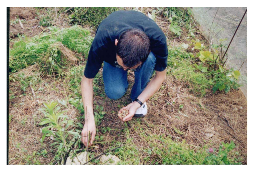
Collection of the juveniles