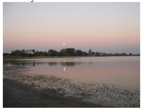
Picture 3. The salt lake inside Hola Prystan town, place of hunting of some Pipistrelle.