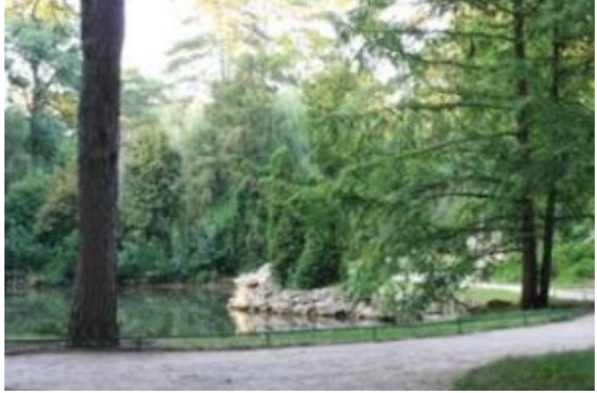
Picture 35. The artificial pond in dendropark of Askania Nova Reserve. We recorded very similar to Greater Noctule sound there.

We hope that we will get the permission for mistnetting bats in Askania-Nova and continue this important research.