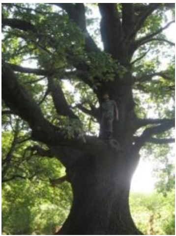
Picture 8. Anton Vlaschenko on the 300-yearsold oak tree in the "Volyzhin less" plot.