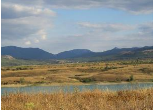
Picture 36. Vicinity of Belogorsk town. The Picture 37. Went in the Crimean Mountains. Crimean Mountains from the North side.