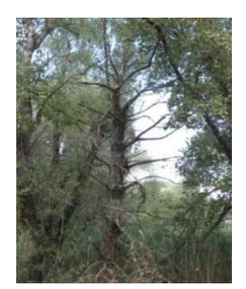
Picture 12. Habitats of the islands: a lot of bays Picture 13. There are some plots of old poplars and white willows at the Kuchugury islands. Photo by Anton Vlaschenko

and lake inside archipelago with sand-drifts and some trees. Photo by Anton Vlaschenko