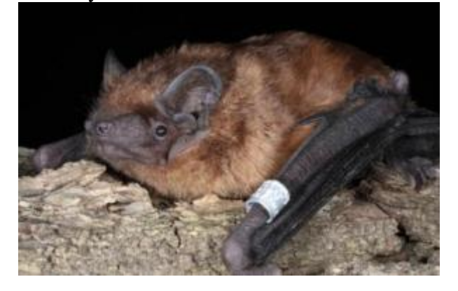
Picture 31. Anton Vlaschenko made a photo Picture 32. Adult female of N. noctula . of hollow with colony of Noctule bats. The Photo by Egor Yatsuk camera was bought by the project. Photo by Egor Yatsuk

We did not find Greater Noctule again. But our record of increased of bat number in August is very interesting and important. The bats mist-netted in Lesopark in August were born in another areas, maybe in the North (from Russia). The latest record of Greater Noctule in Kharkov Lesopark was done on 24 September (1936). We hypothesized there is a little chance to catch Greater Noctule within inter-migration-groups of Noctule bat. The mist-netting of bats during migration time in Lesopark will be continued.