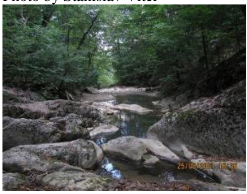
stream our mistnetting place.

We did some captures (mist-netting nights) in foothills but we targeted to get Kurasu stream in the old beech mountain forest. At the same time when Kseniia Kravchenko mist-netted bats in Kharkov Lesopark the other part of our team mist-netted bats at the Kurasu stream (pic. 40; table 3).