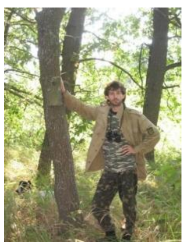
Picture 9. Remainders of artificial bird-boxes in forest of "Volyzhin less" plot.

Point 3 – Kuchugury islands (47°33' N, 35 °12' E) in the National Nature Park "Velikiy Lug". We chose this location as control point in migration part of range and hypothesized that it should be favorable plot for study the change in bat assemblage from month to month.