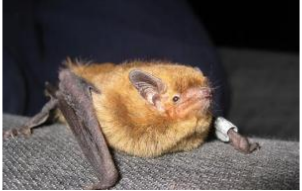
Picture 18. The most abundant bat species of Picture 19. Plecotus auritus - common species "Goloseevo forest" – P. pygmaeus .