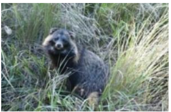
Picture 14. Shipping in September 2011. Left Picture 15. Raccoon dog - aboriginal of the Kuchugury islands.

The Kuchugury islands got protection state since flowage of the Kakhovka Dam Lake (more than 50 years). It is the part of National Park for the last 7 years (pic. 15). There weren't any human activity, only hunting for wetland birds. There is only one little house of fishers at the distant North island of the archipelago. (The fishers told us about some bats in the house in 2010).