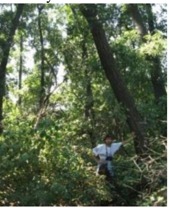
Picture 7. Anton Vlaschenko observed old alder forest plot.

We did not register any indicator of bat migration in "Volyzhin less" plot. It was very strange for us and we hypothesized that bat migration in this area should be later.