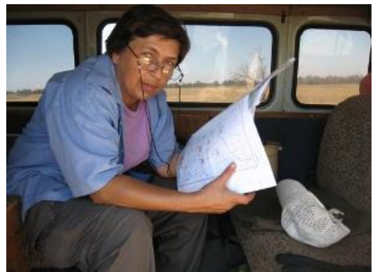
Chernomorsky Biosphere Reserve.

The second key point in Chernomorsky Biosphere Reserve was "Volyzhin less" plot where we went after Hola Prystan town. The plot is not big (2000 ha) area of natural steppe, free-saline lake and old oak forest (pic. 5) on the bank of the Dnepr river delta (11 km from the seaside of the Black Sea). The main method of bat identification was acoustic observation (Pettersson D100 and D200 bat detectors) and search of tree hollows (pic. 7-8). We identified only resident species (Eptesicus serotinus and P. kuhlii) that lived in the buildings of cordon (forestry). The local ranger of the plot said us that in 1970-80 there were big number of artificial bird-boxes and bats used them in migration time. Now the most of these bird-boxes are destroyed (pic. 9) for this time and bats ceased to stop in "Volyzhin less" plot.