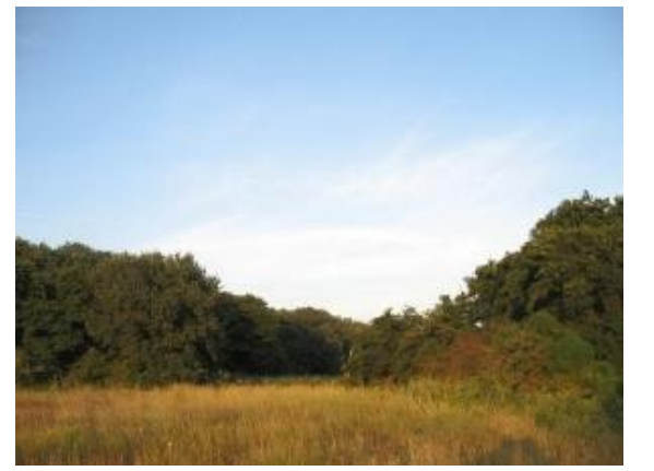
Picture 6. The edge of oak forest in "Volyzhin less" plot. Hunting habitat of E. serotinus and P. kuhlii.