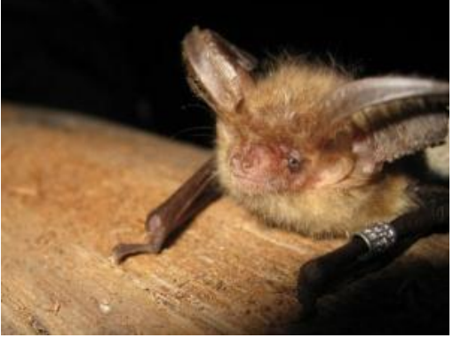
in "Goloseevo forest".

The "Goloseevo forest" is located within the limits of the Kiev city, and we were very surprised to see very old oaks, hornbeams and lime-trees more than 300 years old (pic. 16).