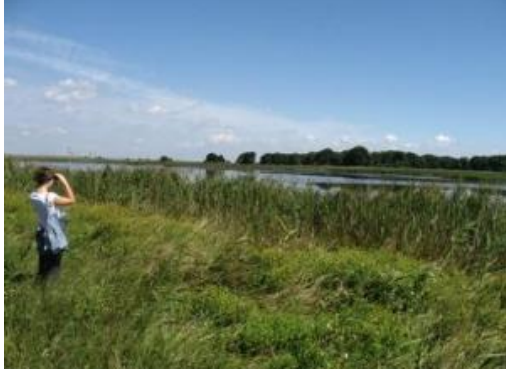
Picture 4. Dr. Z. Selunina teriologists of Picture 5. Kseniia Kravchenko on the bank of lake in "Volyzhin less" plot. There is old oak forest of the opposite bank of lake.