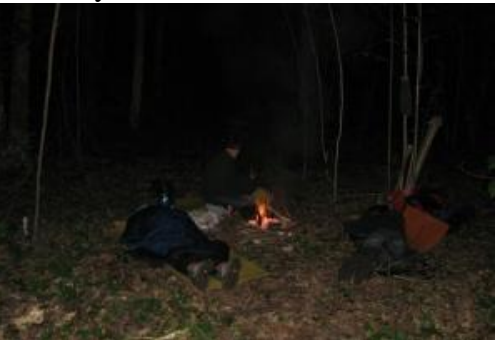
Picture 28. The night near a mist-net. Two asleep bodies on the front - young naturalists from circlet of Kharkov Zoo; in deep, Elena Hudyakova – theirs teacher.

The situation changed the better in June when 5 roosting trees of N. noctula were found (pic. 29-32). There were oaks with DBH 38-42 cm. We tried to inspect all of these colonies because of single Greater Noctules were found in colonies of Noctule bats (Vlaschenko et al., 2010) in 1930<sup>th</sup> in the forest.