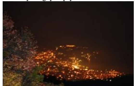
Picture 43. It was run high during recording bat sounds. The Yalta town on the seaside of the Black Sea.