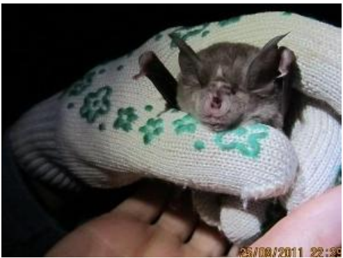
Picture 40. Greater Horseshoe Bat in our mistnet instead of Greater Noctule, at the Kurasu stream.

We did some captures (mist-netting nights) in foothills but we targeted to get Kurasu stream in the old beech mountain forest. At the same time when Kseniia Kravchenko mist-netted bats in Kharkov Lesopark the other part of our team mist-netted bats at the Kurasu stream (pic. 40; table 3).