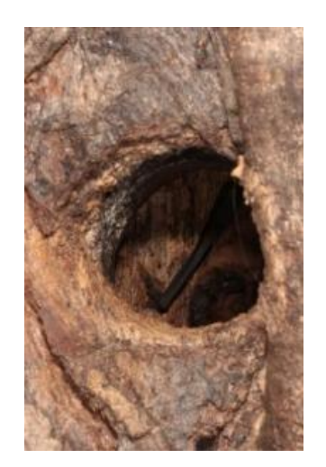
Picture 30. Nursery colony of N. noctula in old woodpecker hollow in oak. Photo by Anton Vlaschenko

Picture 29. Egor Yatsuk helped us to climb bat-tree-roost. Photo by Anton Vlaschenko