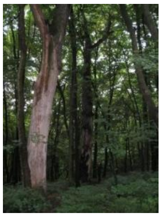
Picture 16. Near 300 years-old oaks in Picture 17. Near the harp-trap Dr. Lena "Goloseevo forest", roosting tree of nursery colony of P. pygmaeus and P. nathusii.

It was one of the most successful expeditions in our project (09-20 June 2011). We worked with zoologists from Kiev (pic. 17), and express great thanks for that wonderful collaboration. We caught 204 individuals of 8 bat species (table 2) for the short period of time (the paper about the results is in work now).