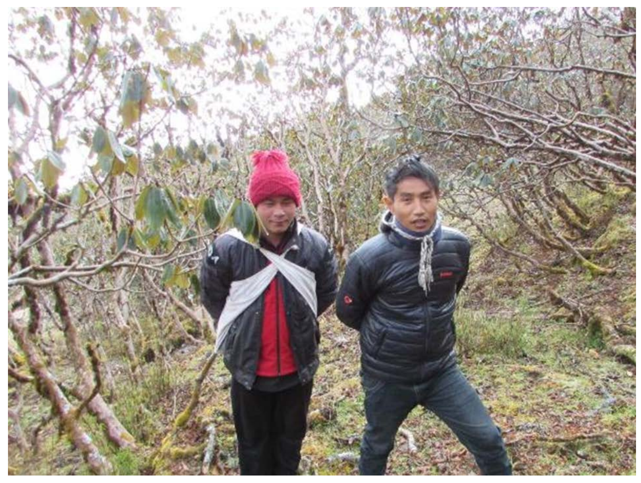
Field assistants in Rhododendron forest of Ghandruk

The forest around the village has less fruiting during the cropping season. We organised an orientation workshop with the village leaders for sharing the scheme development mechanism and seeking of their support during the process. The participants decided for the provision of 70% financial compensation of crop damage made by bear. The payment will be made by counting the maize cob damaged by bears at end of harvesting time. Another meeting will be organised in August 2018 for the filling of damage assessment form and the assessment form will be distributed to all farmers who involved in maize cultivation. It gives the no of farmers loose maize, no of times bear visit in land, amount of maize damage and the action taken for protection of crops. Each farmer will be requested to collect residue of maize cob left after bear damage.