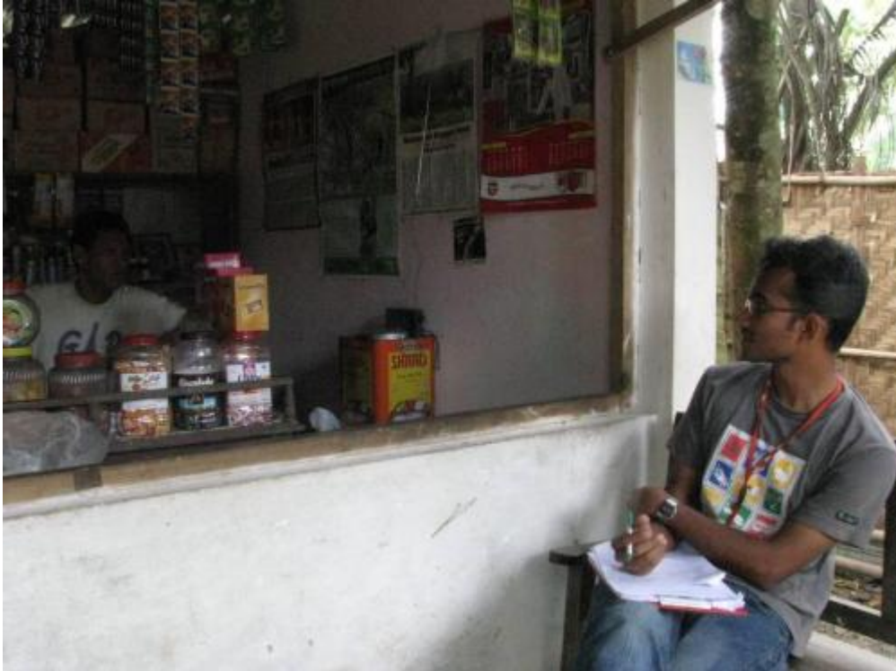
Figure 6: Interviewing a Tripura respondent in Tiprapara