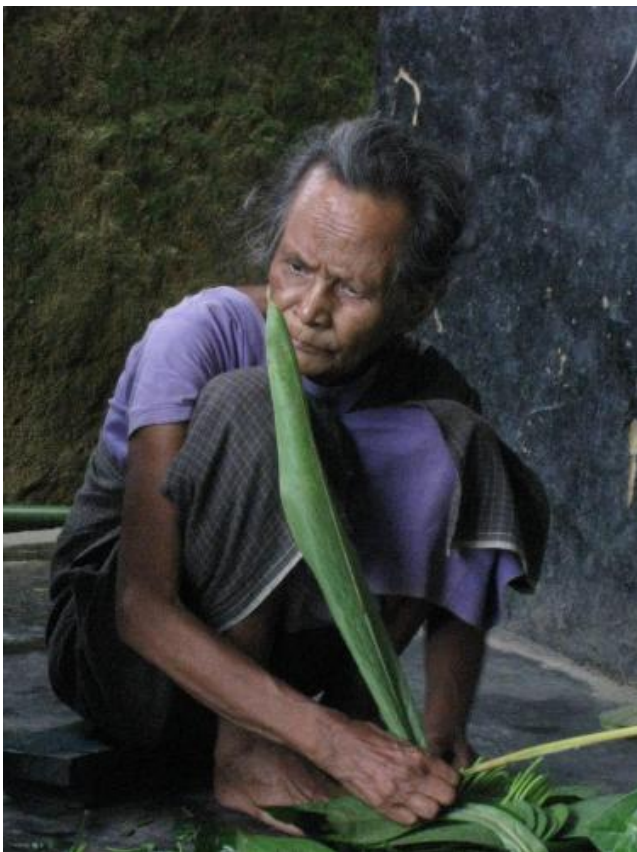
Figure 5: Age old Khasia woman