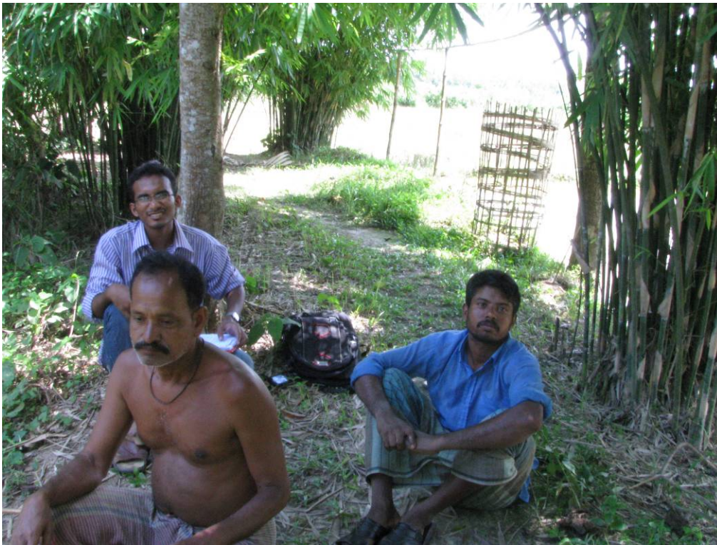
Figure 7: Interviewing a Manipuri herbal practitioner in field in Baligaon