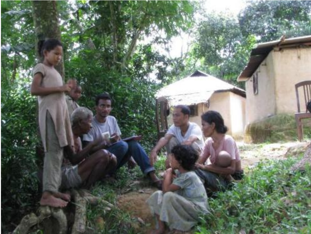
Figure 2: Conducting household ethno-botanical survey in Garobosti