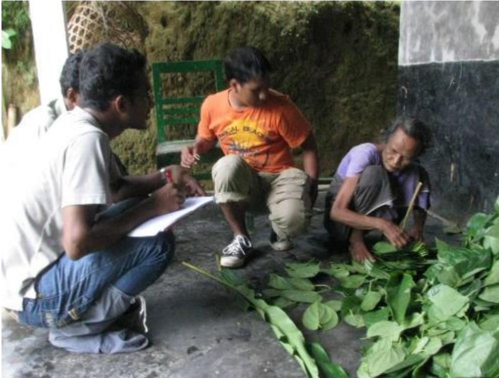
Figure 4: Interviewing an age old Khasia woman while working