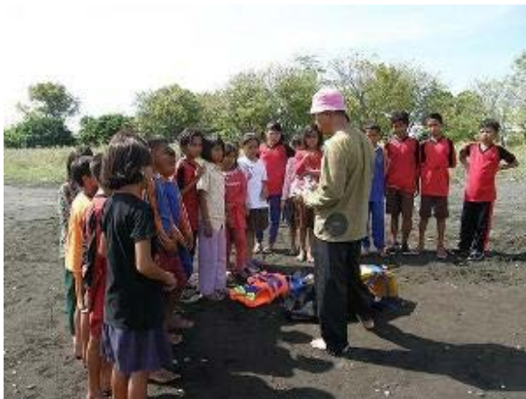
Safety procedure briefing

Field trip is conducted in the coastal area nearby. Students are introduced about safety procedure, how to use snorkeling set and how to identify the seagrass.