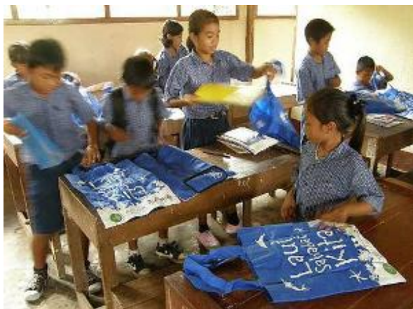
I got bag "Laut Sahabat Kita" ("The Sea is our best friend")

Every student received a bag with folders, a pencil and a water bottle. During the program, students will keep their works (worksheets) in the folder.