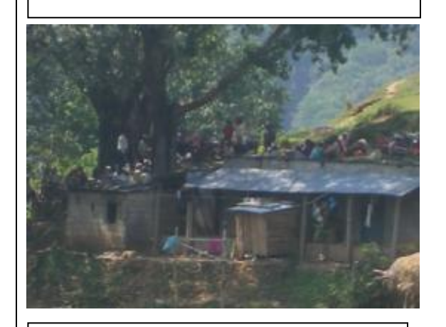
Action committee and local farmers' gathering on the experiment site