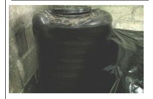
Bio-pesticide preparation in drum