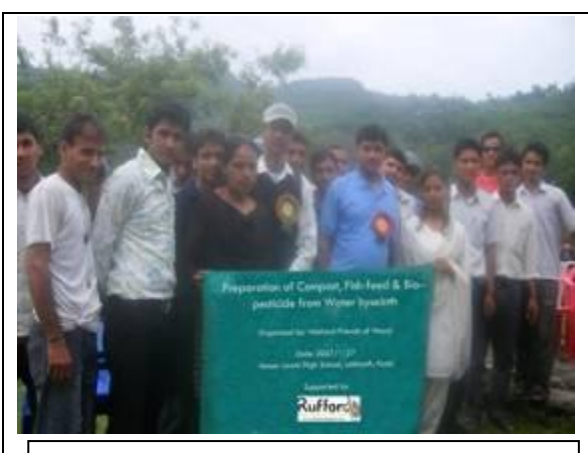
Action Team after the interaction, site visit and observation