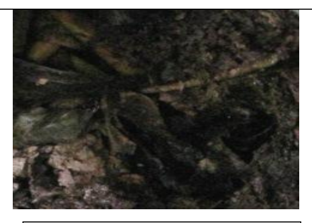
Fermented sample of fish-feed