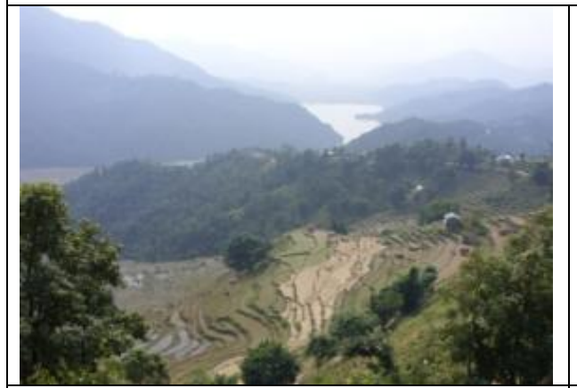
Project/Study Area (Rupa Lake and its catchment)