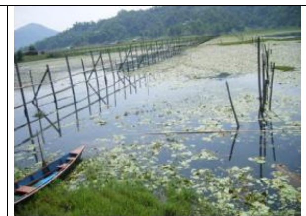
Fish Farming by a Farmers' group in Rupa Lake