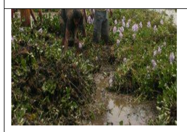
Water hyacinth collected for experiment