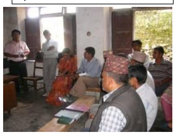
Discussion with CBO members and other stakeholders in Lekhnath