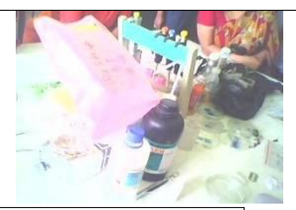
Glimpse of laboratory and lab test of the sample products