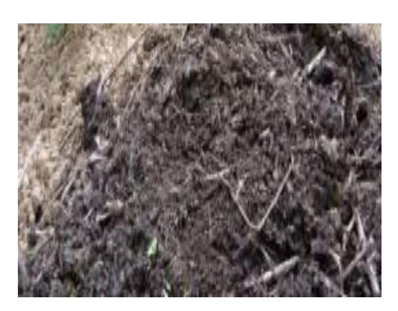
Dry compost produced from water hyacinth