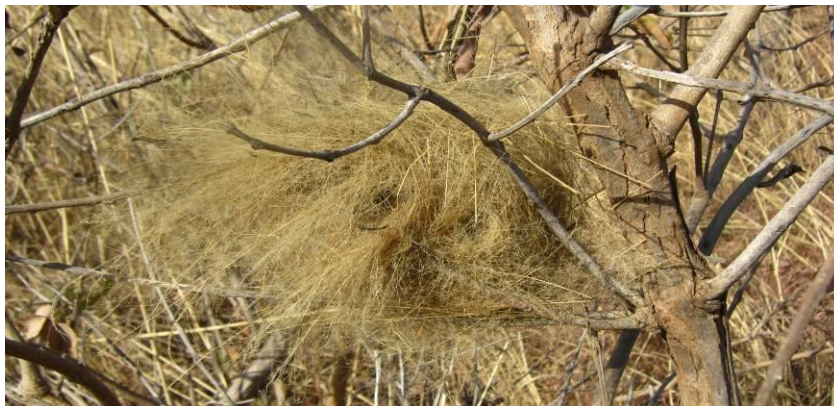
Newly constructed nest in the dry season (Chestnut-crowned Sparrow Weaver Plocepasser superciliosus ).