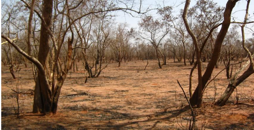
View of study area during dry season.

Data has been collected for the rainy season in 2009. More data is being collected for the dry season field work in 2010. Analyses of both season's data will be carried out as soon as the dry season data collection is completed.