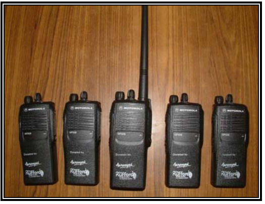
Photo1& 2- Wireless equipment donated in Gibbon Wildlife Sanctuary