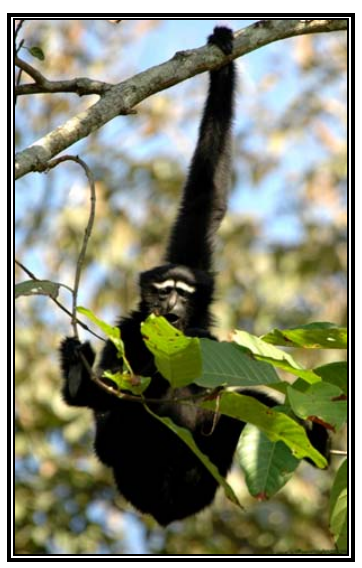
28 February 2006

Conservation of Hoolock Gibbon ( Bunipithecus hoolock ) and Asian Elephant ( Elephas maximus ) in Gibbon Wildlife Sanctuary, Assam, India through strengthening of communication and capacity building of frontline forest staff.