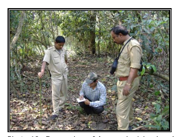
Photo 12- Researcher of Aaranyak giving hands on training to forest staff

A field base training programme was conducted for frontline staff to monitoring and maintaining records of wildlife. Researches of Aaranyak provided training to staff for monitoring both vegetation and animals.