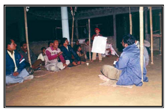
Photo 16- Public motivation meeting in fringe village of Gibbon Wildlife Sanctuary