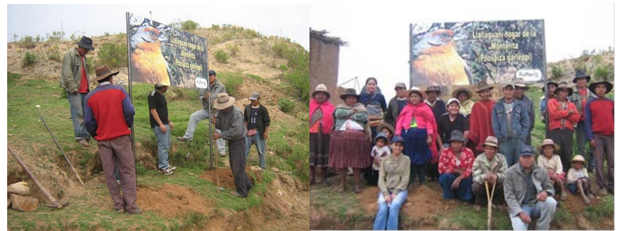
Left: Placing the sign in Llallaguani's entrance. Right: The sign, and some the local people of Llallaguani.