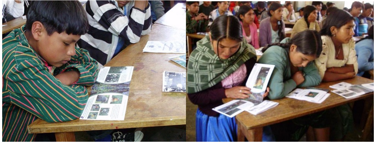
Left: One of the students, reading about Cochabamba Mountain Finch. Right: Students in one of the workshop with their respective educative material.

Left: Some of the students, showing the posters. Right: Teaching the students of Piriquina School, close to Llallaguani's forest, about Cochabamba Mountain Finch conservation and it's habitat.