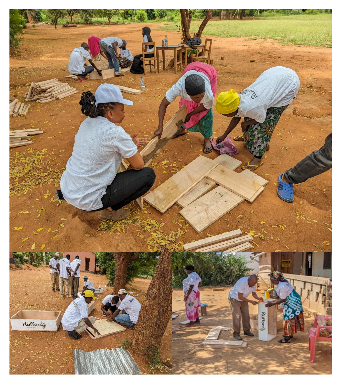
Figure 16: Some pictures during practical training sessions