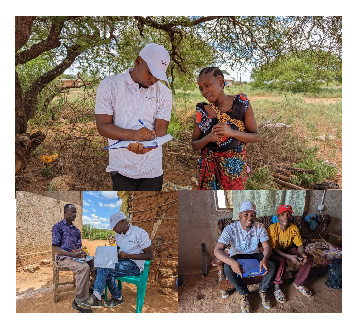
Figure 5: Some participants with researchers during data collection