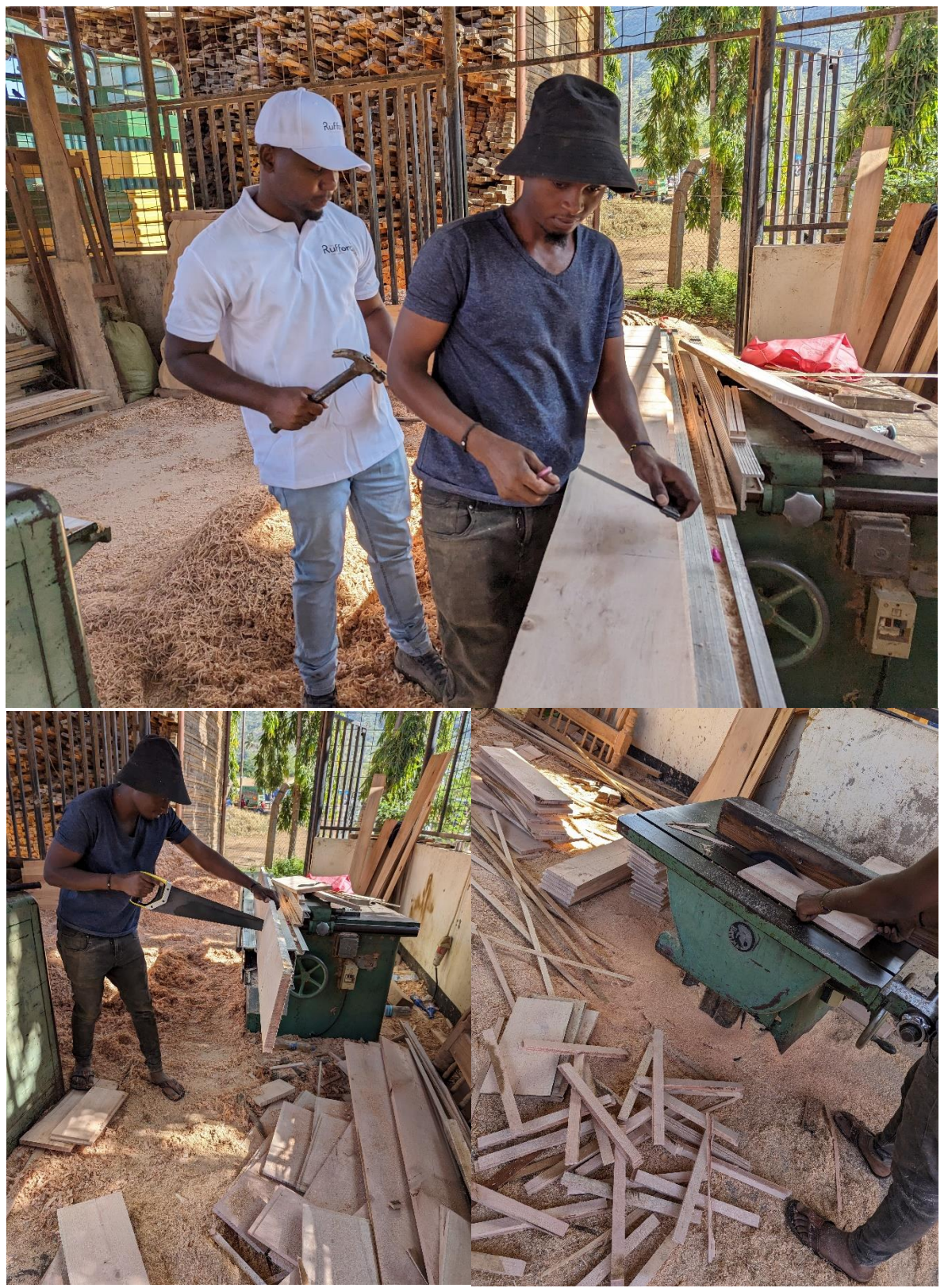
Figure 11: Some pictures taken during the preparation of materials for practical sessions