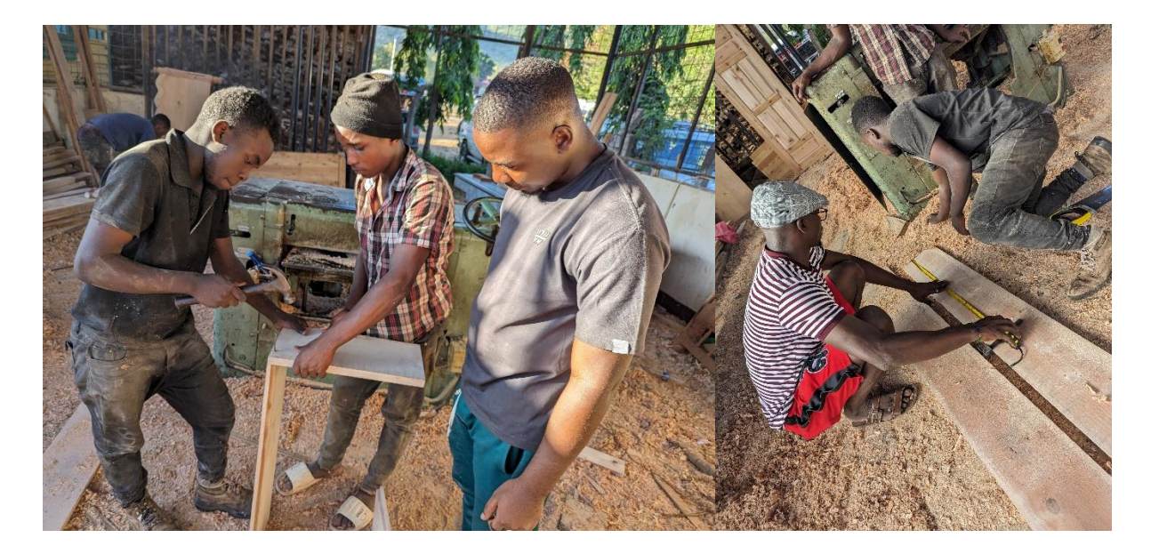
Figure 10: Some pictures taken during the preparation of materials for practical sessions