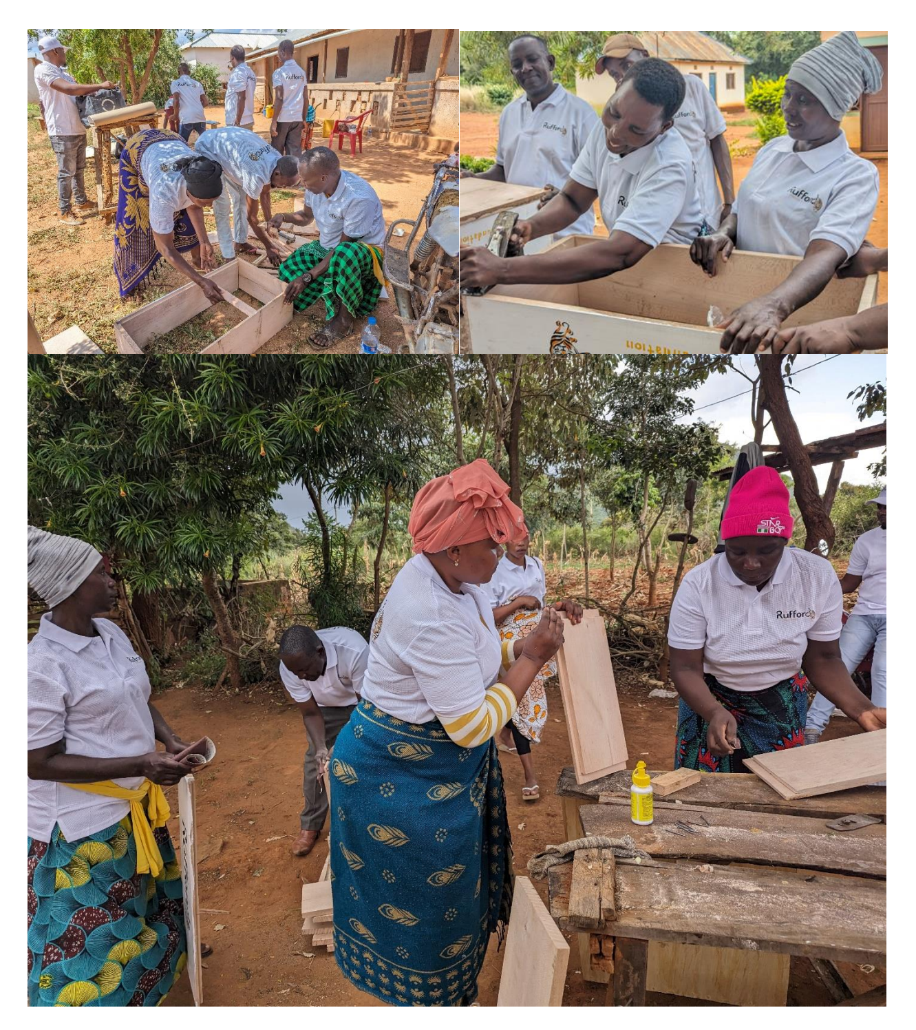
Figure 19: Some pictures during practical training sessions