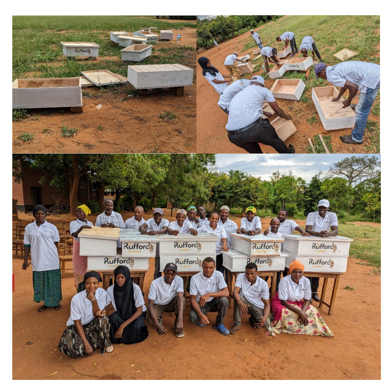
Figure 15: Some pictures during practical training sessions