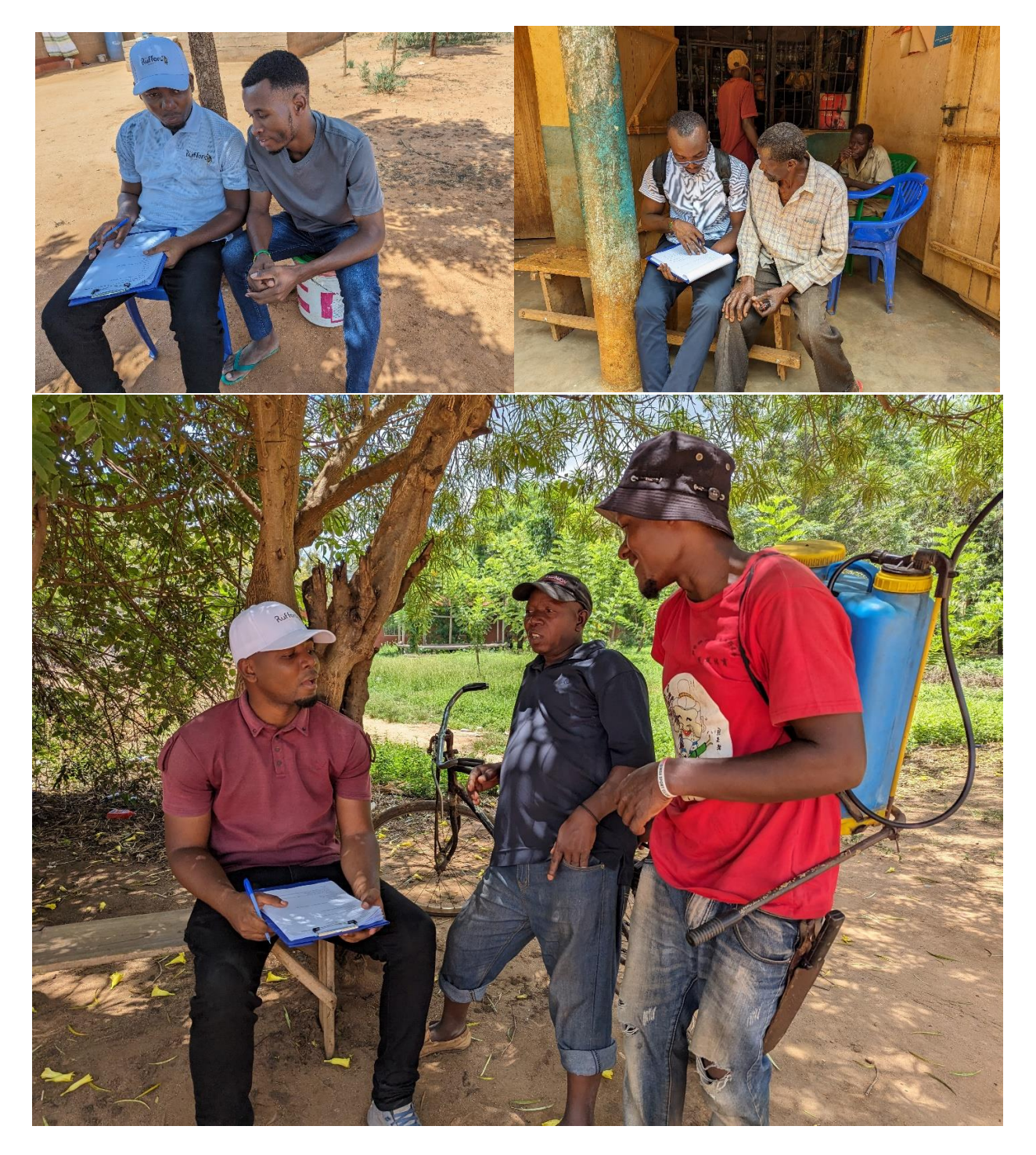
Figure 9: Some participants with researchers during data collection