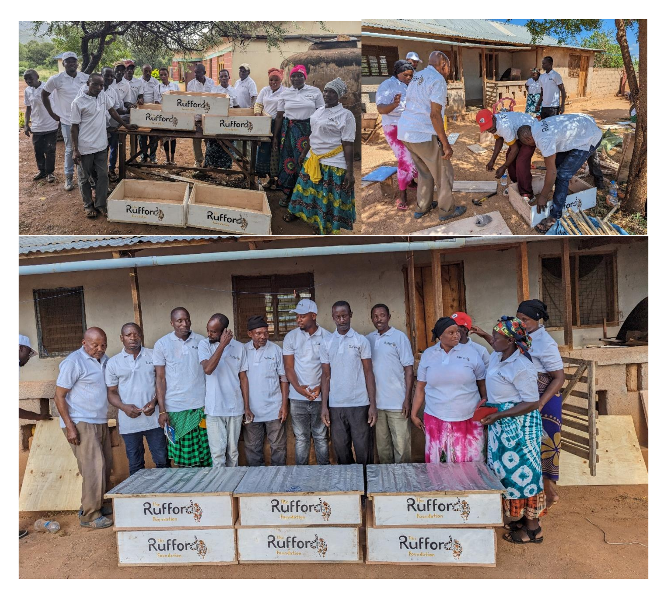
Figure 20: Some pictures during practical training sessions