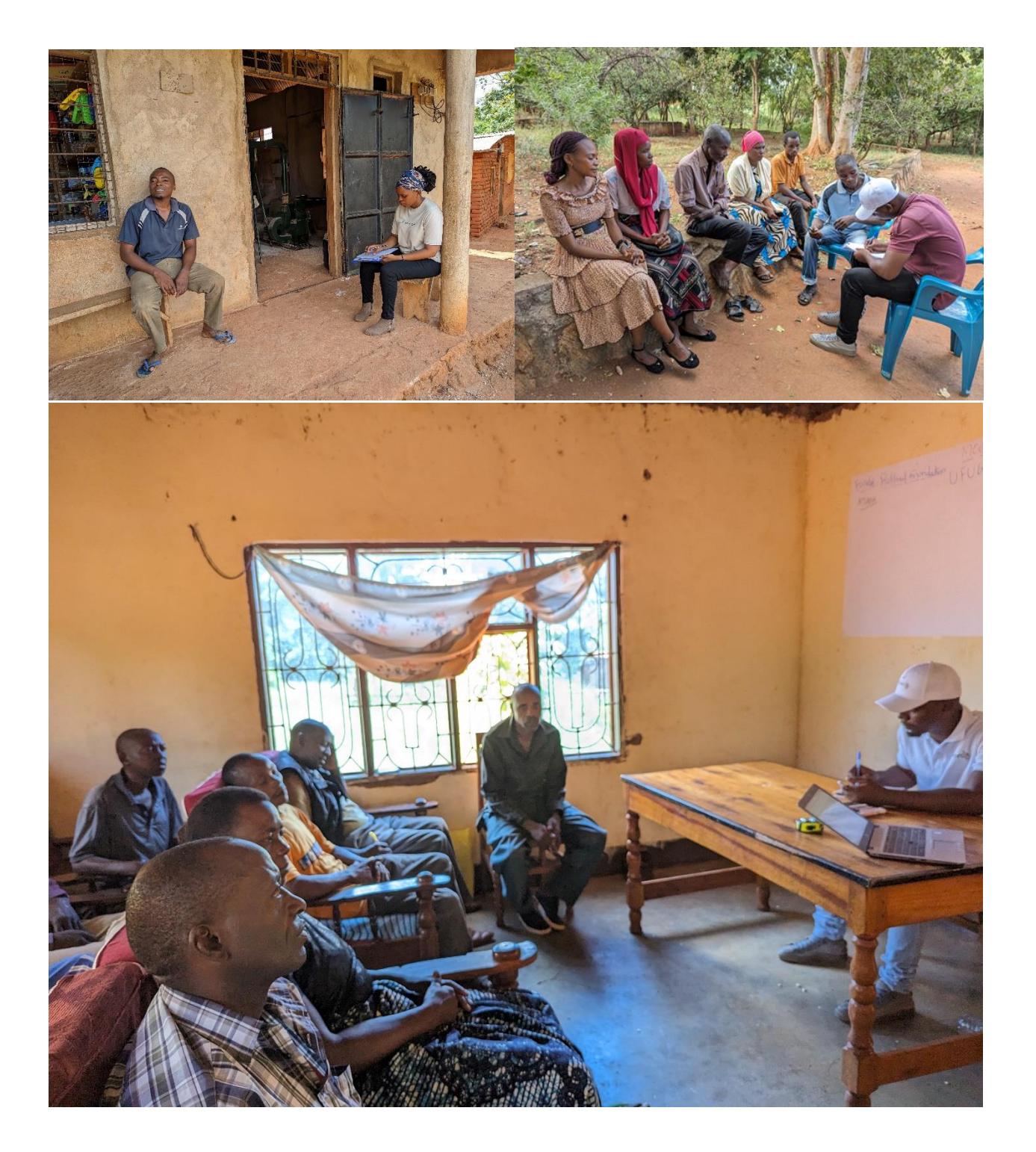
Figure 4: Some of the participants during data collection