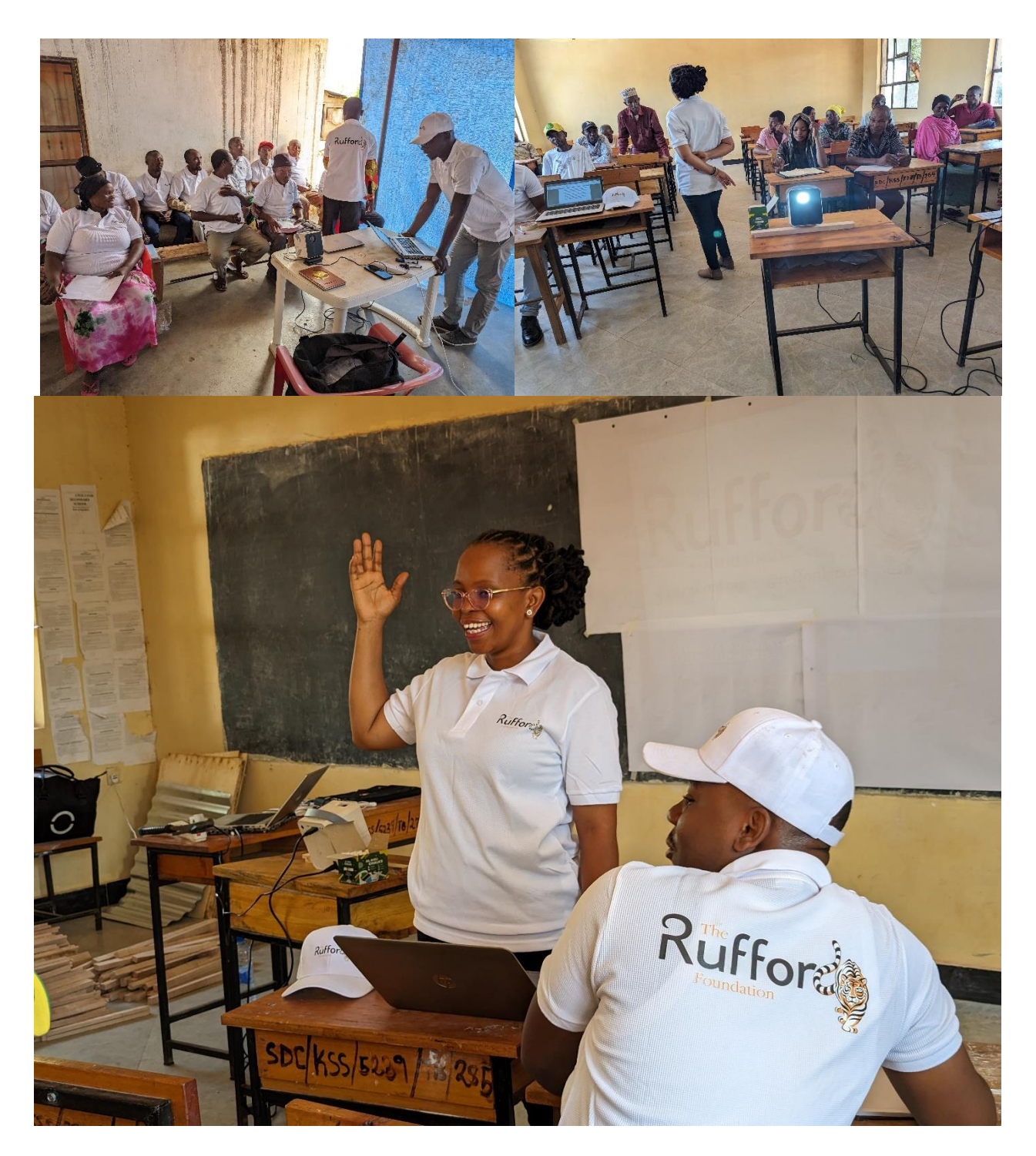
Figure 12: Some pictures during theoretical training sessions