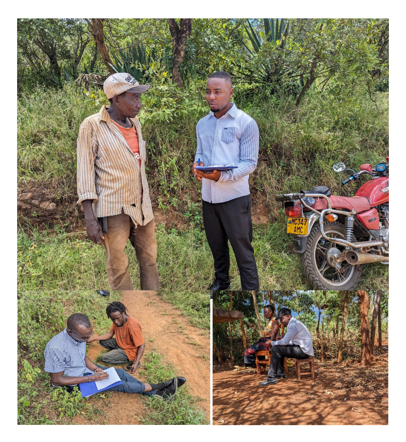
Figure 3: Some of the participants during data collection (questionnaires)