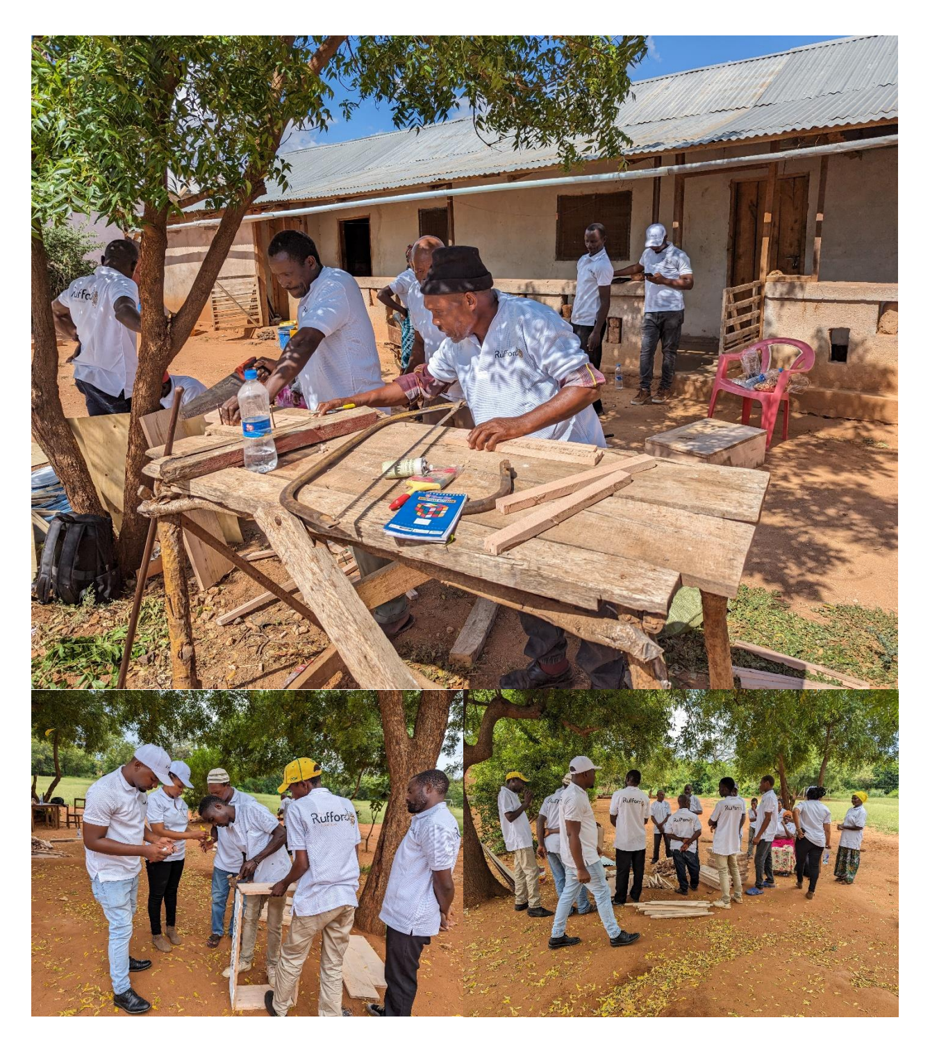
Figure 17: Some pictures during practical training sessions