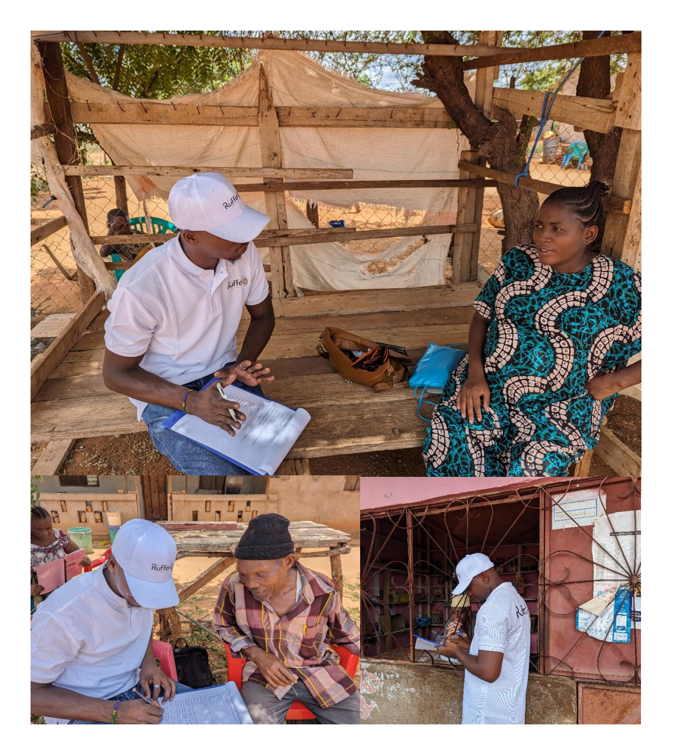
Figure 6: Some participants with researchers during data collection