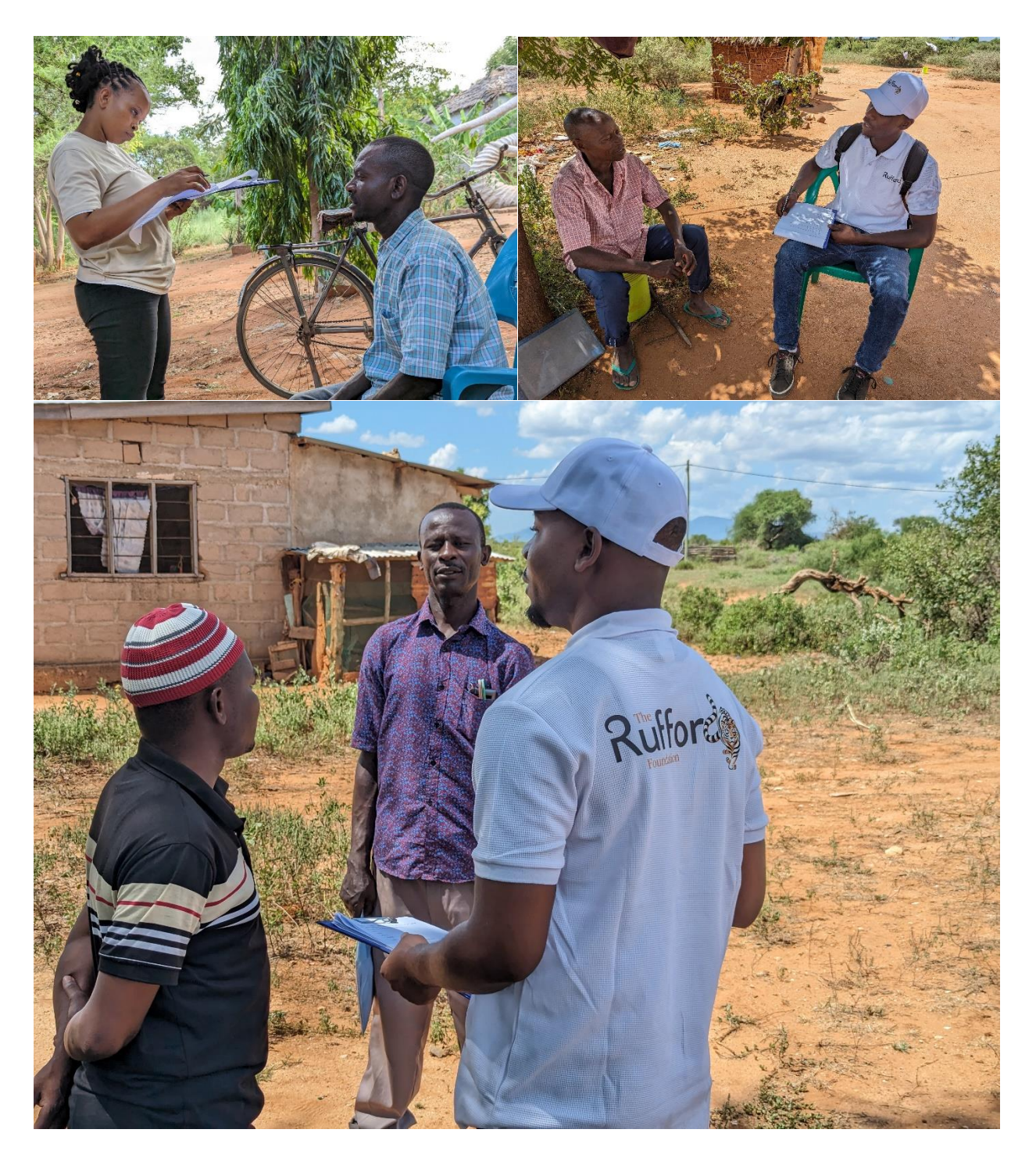
Figure 7: Some participants with researchers during data collection