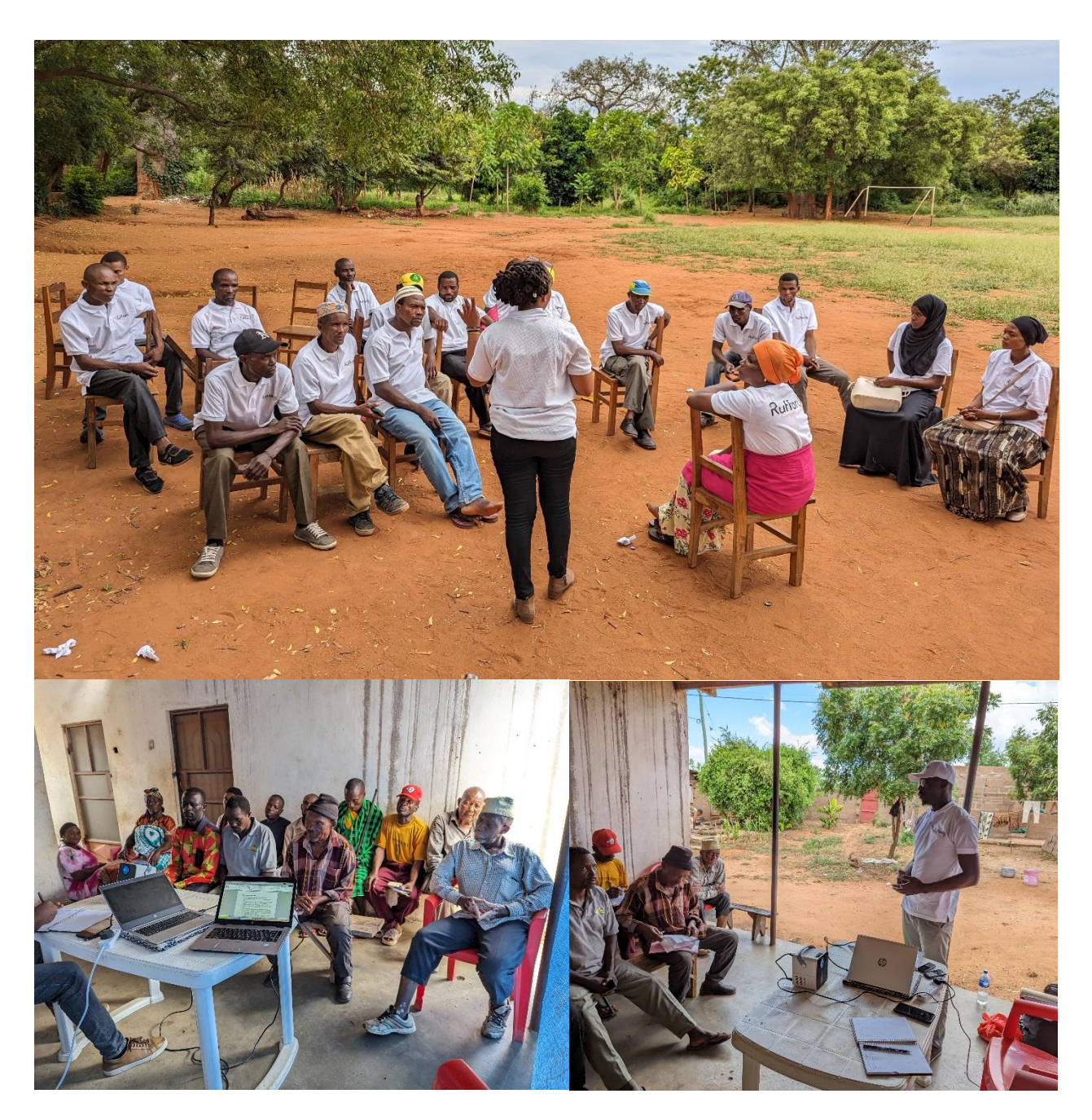
Figure 14: Some pictures during theoretical training sessions