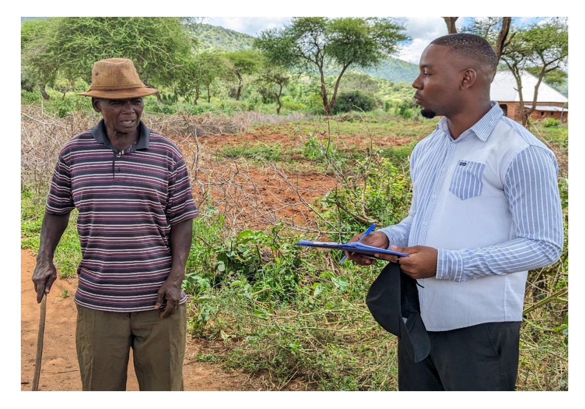
Some of the pictures were taken during the data collection.

The data was collected for 20 days, from 5 February to 24 February 2024. Days were spent at each study site to meet the targeted number of participants, especially for questioners; five days were spent in each ward of interest.