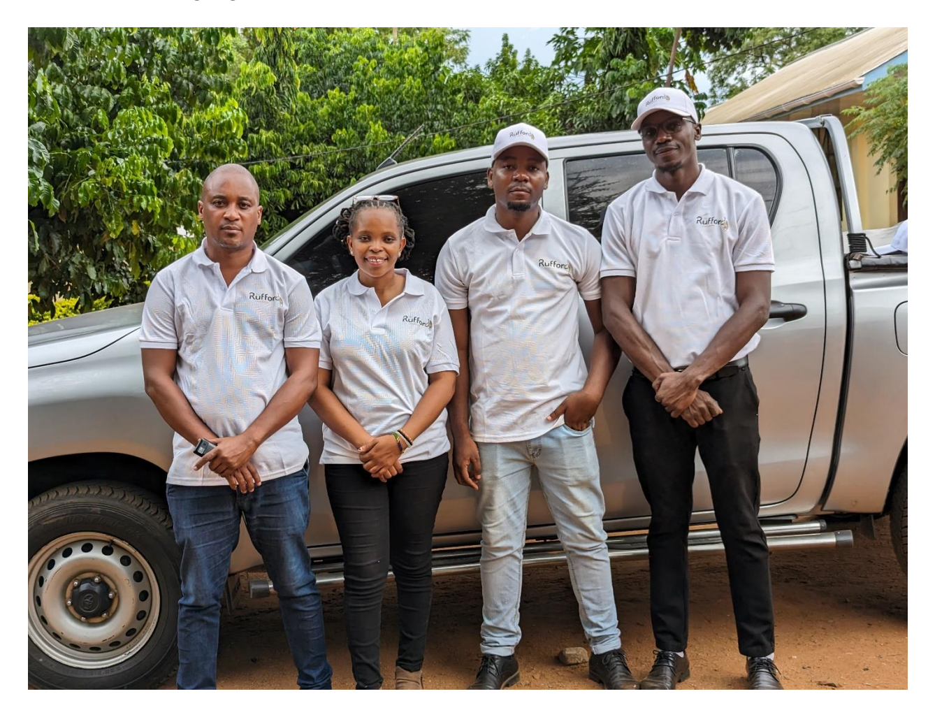
Figure 1: Project team members.

The project started on 5th February 2024, with data collection from 200 participants (semi-structured questionnaires), four key informants, and four groups (focus discussion groups). Site visitation and communication with the community around the study areas were conducted with the help of the district beekeeping officers. During the organization of the data collection activities, different households of interest were identified, and communication was made to the wards and village government officials as part of the introduction.