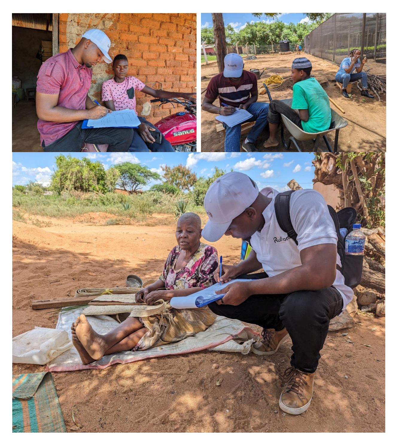
Figure 8: Some participants with researchers during data collection