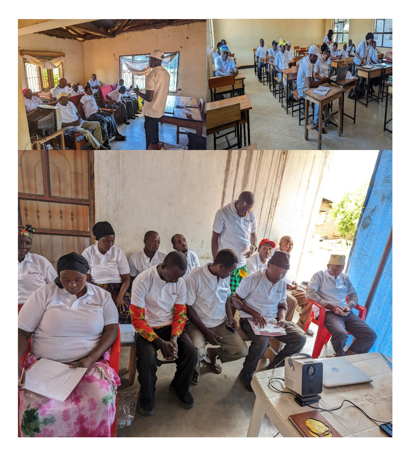
Figure 13: Some pictures during theoretical training sessions