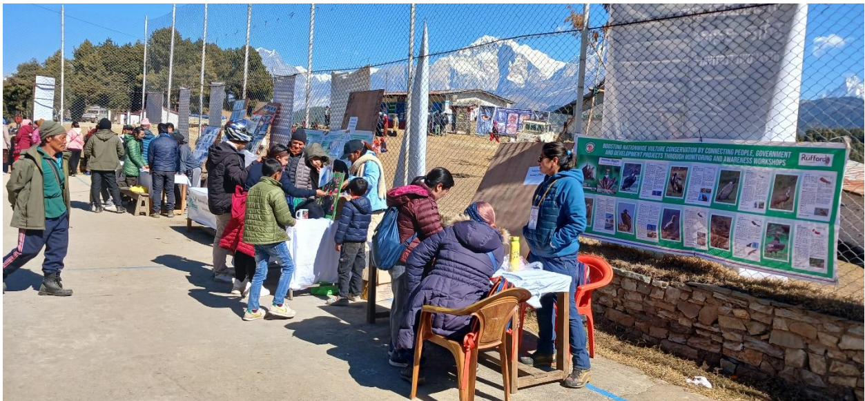
Participation and display of vulture poster in Nepal Owl Festival, 2024