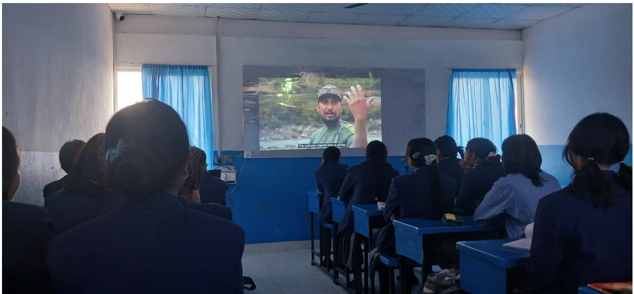
Vulture Awareness program in Srijana Secondary School.

- NSAIDs Monitoring in Gandaki Province (Kaski, Tanahau, Lamjung, Parbat, Baglung, Kusma, Syanja, Nawalpur,)- Total 24 Vet medicine shops were indirectly observed. No diclofenac and other NSAIDs harmful to Vultures were recorded.