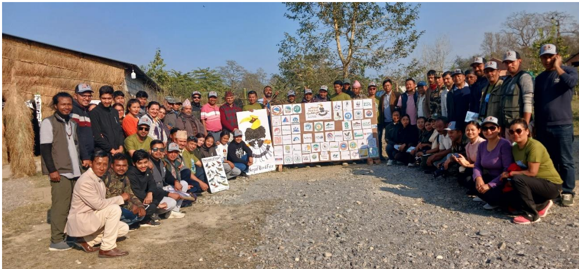
Participants from different parts of Nepal in 2 nd Nepal Bird Fair 2024,