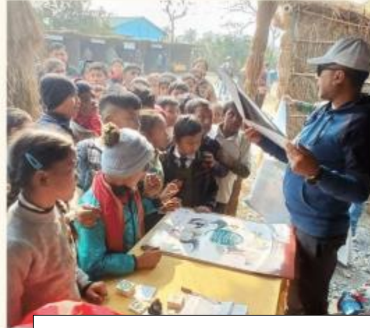
Vulture awareness to school students during 2 nd Nepal Bird Fair 2024