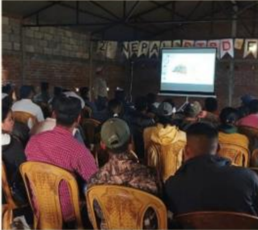
Vulture Identification training for Nature guide

Together with Pokhara Bird Society school awareness program was conducted. Bird conservation awareness campaign was conducted in 18 government and private schools (Annex III) targeting more than 2000 students. Volunteers of Pokhara Bird Society spend 4 days earlier the Nepal Bird Fair to make it happen successfully.