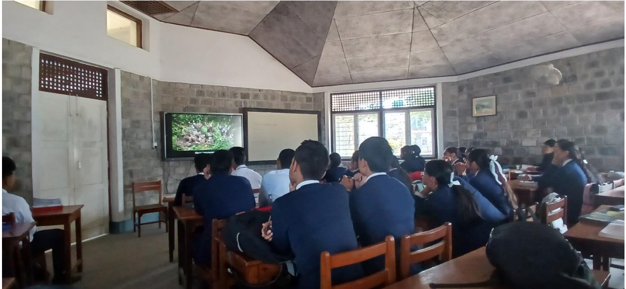
Vulture Awareness program in SOS Hermann Geinmer School Gandaki