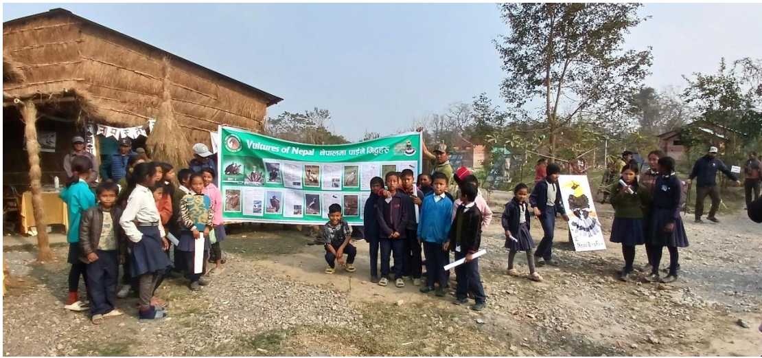
Students from local school trying to observing the vulture poster in 2 nd Nepal Bird Fair 2024