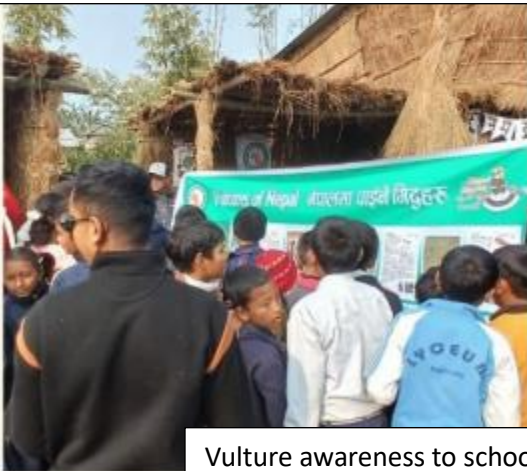
Vulture awareness to school students during 2 nd Nepal Bird Fair 2023