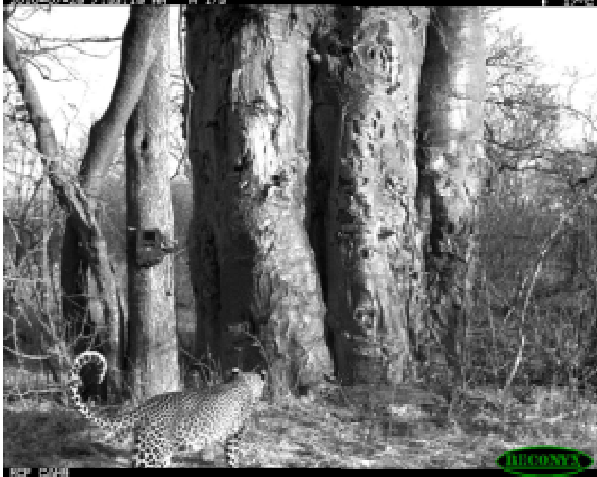
Our first camera-trap images of lions and leopards, from the Wildlife Management Area

We also recorded our first images of serval, honey badger, aardwolf, zorilla, white-tailed mongoose and bushy-tailed mongoose. All the camera-trapping data are now being compiled and the GPS locations sent to the Tanzania Wildlife Research Institute (TAWIRI), so the Ruaha data can be incorporated into the Tanzania mammal and carnivore distribution maps. We have been very pleased with the camera-trapping so far, particularly as we have been able to provide TAWIRI with the first 'dots on the map' for the Ruaha study area for a variety of species, including the zorilla, bushy tailed mongoose and aardwolf.