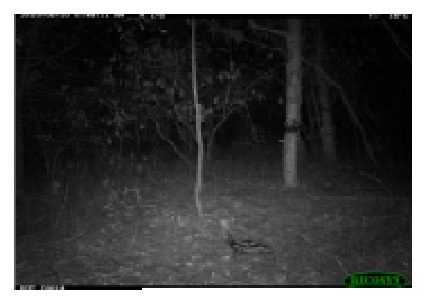
RCP camera-trap photographs of aardwolf, bushy-tailed mongoose and zorilla

In addition to confirming the presence of a species in an area, we can use camera-trapping to identify animals which have clear individual markings, such as leopards, cheetahs and spotted hyaenas. If camera-trapping is done intensively enough, this information can be used to provide an estimate of how many individuals of that species live within the surveyed area.