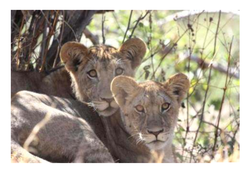
Two young lions observed and identified by RCP staff near Msembe in Ruaha National Park

The Ruaha Carnivore Project is aiming to collect information on as many carnivore sightings in the Ruaha landscape as possible, so that we can gather data on carnivore abundance and distribution, and the lodges and villagers have all been very useful in helping us collect this information. We have distributed 'Large Carnivore Sightings Forms' to the lodges, as well as GPS units wherever possible, so that we can obtain accurate information on where large carnivores are being seen. The RCP then follows up on this information, returning to areas where carnivores are often seen, and photographing any carnivores seen, so that they can be identified and added to the RCP carnivore identification database. The information is also sent to the Carnivore Centre at TAWIRI, so that the national carnivore distribution maps can be updated with all the most recent information from the Ruaha area.