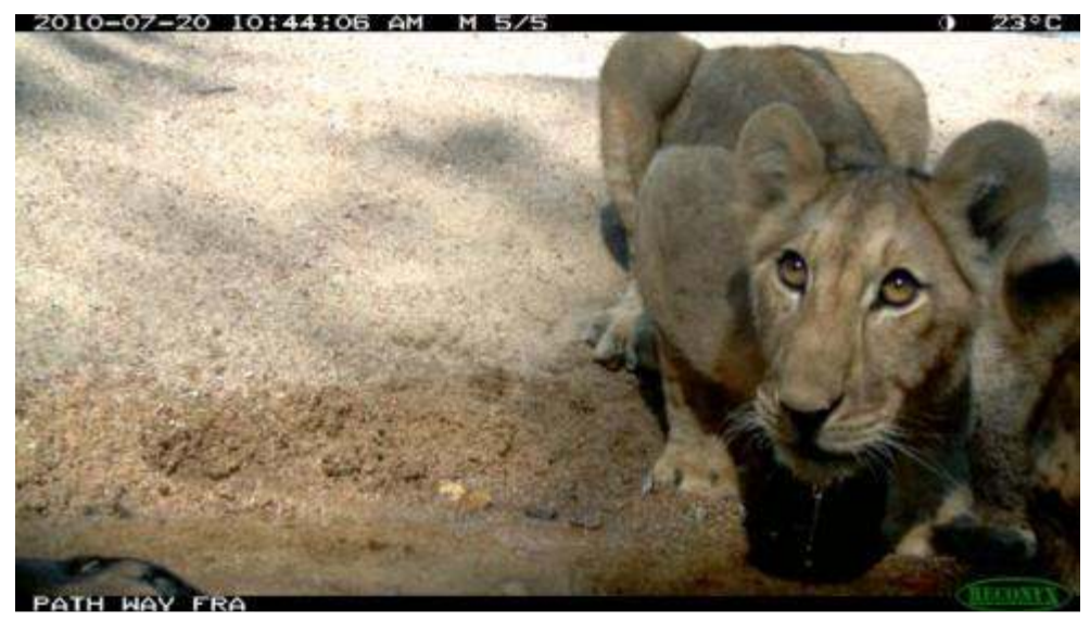
Young lion captured by a camera-trap set up by Mwagusi Safari Camp. This photograph is good enough for us to identify the lion from its whisker-spot pattern, adding extremely important data to our carnivore identification database

Unfortunately, our camera-trap at Ruaha River Lodge stopped working, just as a mating pair of leopards and a pack of 9 wild dogs started using the area where it was set up! These cameras are very expensive (around US$ 500 each), but provide extremely valuable data for the project, so fund-raising for more cameras is a top priority for the project.