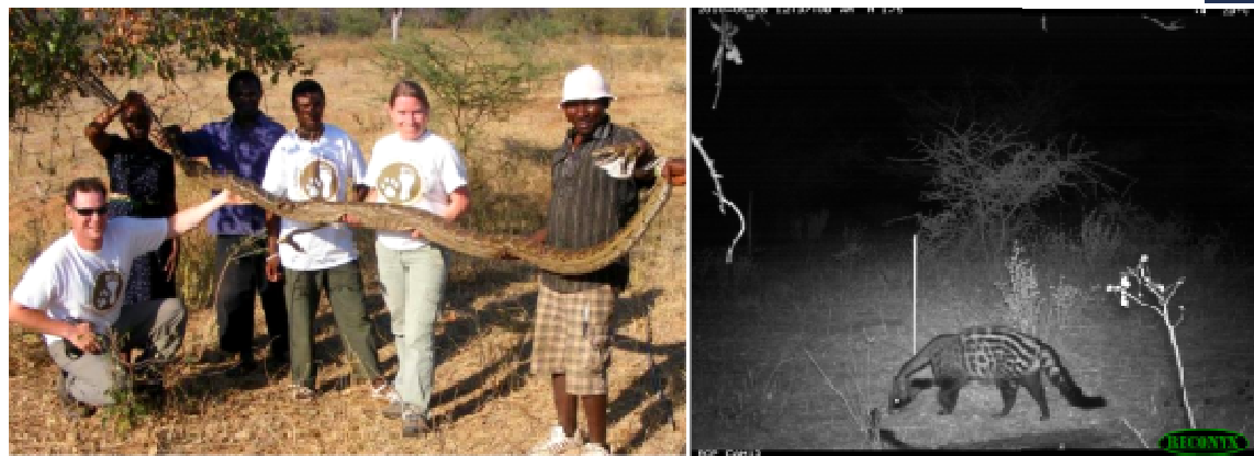
Having a look at the python, and the civet that later came to sniff at the carcass

In other exciting developments, we finally managed to accrue enough money (mainly from the Kaplan Fellowship) to buy our own second-hand field vehicle. It is a LandRover Discovery, and we are thrilled to have our own car. However, with the growing activities and size of the RCP team, a lack of vehicles is still the biggest issue we face, and one we are continually trying to fund-raise for.