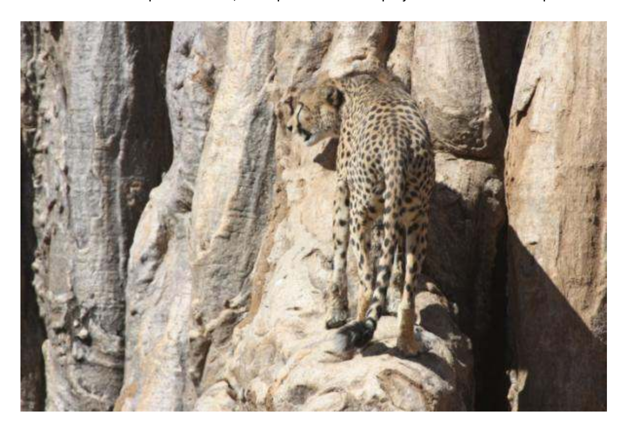
A male cheetah observed scent-marking a baobab tree near Campsite no. 1 in Ruaha National Park. The Ruaha landscape is an important area for cheetah conservation

The RCP is focusing in particular on five large carnivore species: lion, leopard, cheetah, African wild dog and spotted hyaena. The activities initiated, and progress so far, for both these aims will be reported below, and updates on other project activities are also provided.