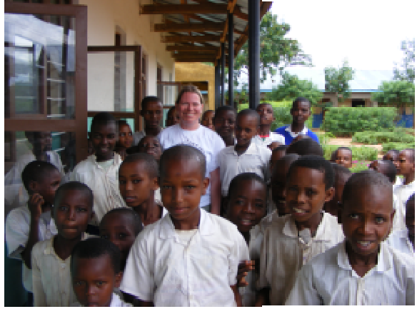
One of the classrooms and some of the students at Kitisi Primary School

The RCP also provides direct benefits from its presence on village land, as we pay rent annually to Kitisi village, thereby providing important economic benefits to the village, which is linked to the presence of carnivores. Our rent this year has contributed to a roof for the new schoolhouse, so we are very pleased to provide some benefits for Kitisi village.