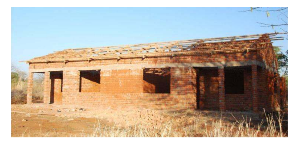
The schoolhouse in Kitisi: rent from RCP paid for the roof to be constructed

The RCP also provides direct benefits from its presence on village land, as we pay rent annually to Kitisi village, thereby providing important economic benefits to the village, which is linked to the presence of carnivores. Our rent this year has contributed to a roof for the new schoolhouse, so we are very pleased to provide some benefits for Kitisi village.