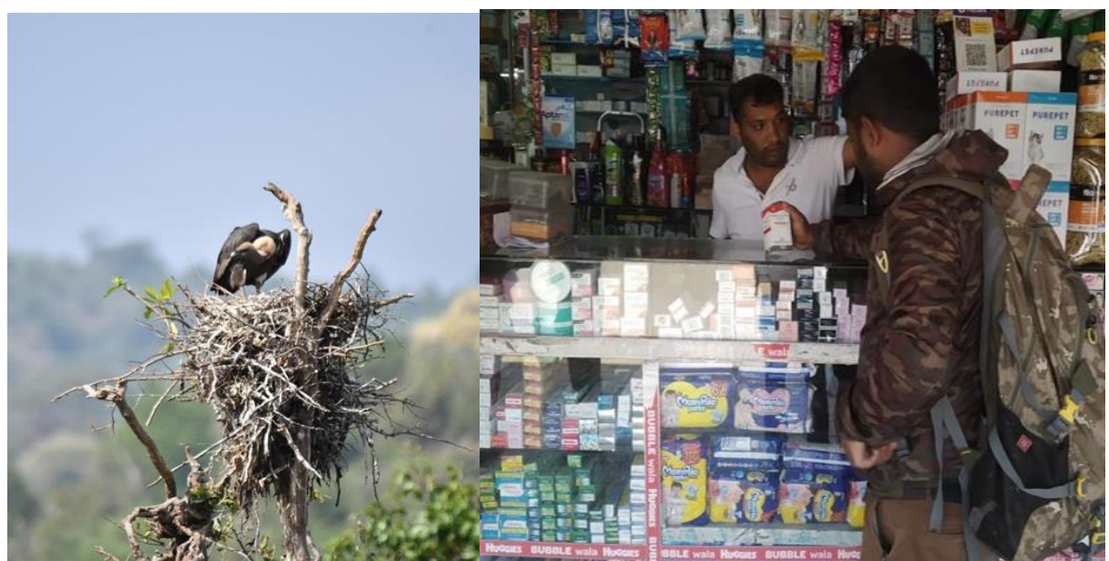
White-rumped vulture on the nest, during the synchronized vulture survey. During the pharmacy market surveys.