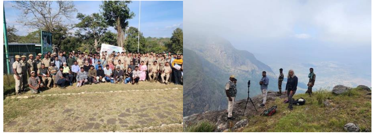
Synchronized vulture survey December 2023 team at Mudumalai Tiger Reserve Vulture monitoring during the synchronized vulture survey.

As I am unable to start my tree surveys and started my pharmacy surveys late.