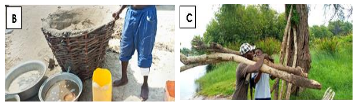
Photo 6 : Mangrove ecosystem degradation for fuelwood purpose (A), basket making for salt production (B) and trees harvesting as building material (C).