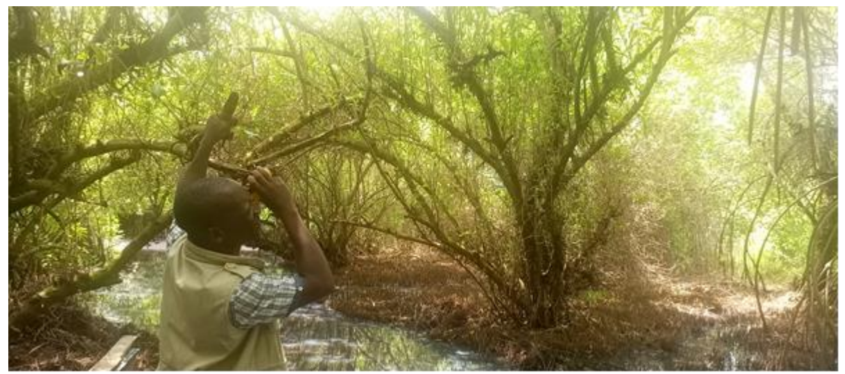
Photo 3 : Total height (H; m) measurement using a digital hypsometer (Nikon Forestry Pro II Laser).

The geographic coordinates of each plot, sample or specimen were recorded using the GPS to map the main vegetation types, species distribution, and priority habitats for biodiversity conservation.