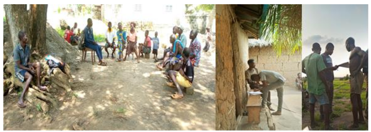
Photo 5: Group discussion and Individual interview with local people

A survey was conducted with local population to determine species which are threatened in the area according to their perception and field survey. They were also be surveyed on the land use types and anthropogenic pressure which threaten species conservation (Photo 5)