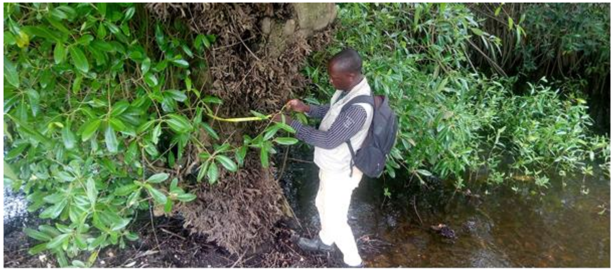
Photo 2 : Diameter at breast height (DBH) of mangrove (Avicennia germinans) tree measurement.

In the field, the diameter at breast height (DBH) of the trees and the total height (H; m) were measured using a diameter tape (Photo 2) and digital hypsometer (Nikon Forestry Pro II Laser) (Photo 3) respectively.