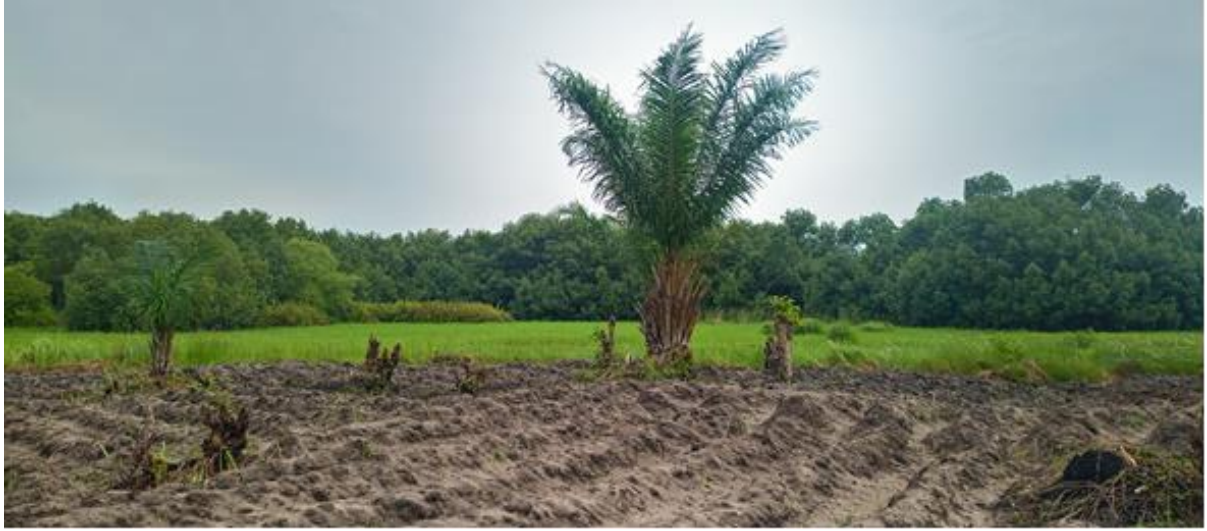
Photo 7 : Land requirement for farming within the coastal lagoon landscape (CLL) at the 1017 Ramsar site.