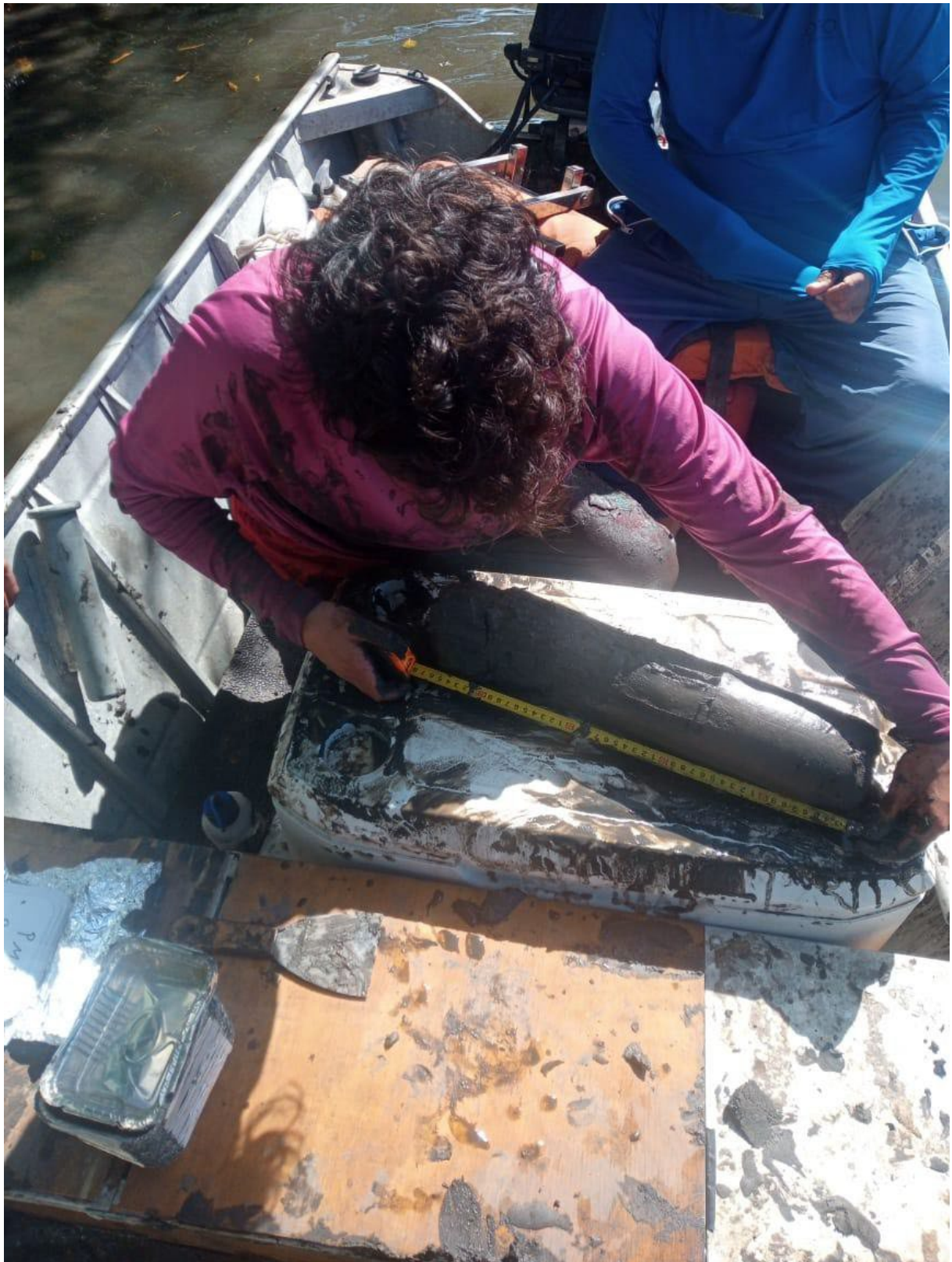
Figure 3. Photo of one of the sediment cores sampled at the Piraquê Açú-Mirim estuary.