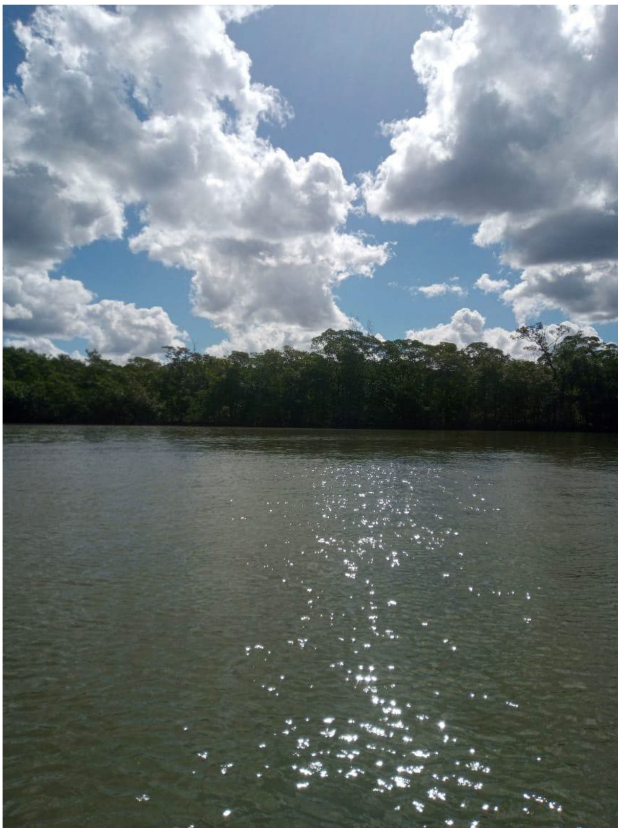
Figure 2. Photo of the sampling stations at the Piraquê Açú-Mirim estuary.