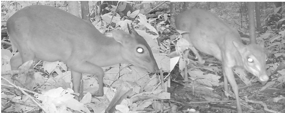
Figure : Identification of potentiel ebony disseminators using camera traps