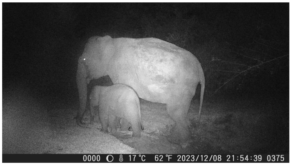
Camera trap images from the field.