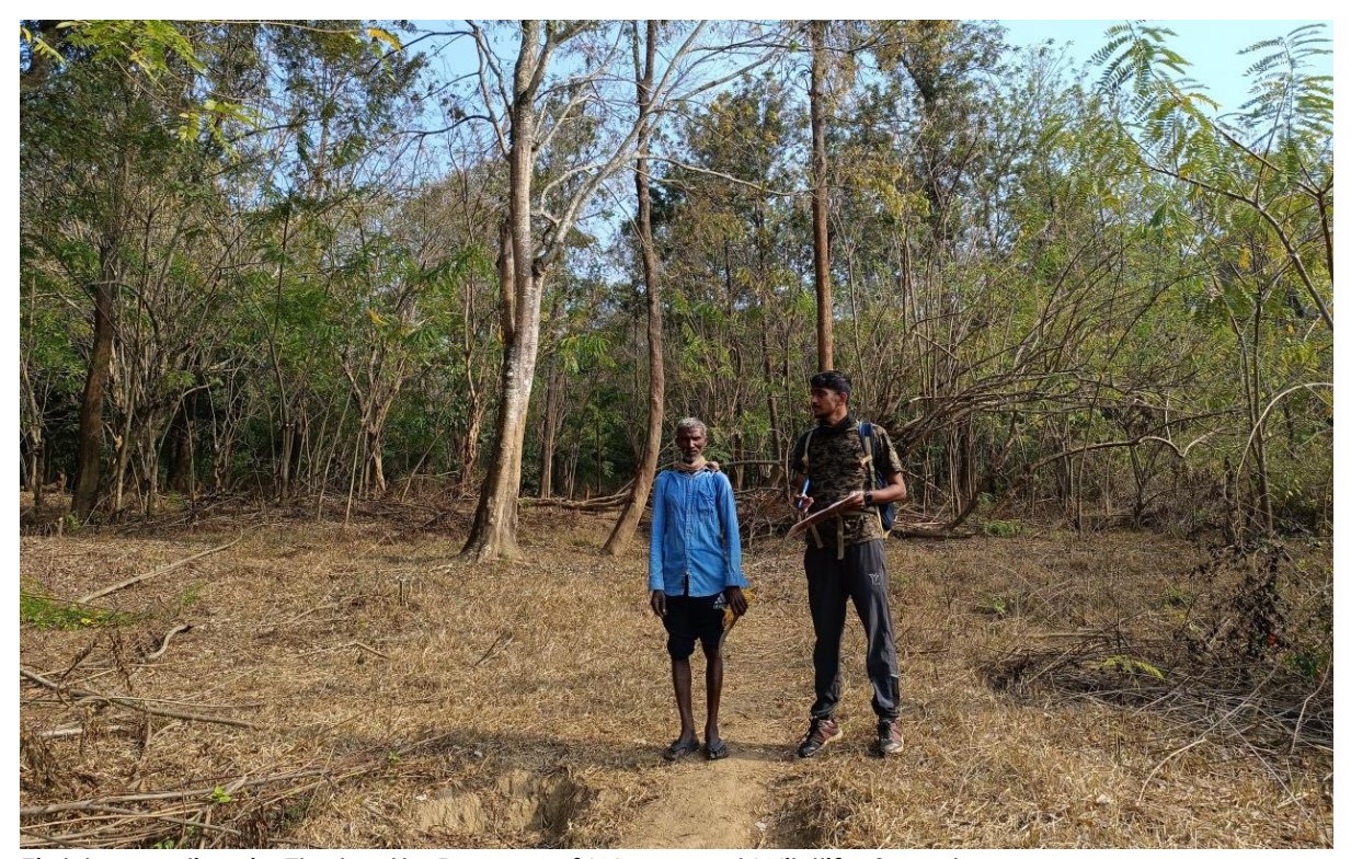
Field sampling in Tholpetty Range of Wayanad Wildlife Sanctuary.

Significant progress has been made in the collection of vegetation data from 230 plots, each with a 10 m radius. These plots were selected to encompass both high and low invasion conditions of Senna spectabilis . Additionally, uninvaded conditions were included to serve as a reference site for thorough comparative analysis. The vegetation sampling initiative is expected to be completed by March 2024. In parallel, a comprehensive dung count survey has been successfully conducted, targeting different density classes of Senna . This survey spanned both pre- and postmonsoon periods, contributing valuable insights. Looking ahead, the survey for the summer season is scheduled to be completed in March 2024.