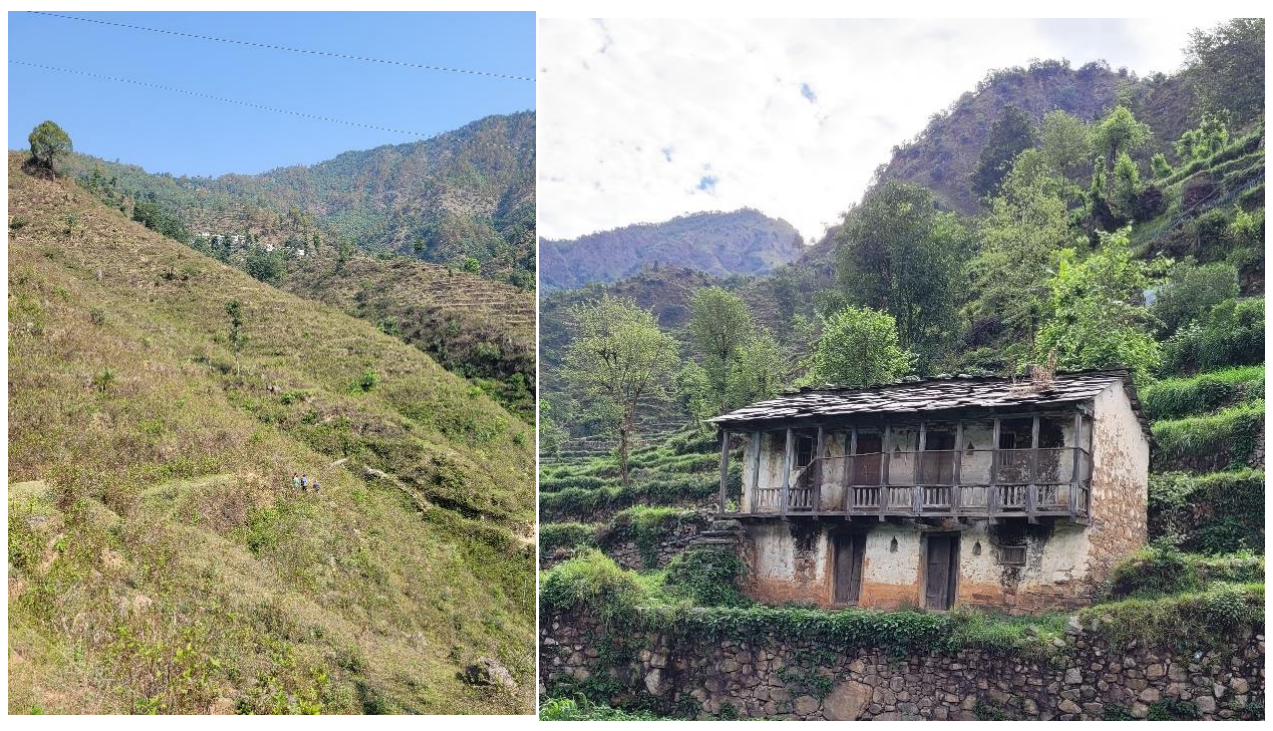
Figure 3 Abandoned flanks of agricultural land, and empty houses are a common site in most villages