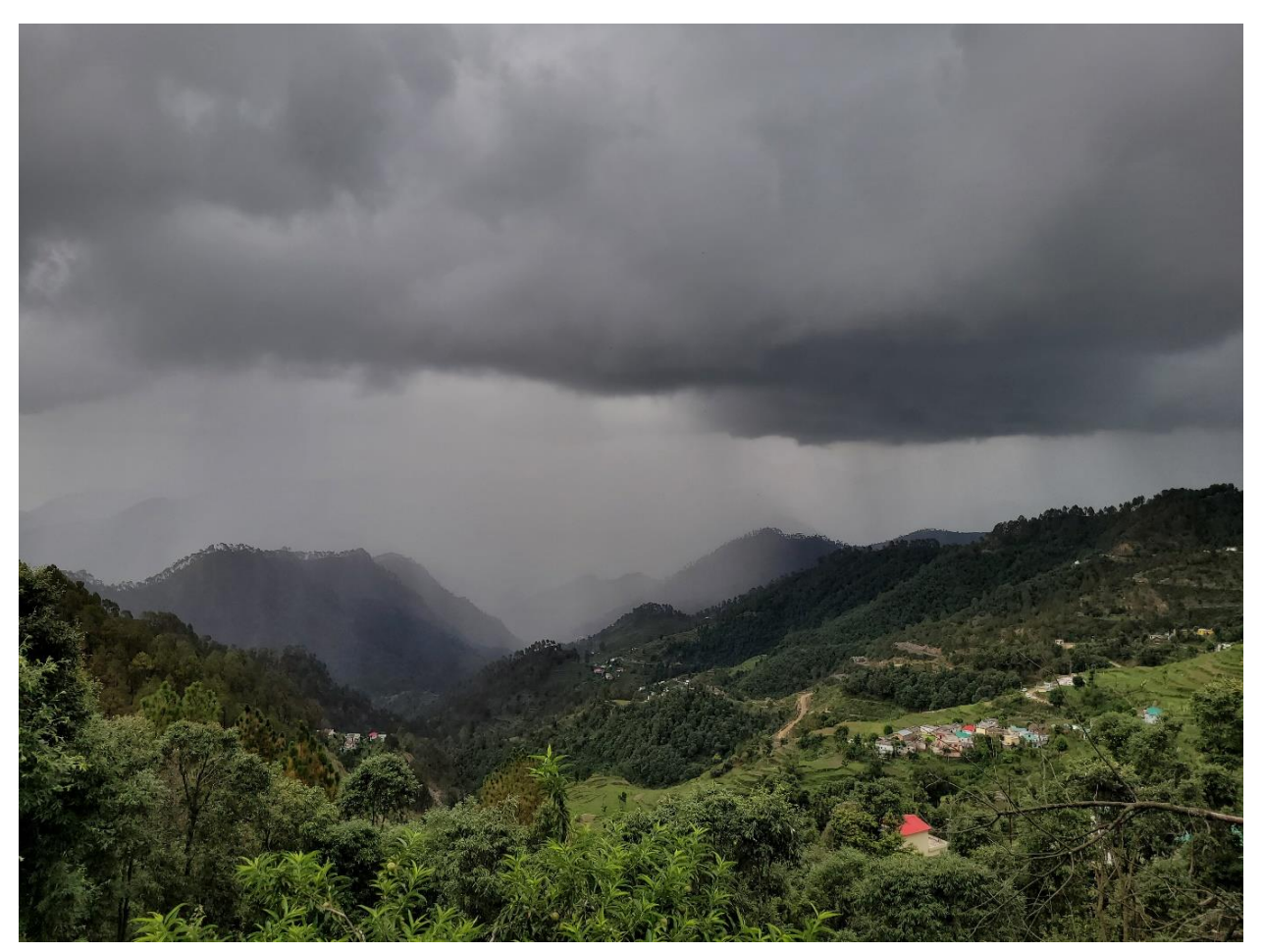
Figure 5 It is quite common to witness a sudden change in weather in the Himalaya. I took this photograph on a day which was fairly sunny to start with, but turned into a picture of grey clouds soon after.