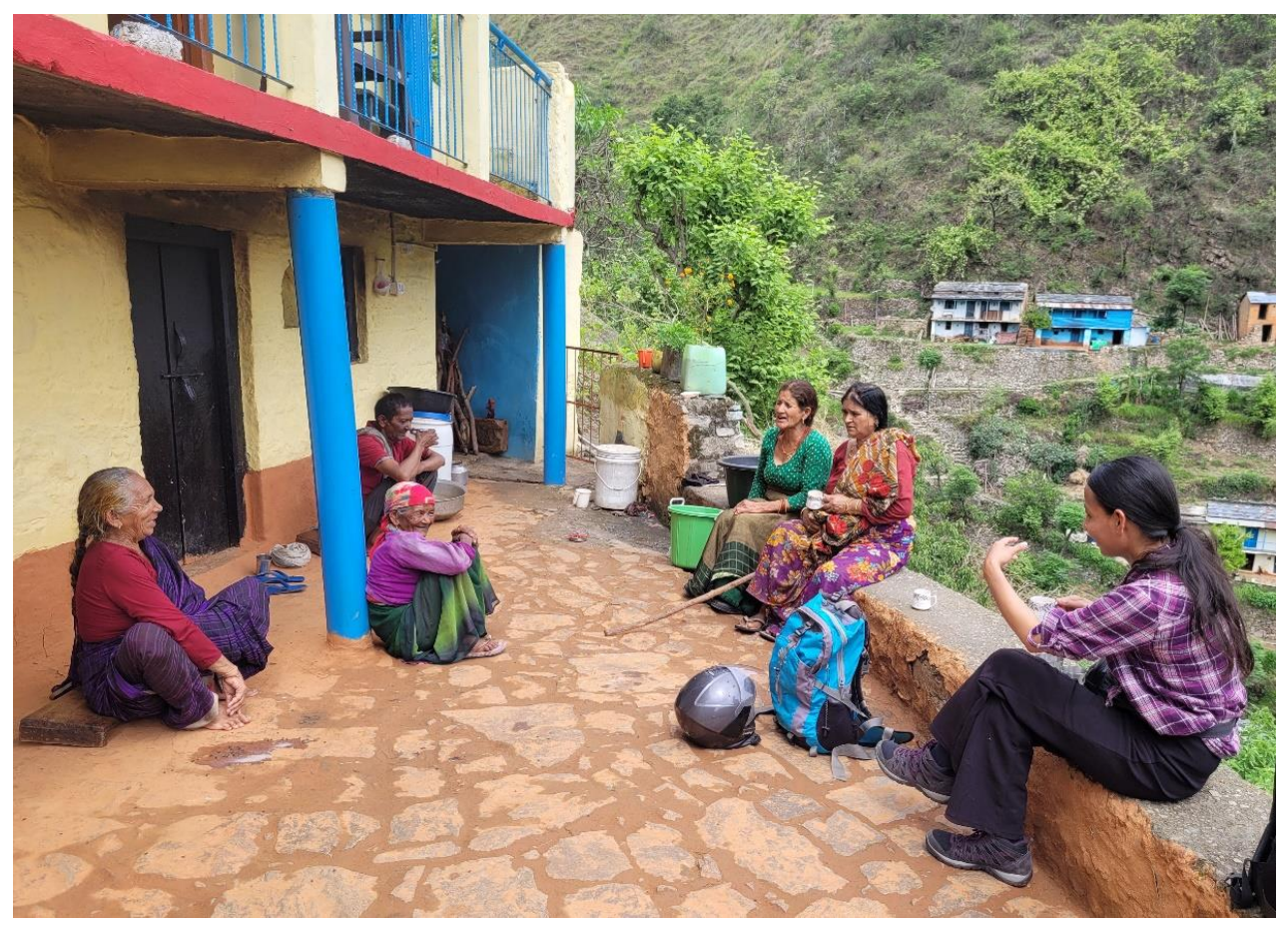
Figure 4 An interview with the women farmers of a village in Pauri Garhwal