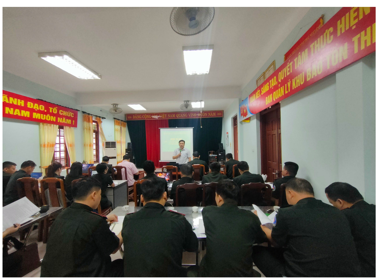
Figure. 1. Training workshop on QGIS software and handy GPS in the office and in the field