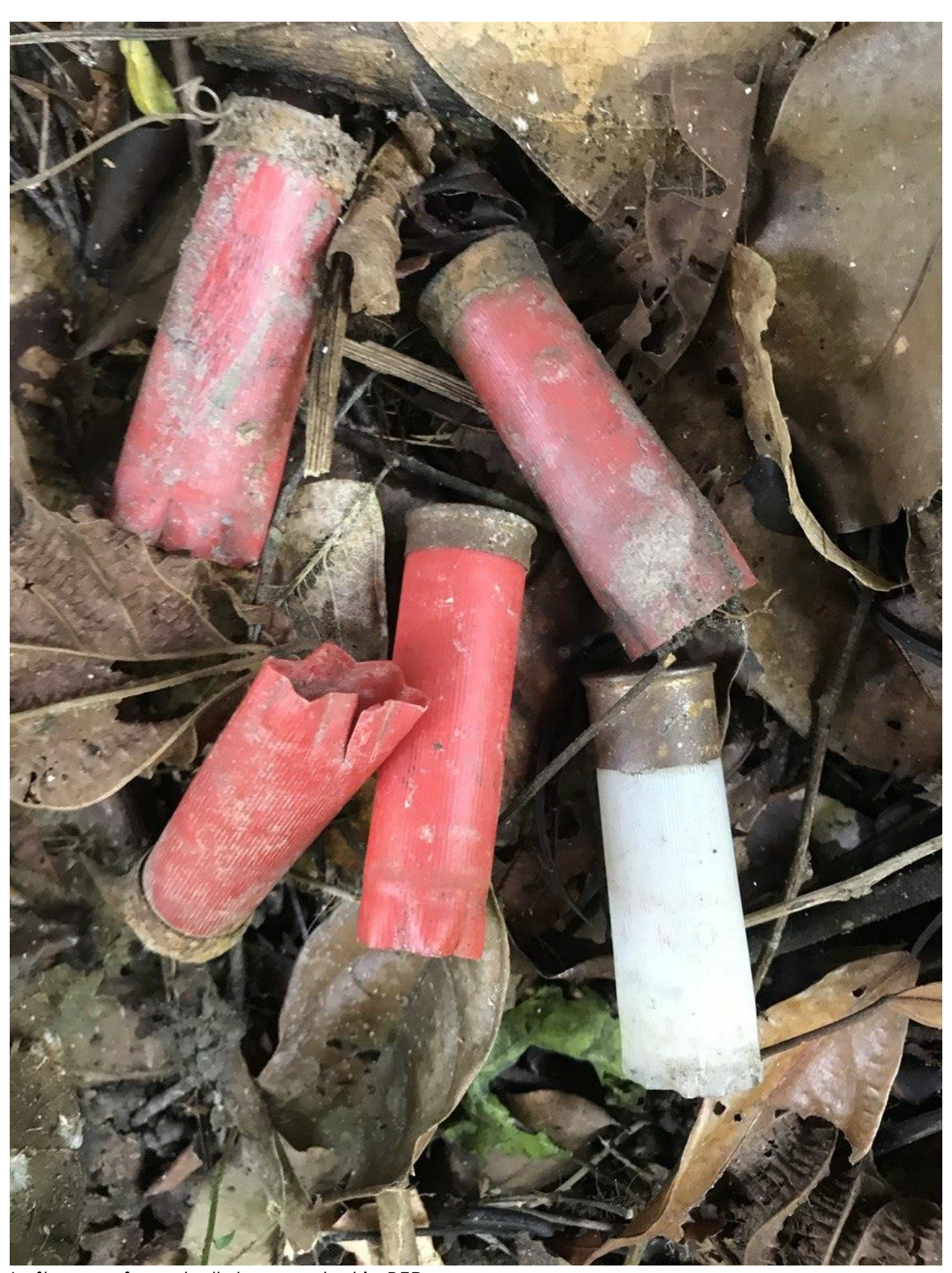
Left over of gun bullets recorded in BFR.