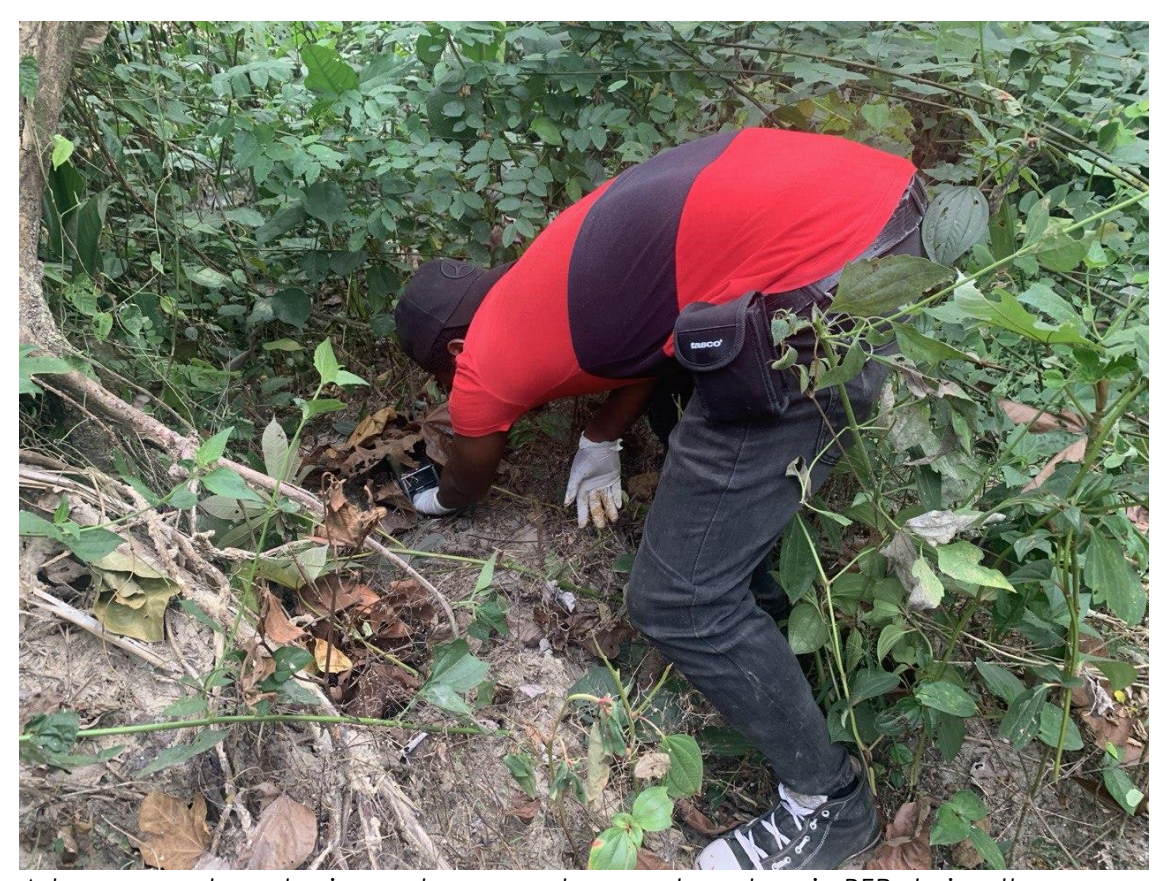
A team member placing a shearman trap under a tree in BFR during the survey.