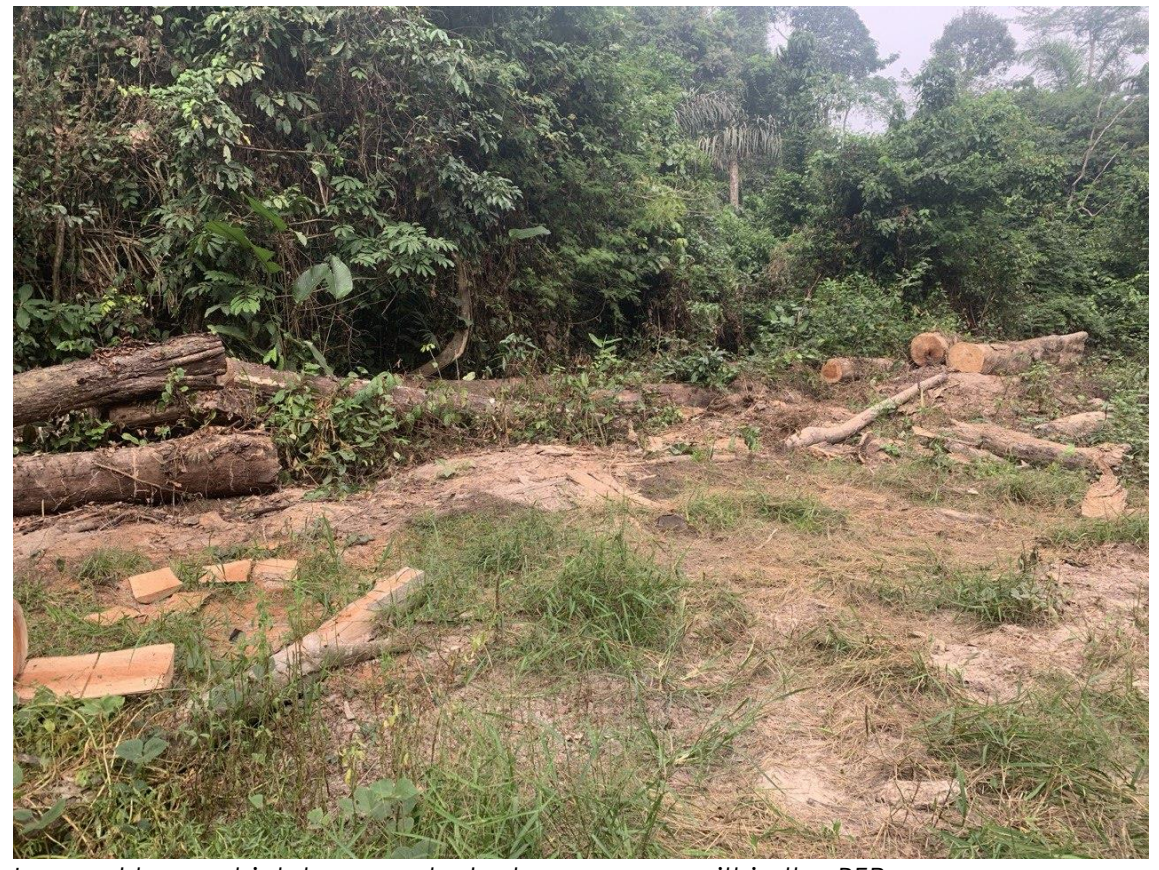
Logged trees which has created a huge space within the BFR.