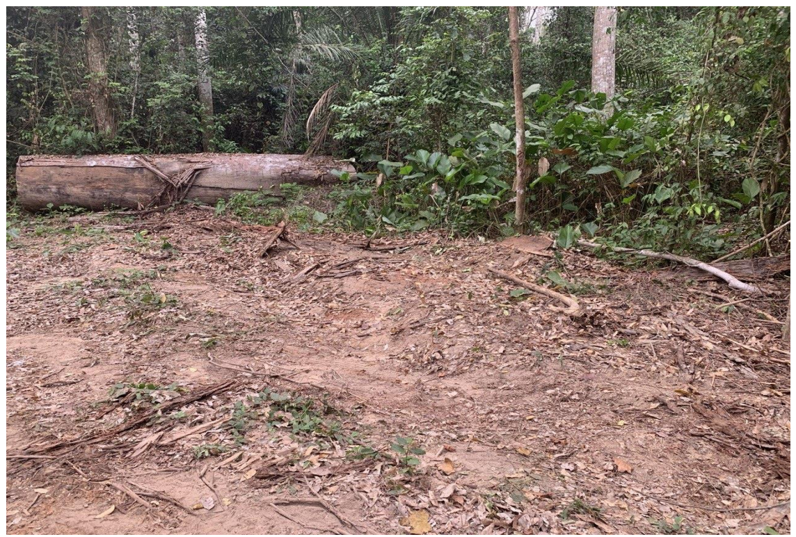
Illegally logged tree which has created an open space in BFR.