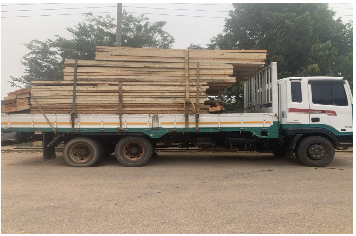
Heavy truck carrying sawn logs of trees in Assin Fosu.