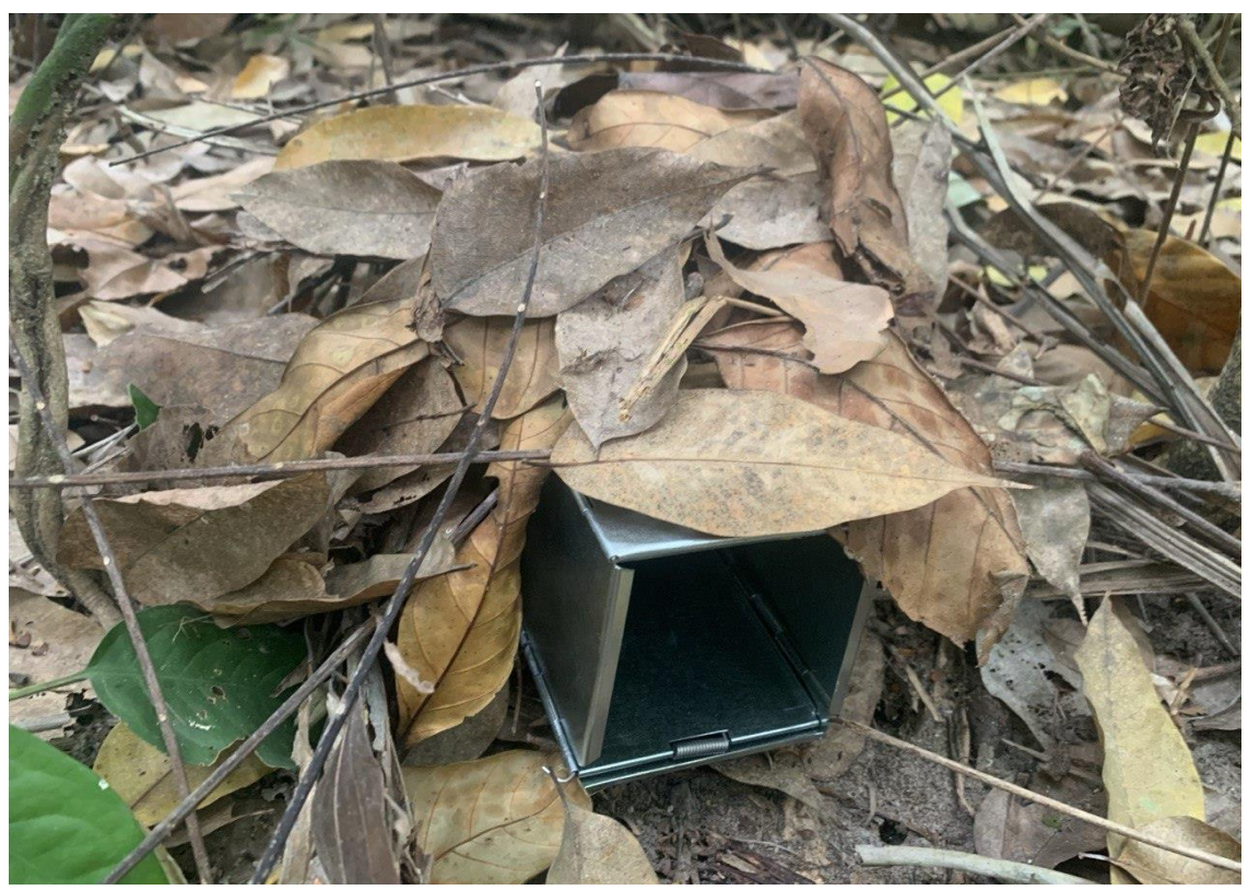
A trap placed in a degraded area of BFR.