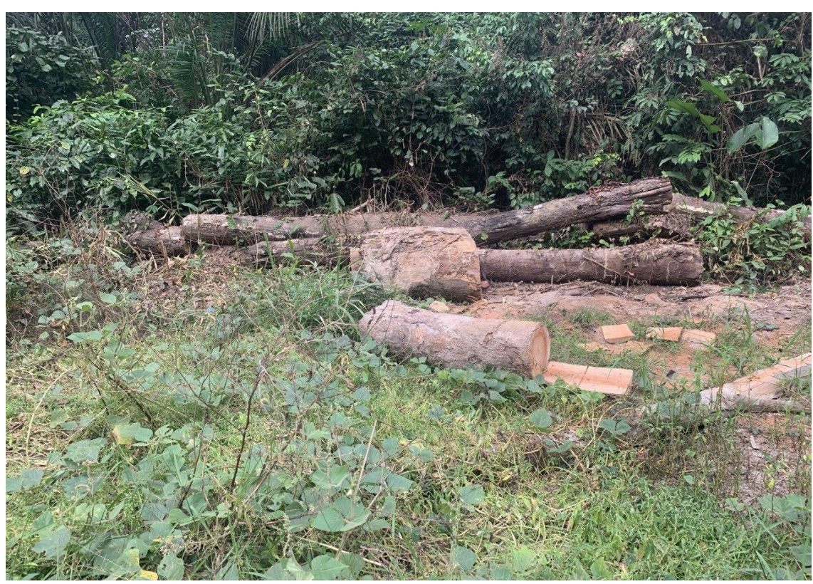
Felled trees chopped into logs in BFR.