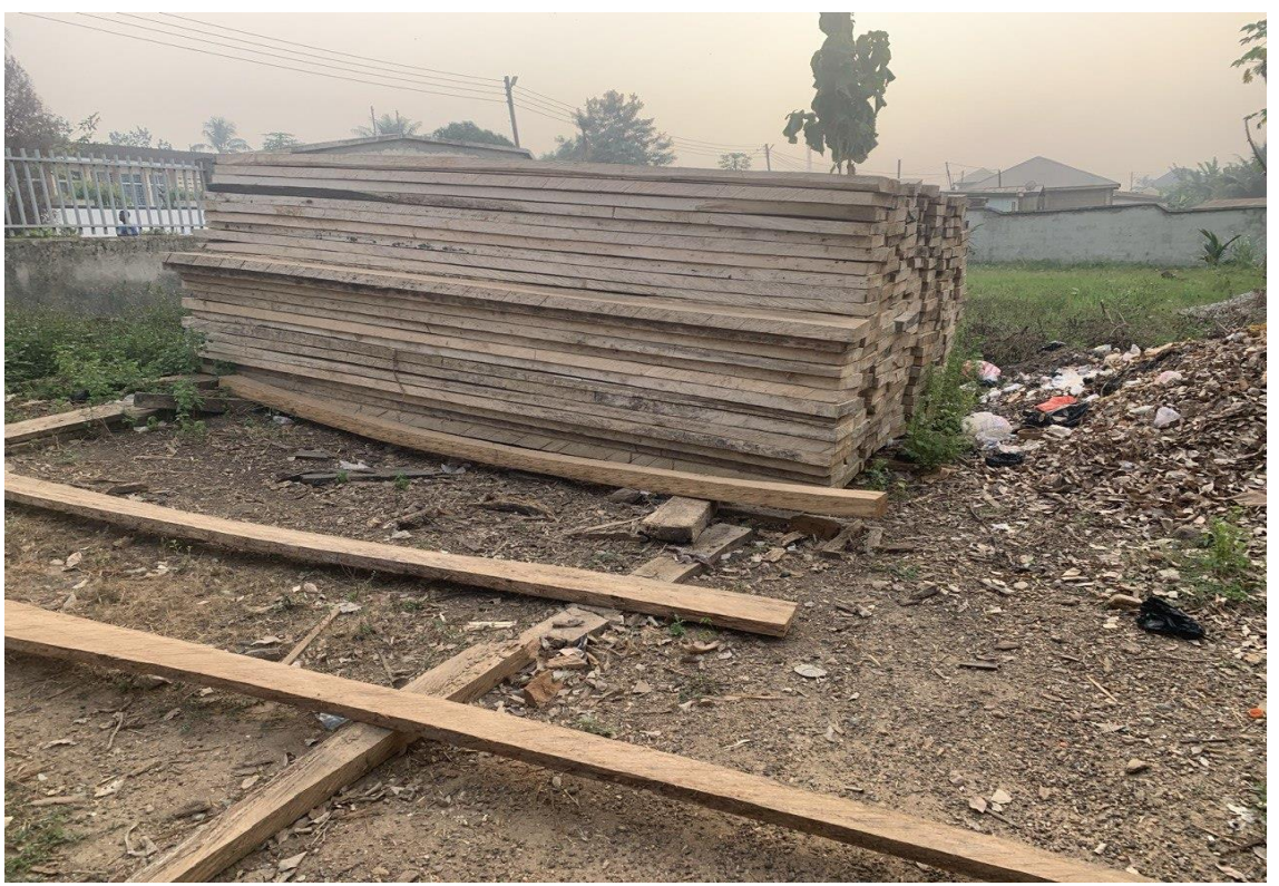
Confiscated sawn logs from the BFR by the Forest Service Division.