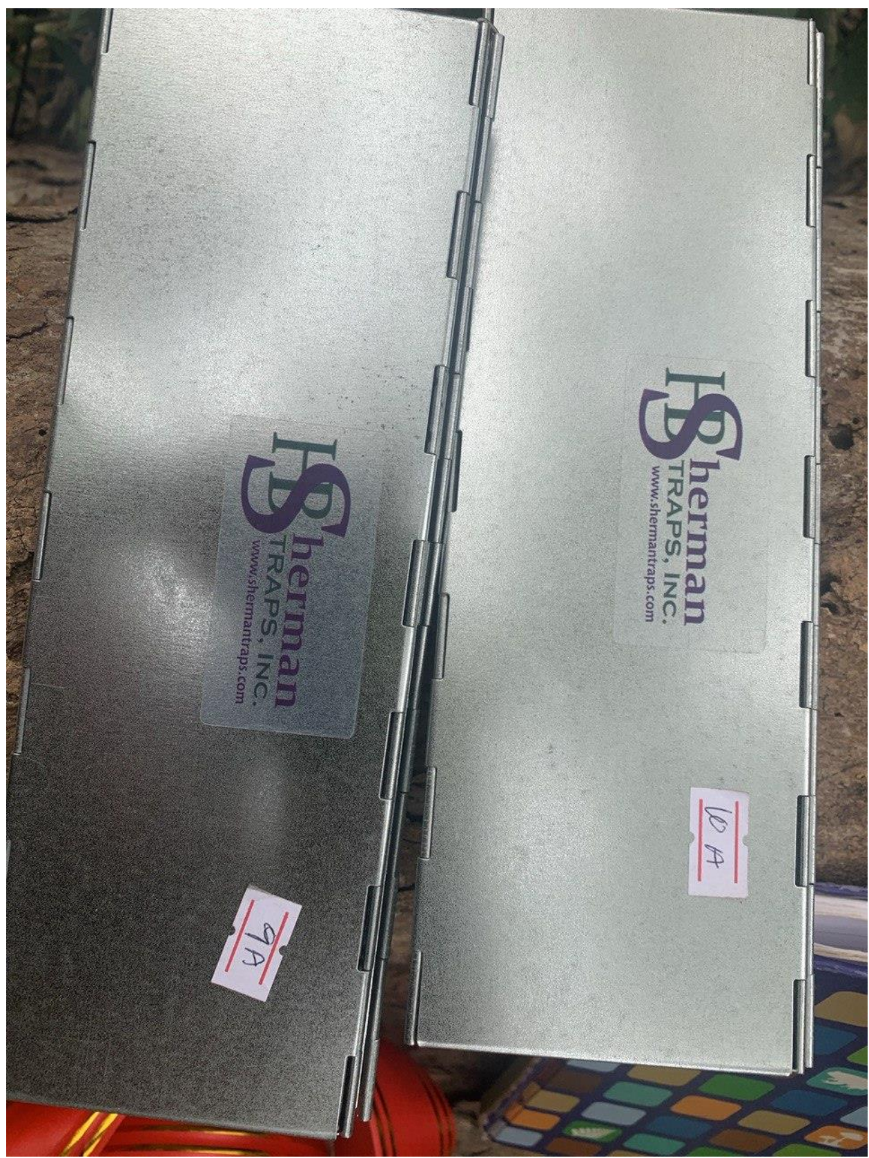
Figure 1: Numbered traps used during the survey in BFR.