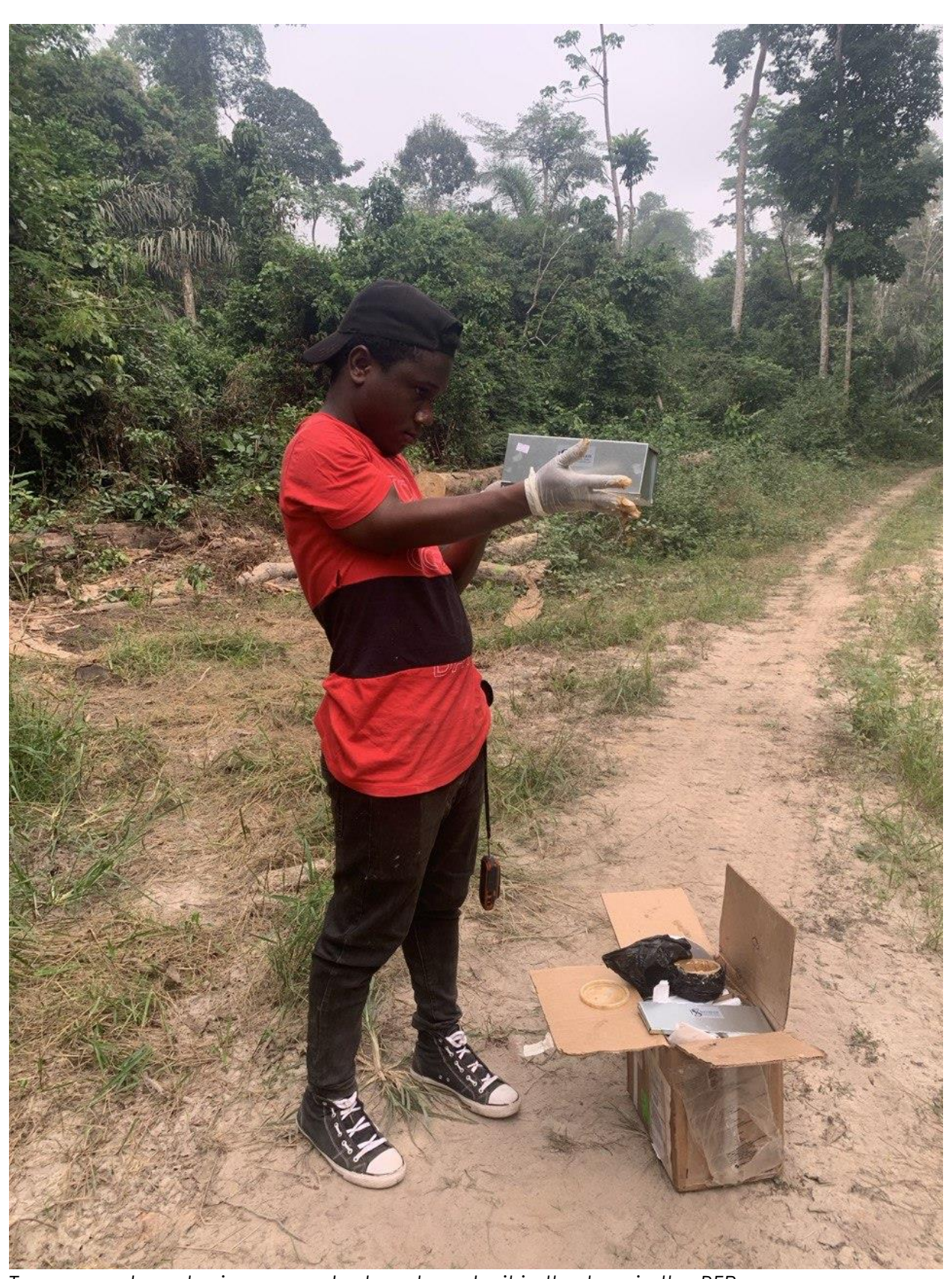
Team member placing groundnut paste as bait in the trap in the BFR.