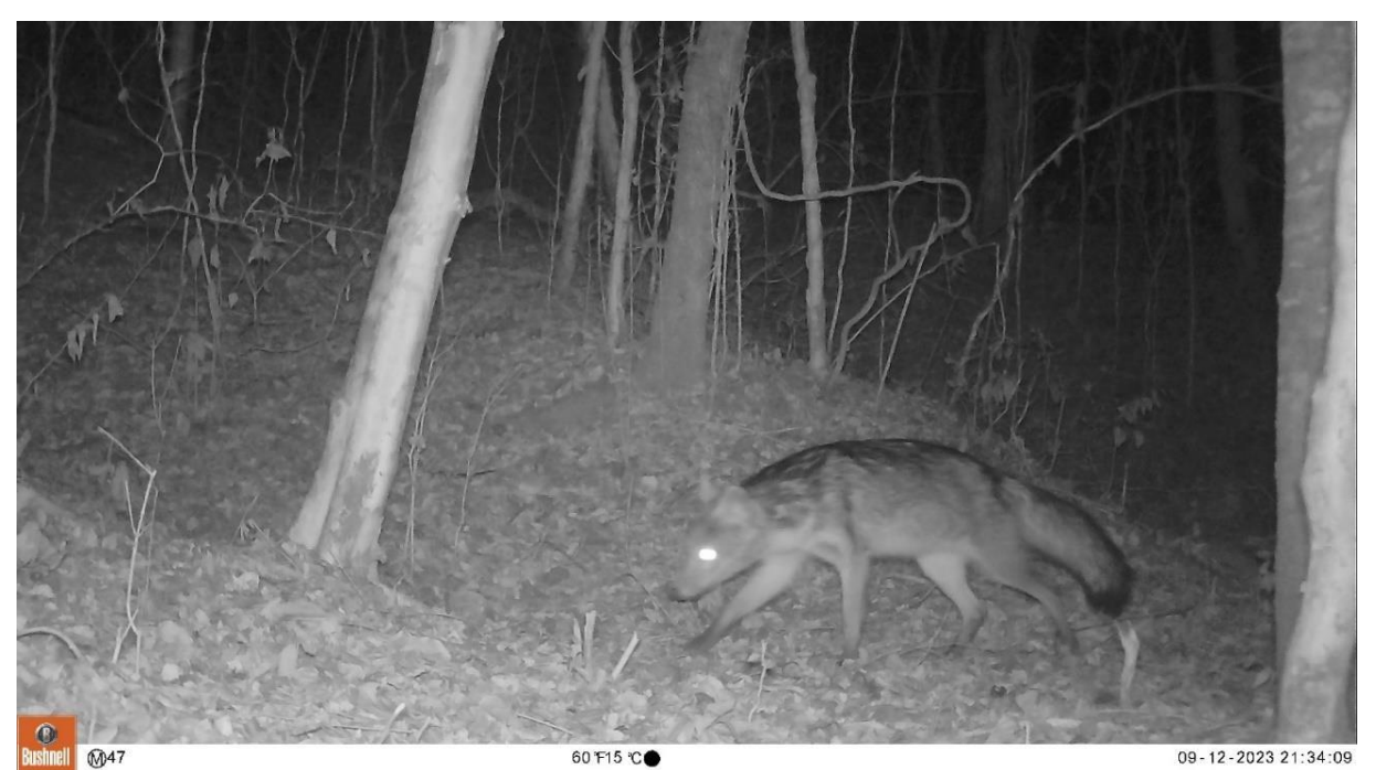
Photo taken by camera trap of a "zorro de monte" (Cerdocyon thous).

The camera survey effort was 900 camera nights and registered many medium and large mammals, including the critically endangered Yaguareté (Panthera onca) and other threatened species such as Myrmecophaga tridactyla and Tapirus terrestris.