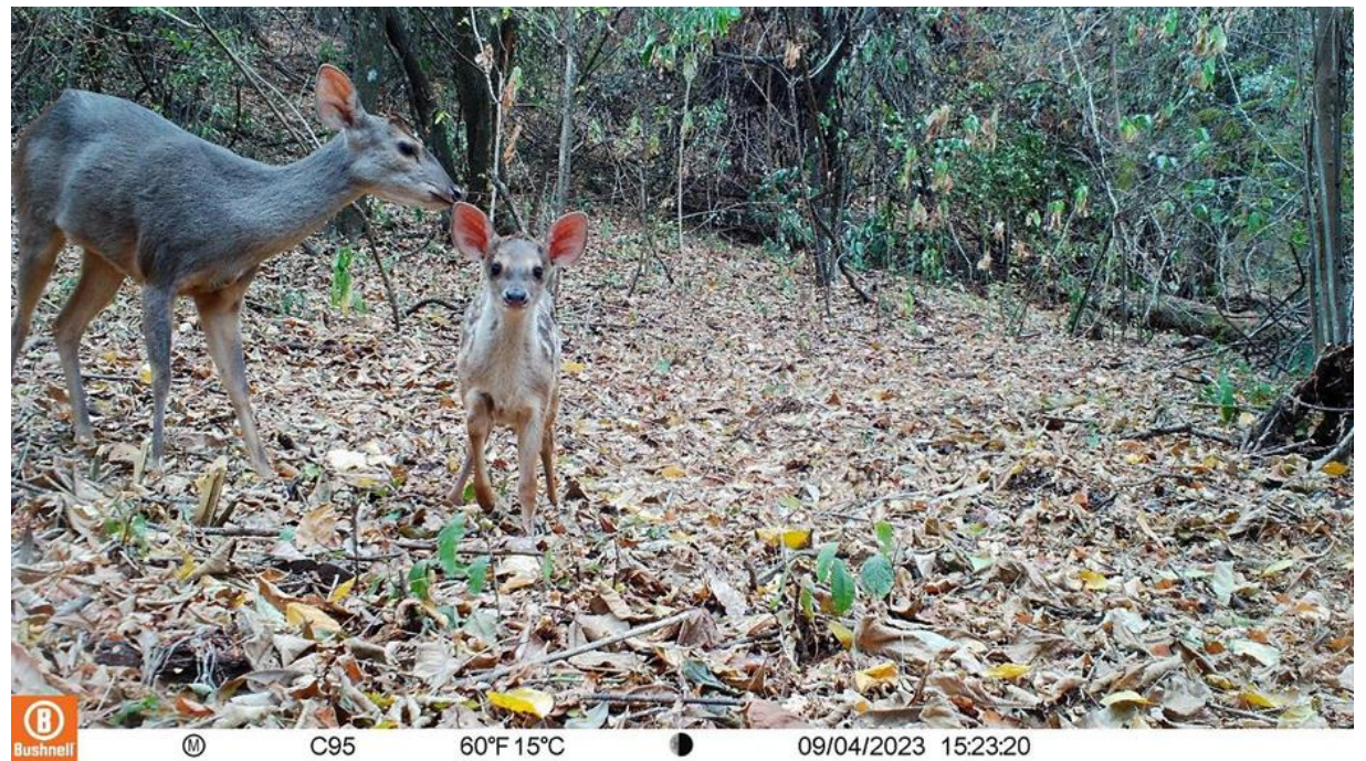
Photo taken by camera trap of a "corzuela parda" (Mazama gouazoubira) and its calf.

Unfortunately, we had an unexpected technical problem with the van in September 2023 and we were not able to carry out a camera survey that was going to cover a major area in CLT with approximately 30 camera sites. This camera survey was rescheduled for the first month of the dry season, in May 2024.