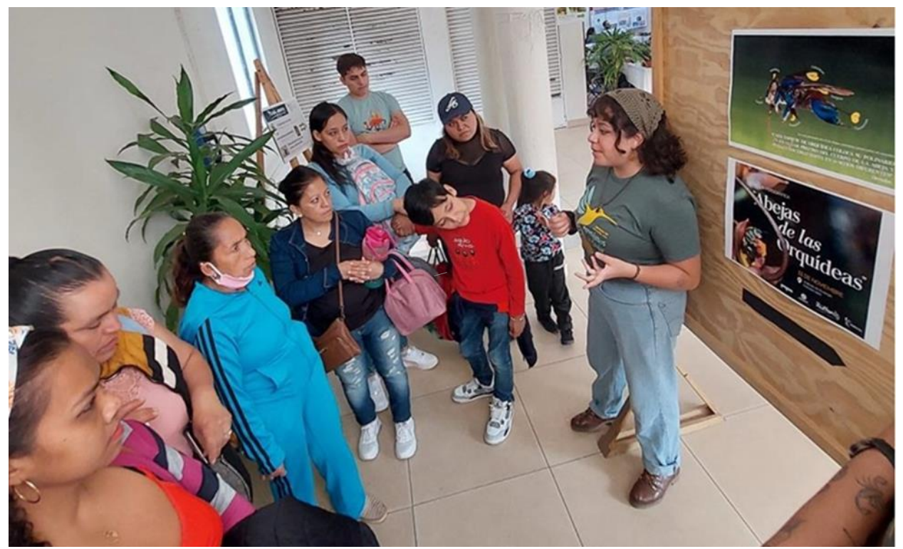
Children learning about orchid bees, orchids and their interactions.