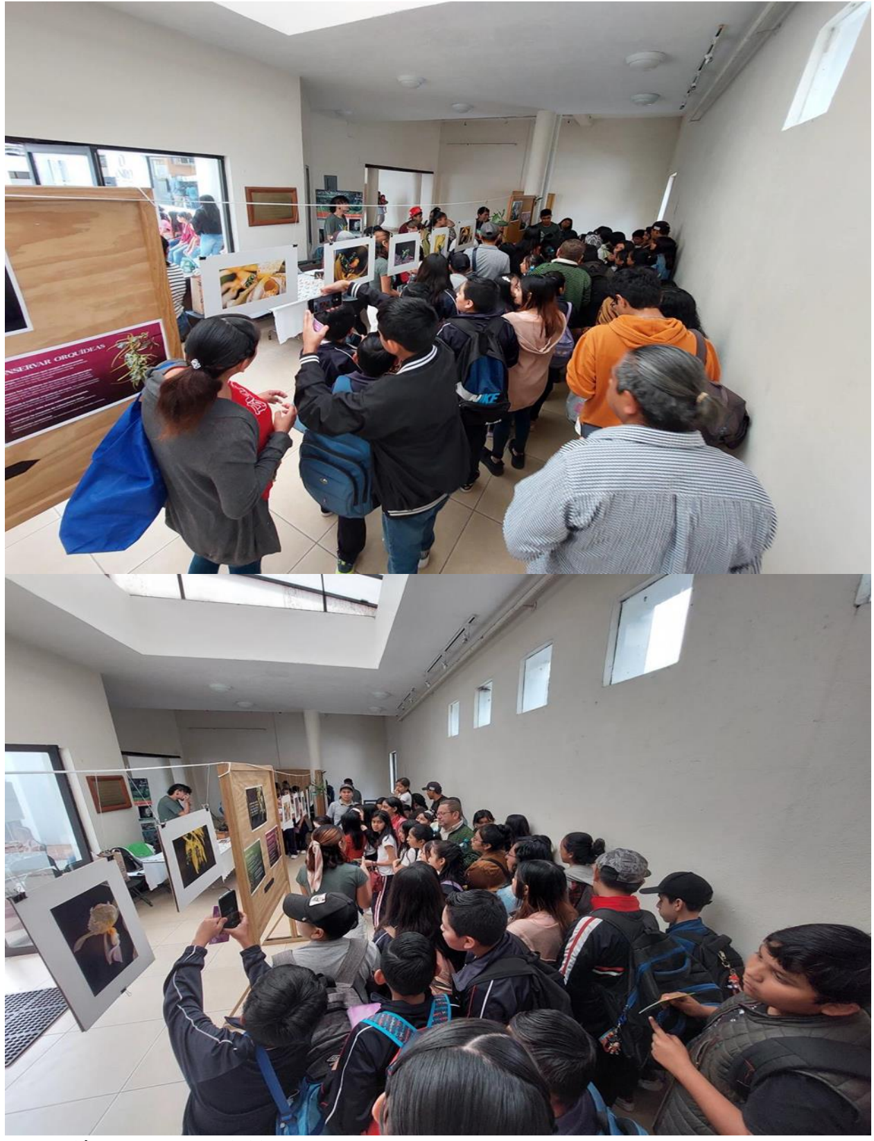
Ilustración 4. Photo exhibition.