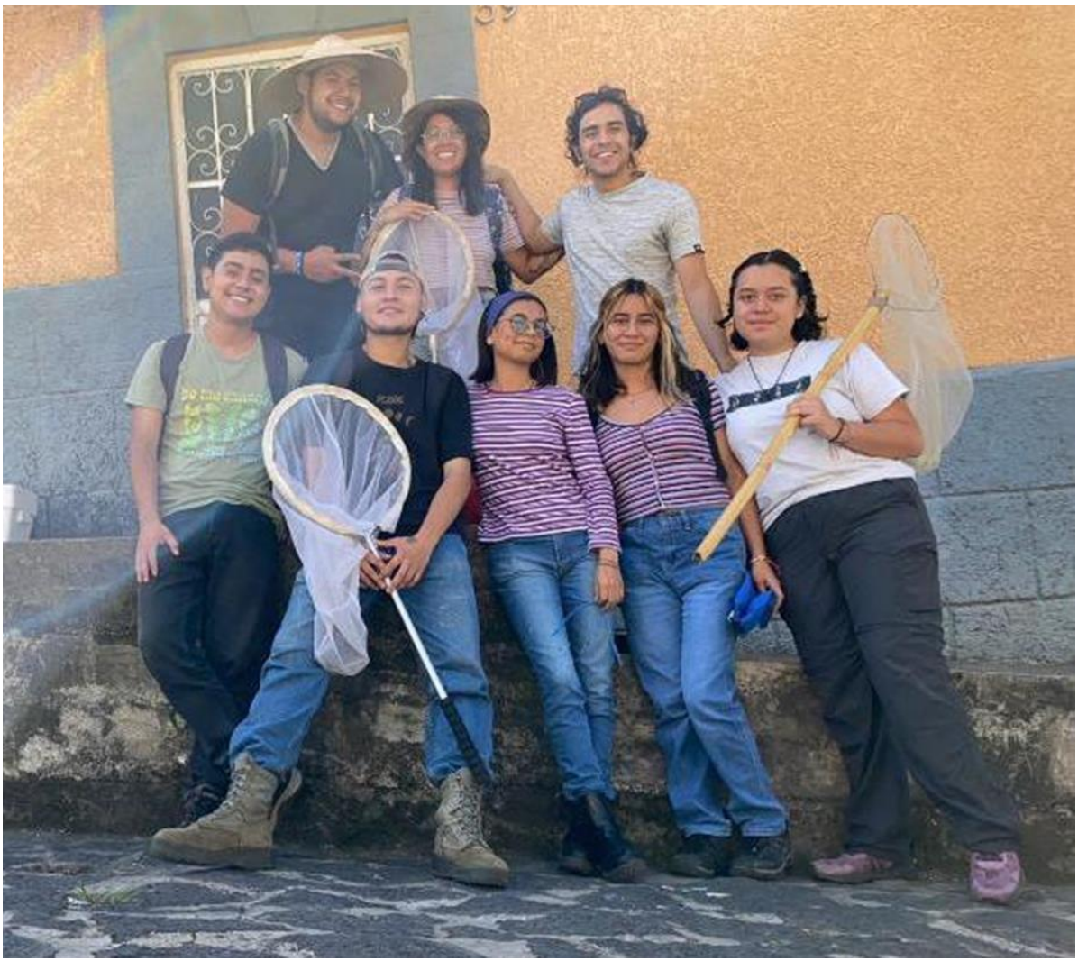
llustración 3. Our team