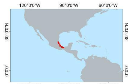
120°0'0"W 90°0'0"W 60°0'0"W Ilustración 1. Map of the sampling zones.