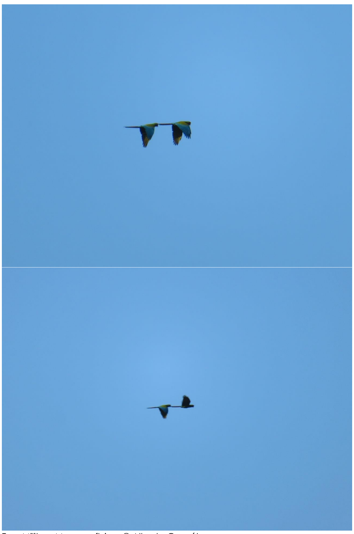
Two Military Macaws flying.