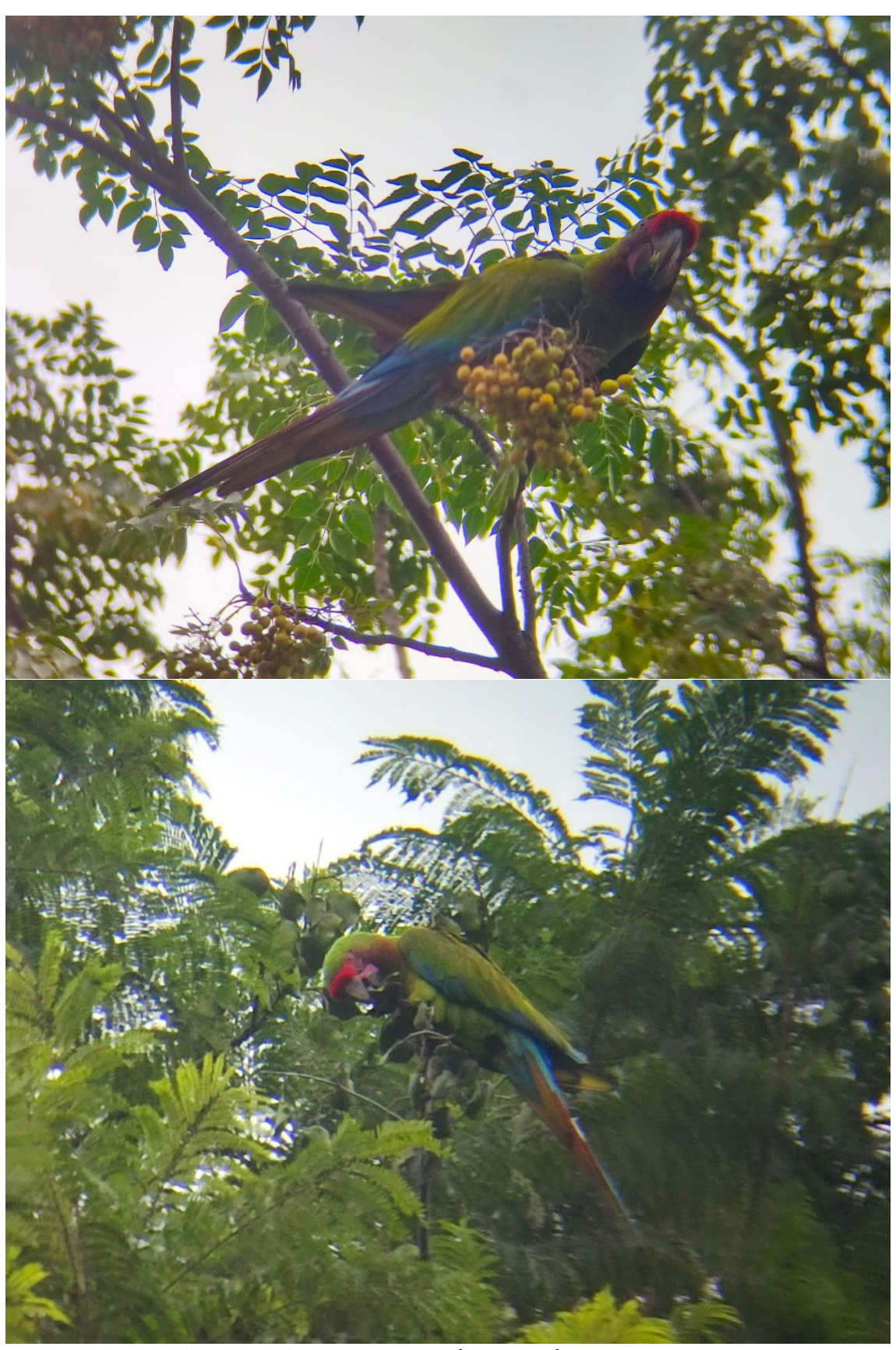
Military Macaw feeding.