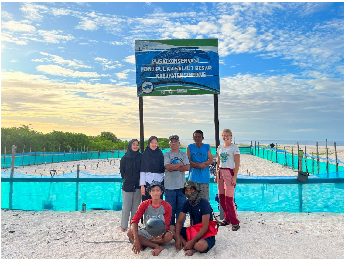
Research team with rangers from Salaut Besar Island in Simeulue.