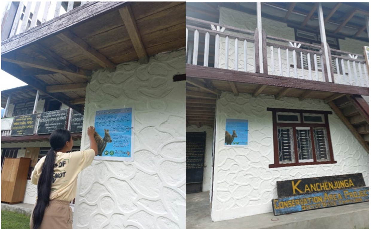
Dissemination of information about musk deer and its conservation.