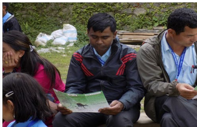
Students reading the educational material.

In Lelep, a joint rally on musk deer conservation and environment protection was organized on 5 June 2023, followed by school teaching programme on 6 June 2023.