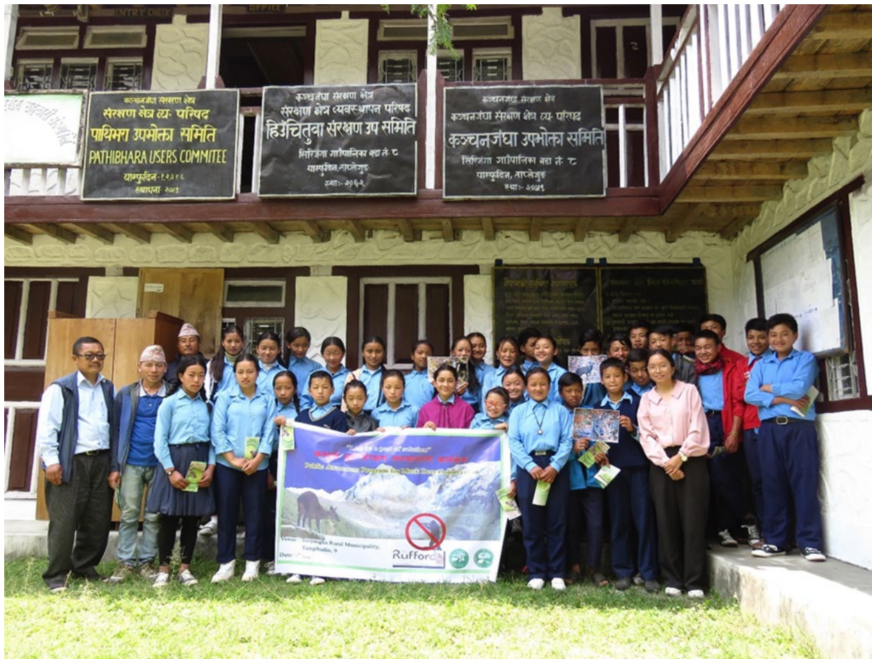
Students and other participants take photos after the teaching session.

We have conducted awareness programmes in schools and communities. Students and community people have greatly benefited. Students were curious about the musk deer and actively participated during the teaching sessions. During the different teaching sessions, we found that not all students were ignorant about the musk deer. There were students who already knew about the musk deer usually from their parents, teachers and the sector office of Kanchanjanga Conservation Area Management Council (KCAMC). But they have not taken it seriously. The school teaching programmes have given positive insights among the students of KCAP area about the conservation importance of musk deer.