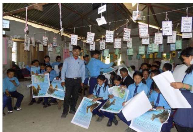
School teaching and educational materials distribution.

Educational materials like brochures and pamphlets were distributed to the students. It consisted of the condensed information of musk deer and its conservation. The