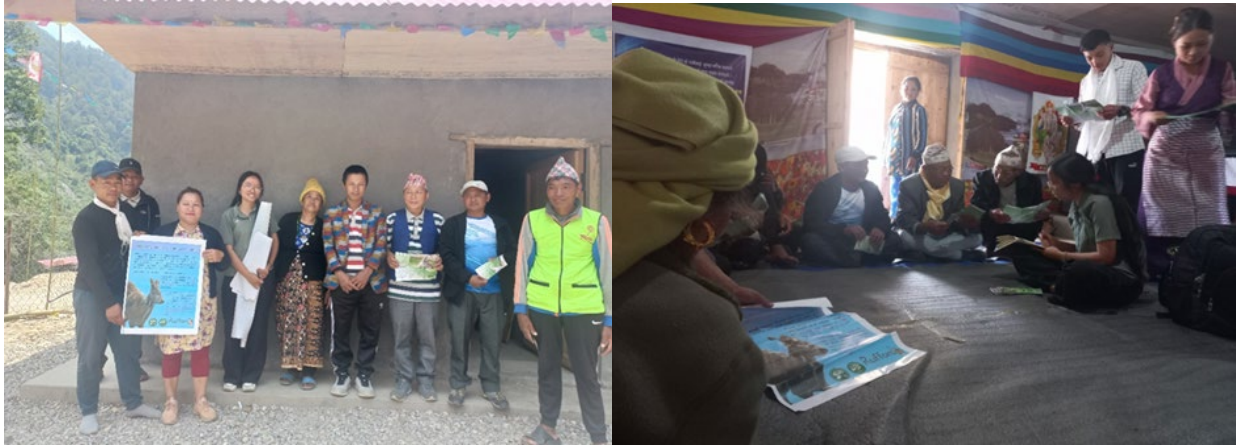
Interaction with community people.

Community teaching and social data collection were done simultaneously. First of all, a questionnaire survey was conducted for the purpose of research. It not only gave the data we were seeking but also the idea about the knowledge and understanding of the musk deer and the necessity to conserve it. After that educational materials were distributed, and teaching was done accordingly. The latter part was more engaging. Community people were very interactive. They have not only received our message but also contributed their knowledge and ideas about the musk deer and its evidence in the study area.