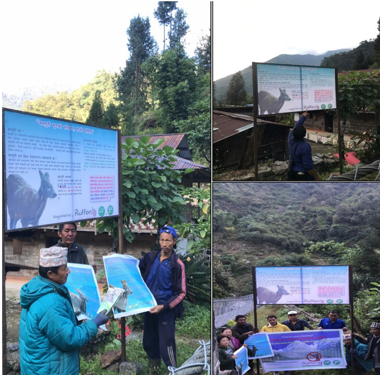
Establishment of the hoarding board.

We have established a hoarding board about the information about the musk deer, its habitat, legal status and way forward for the conservation effort. Hoarding boards are placed at a place where there is high movement of the people. It is visually attractive and placed tall so that it is noticeable to the people.