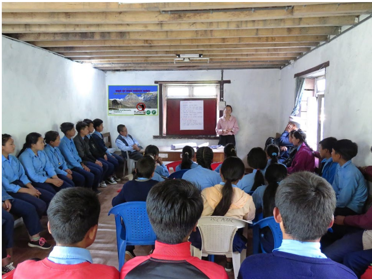
School teaching session.