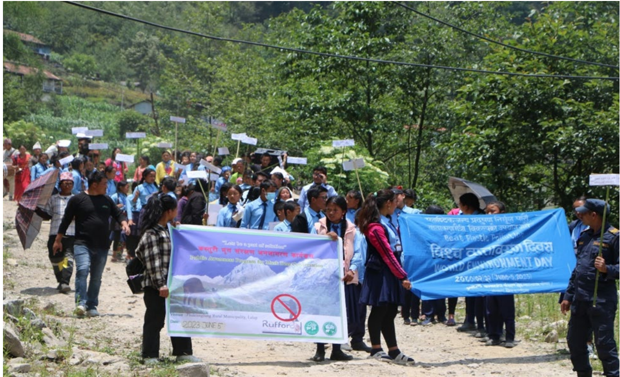
Joint rally on musk deer conservation and environment protection.