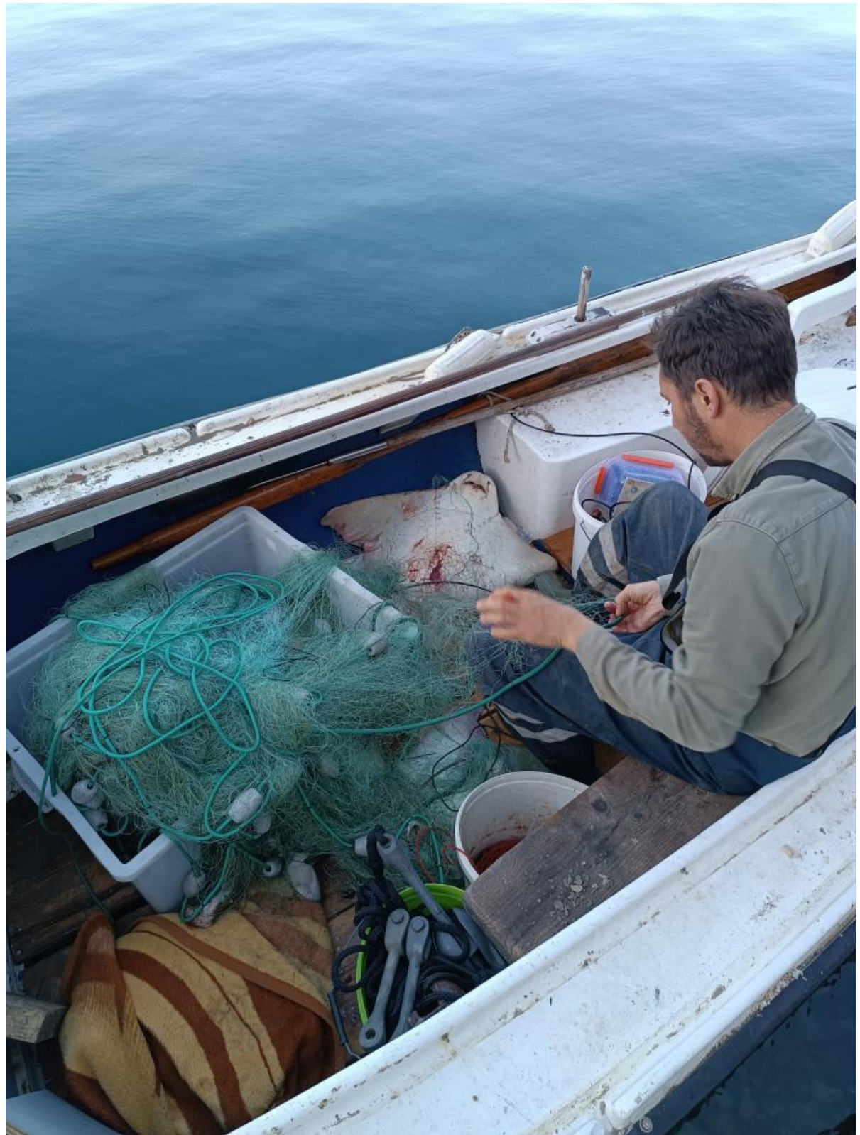
Fig. 8. Field work and collecting the samples.