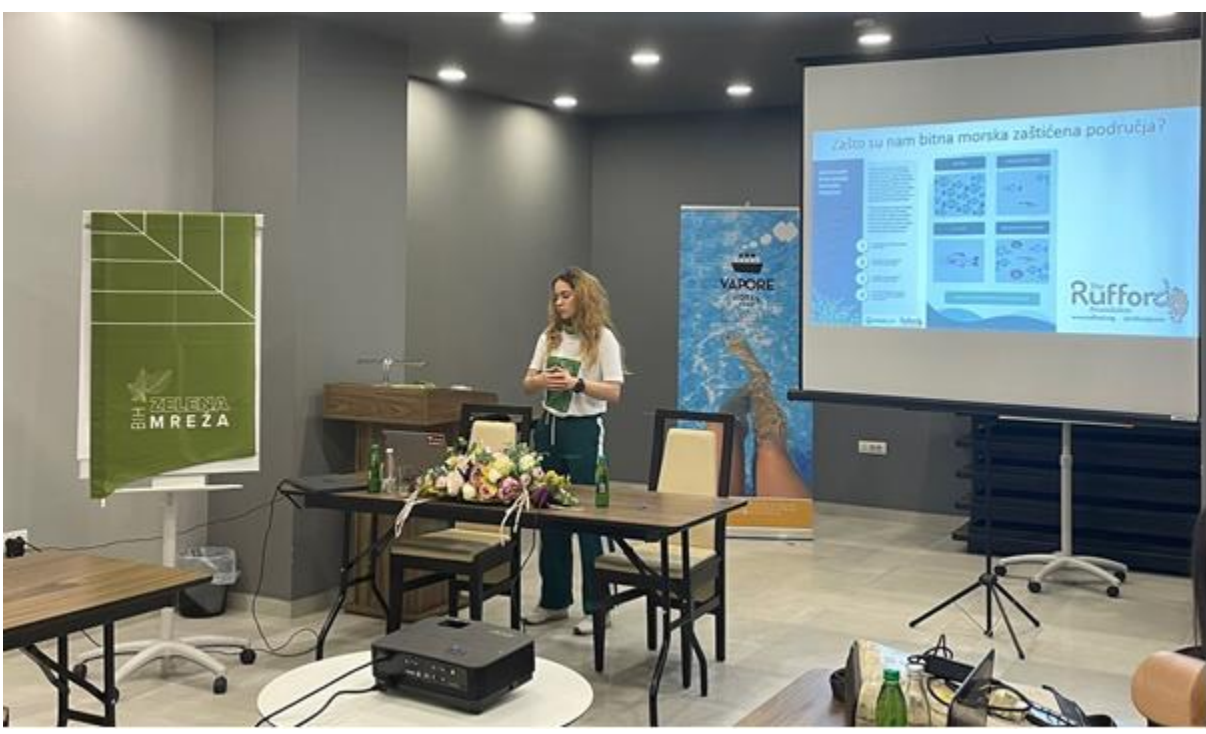
Flg. 4. Presentation held in Neum, with different repsentetatives of local communities.