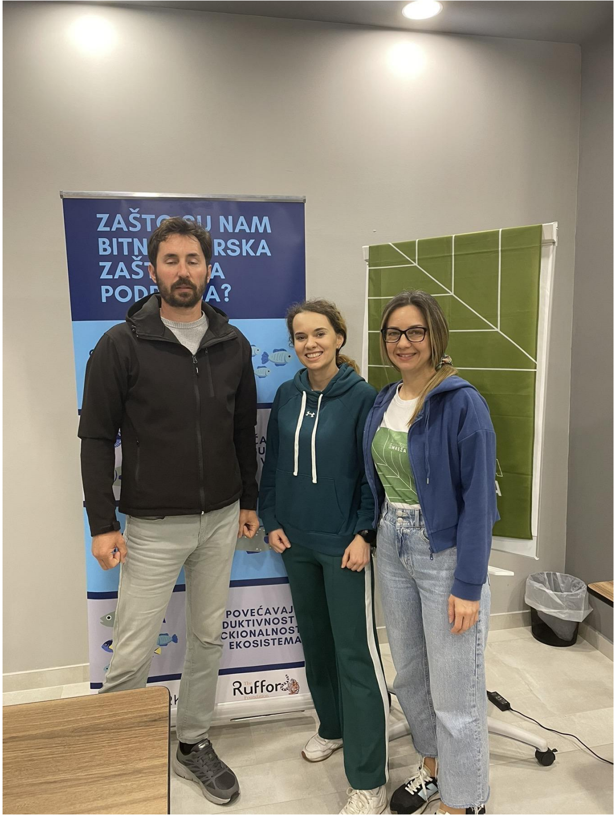
Fig. 6. Meetings with local communities.