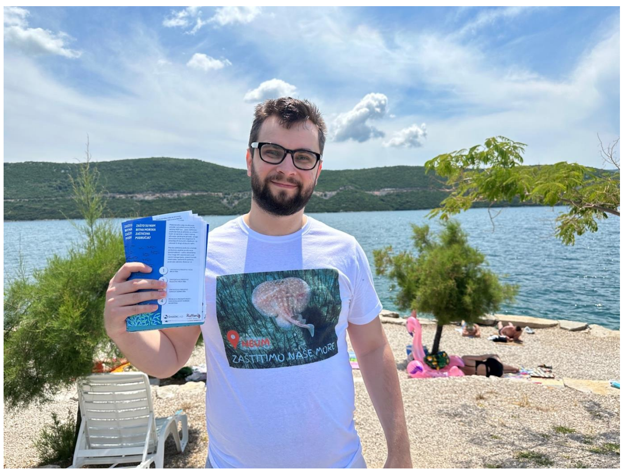
Fig. 5. Promotional material dissemination and sharing.