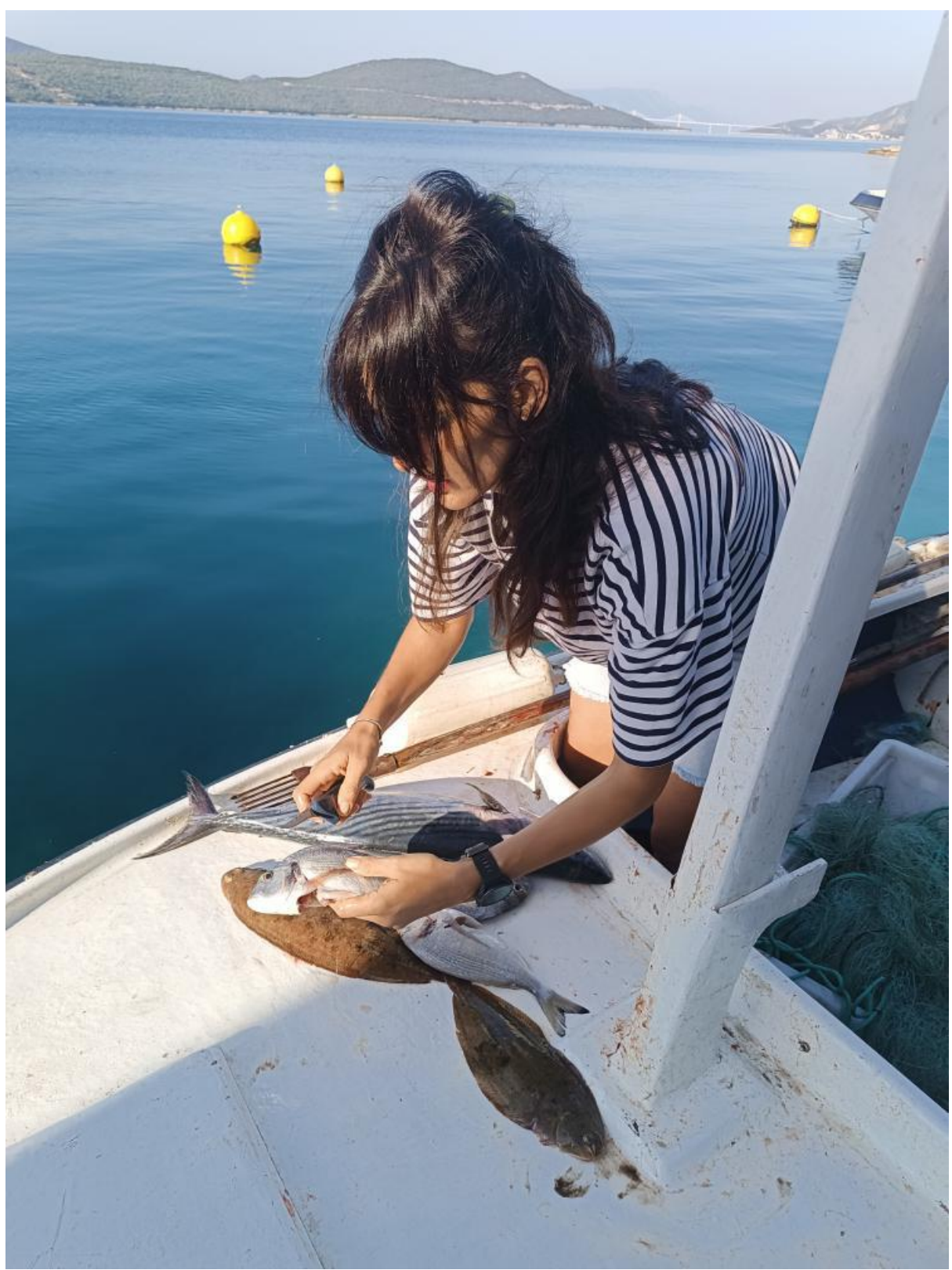
Fig. 8. Field work and collecting the samples.