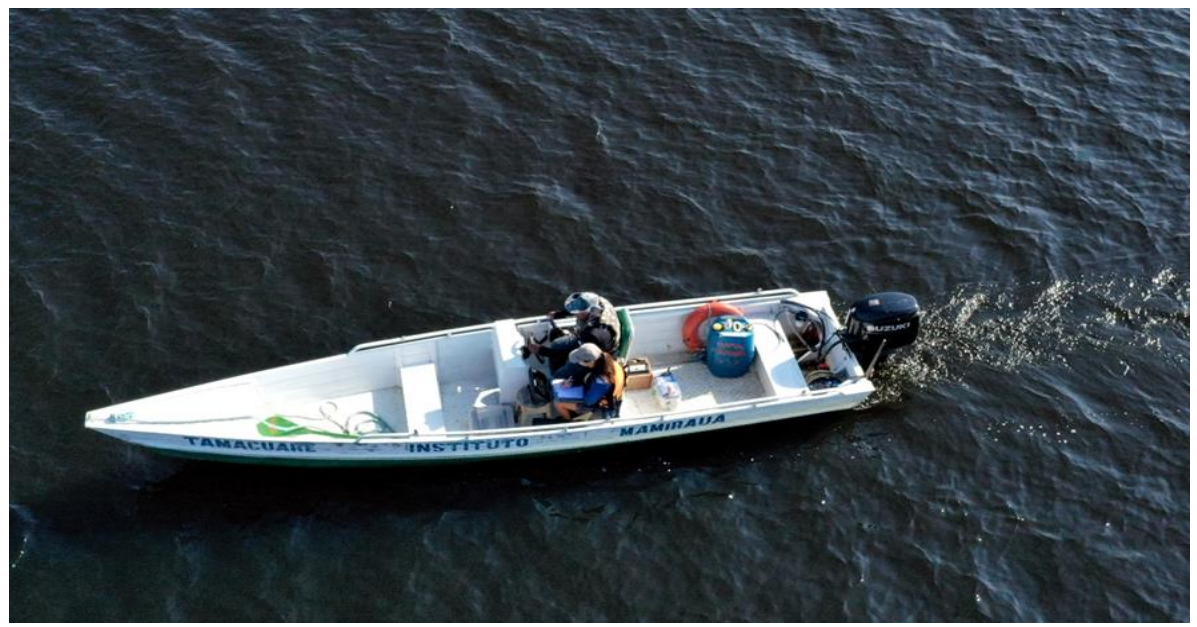
Realizing transects by boat using side-scan sonar at Amanã Lake.

During this process, manatees were also observed in Lake Tefé, where the incident occurred, indicating it as a potential area for the study. Since it was not possible to continue the fieldwork, the plan is to resume it in the year 2024 and complete all the activities that had been previously proposed.