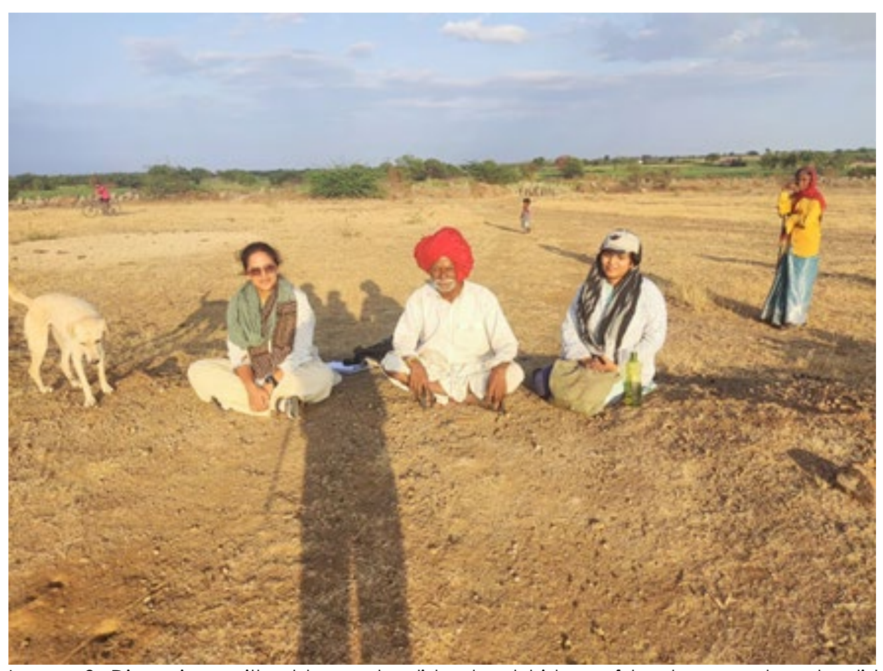
Image 2: Discussions with older pastoralists about history of land use and pastoralist institutions.

Secondly, we were able to conduct 16 in-depth interviews with middle and old age pastoralists where we noted the land use history of this pastoral landscape and how pastoralist institutions have changed over time. We especially collected information on the 'kurann' system of management where collective access to fodder and water was historically present in two village clusters in the study area. These interviews gave us important insights into what could be more realistic conservation interventions in this landscape.