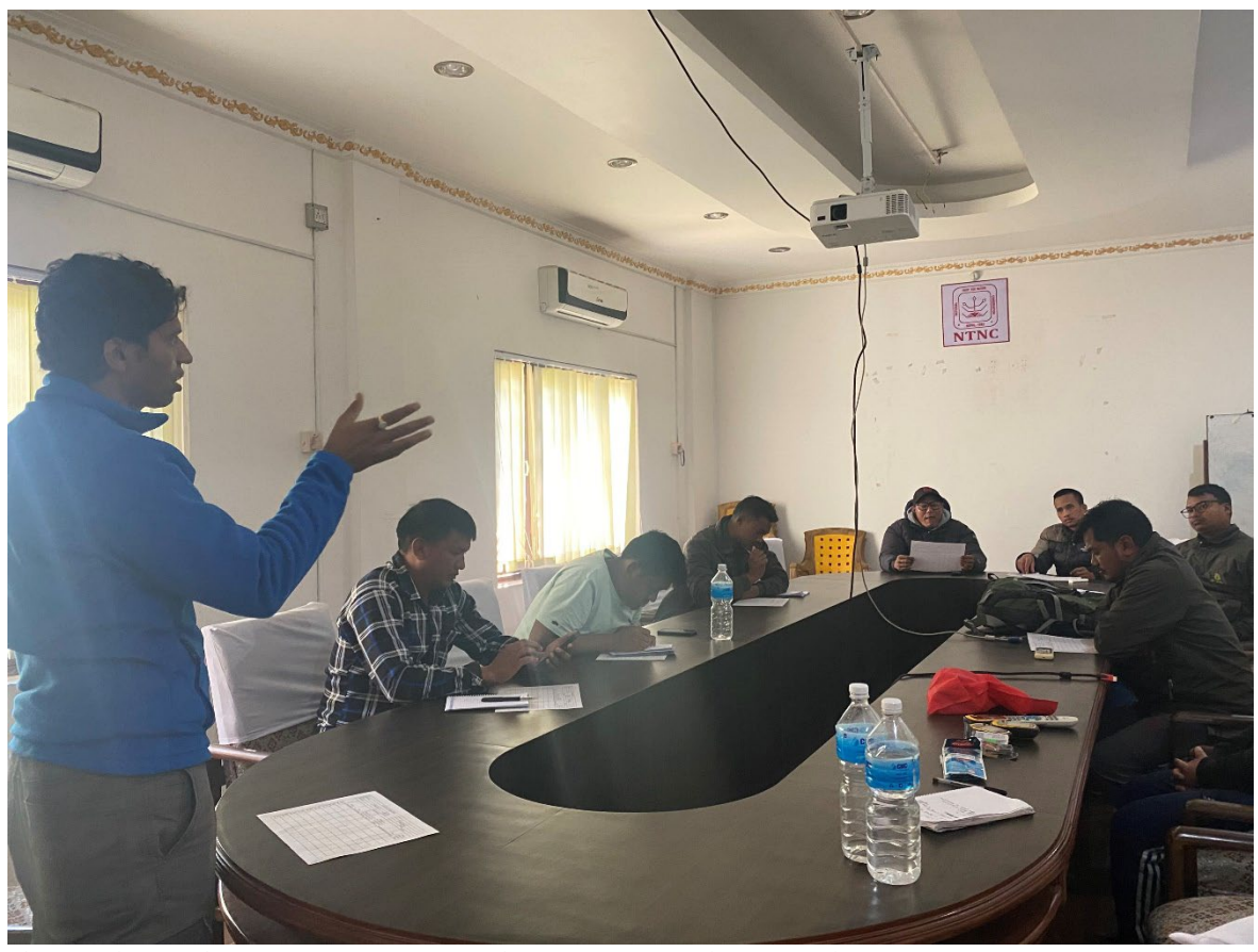
Field orientation to researchers given by technical advisor.