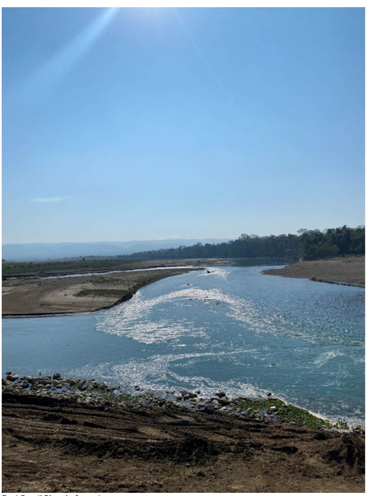
East Rapti River in Sauraha.