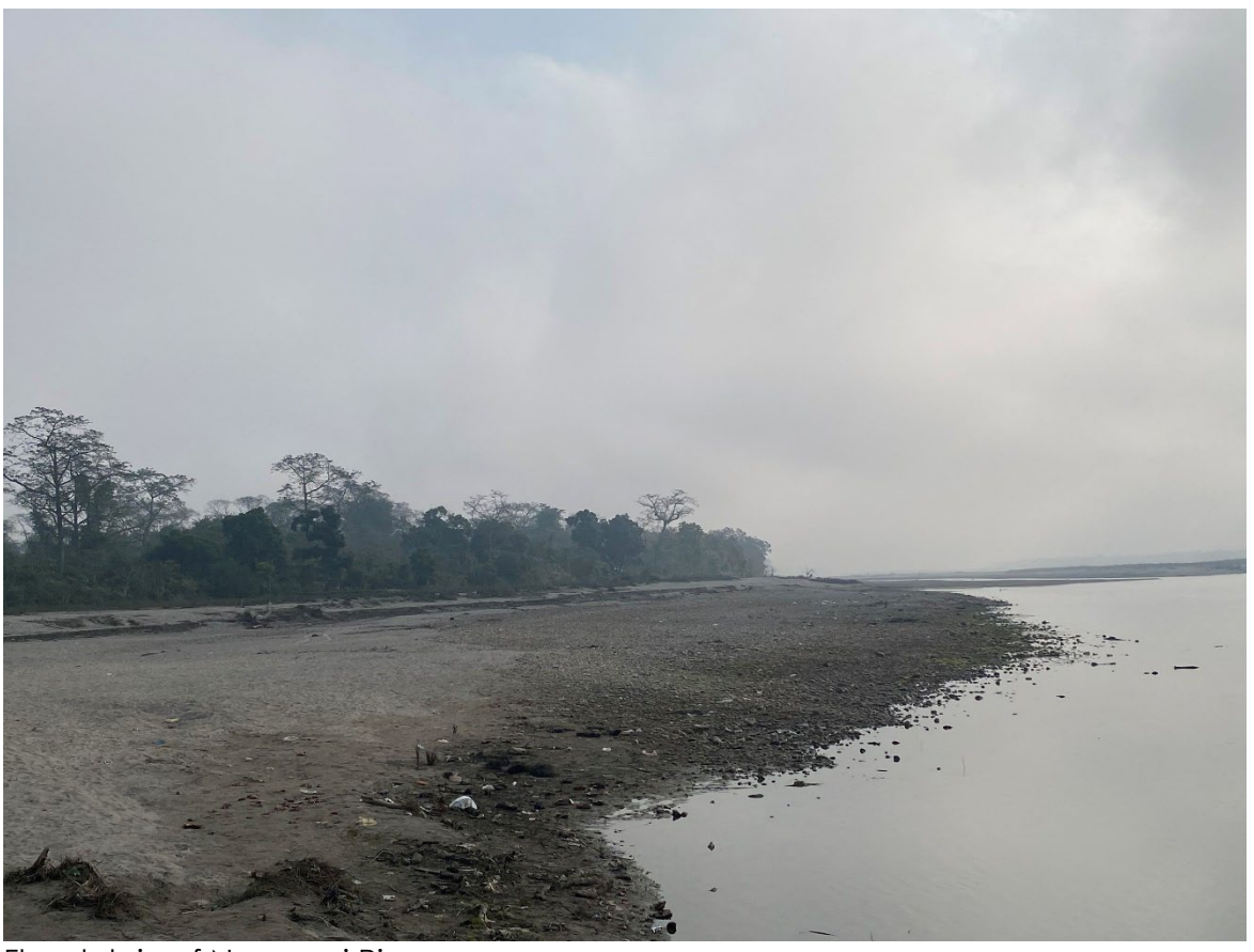
Floodplain of Narayani River.