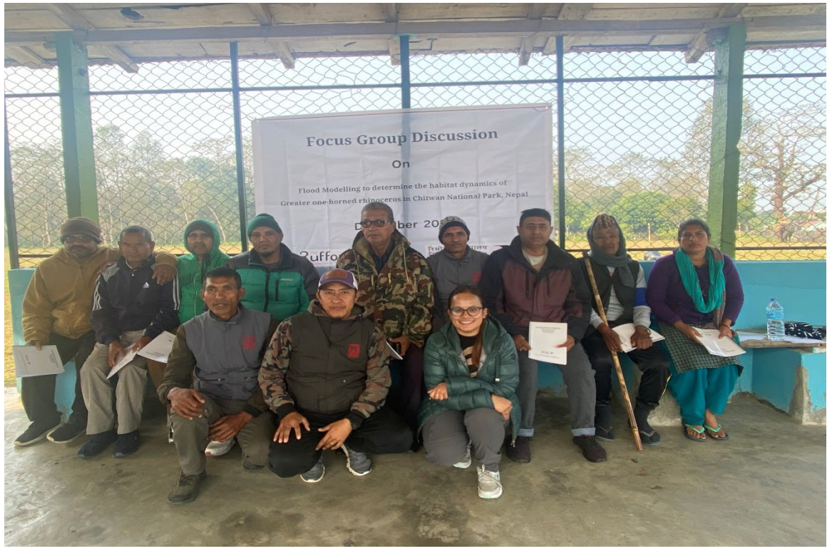
A group photo of FGD in Kumroj (Since some participants had to leave a little early, only the remaining participants are included in the picture).