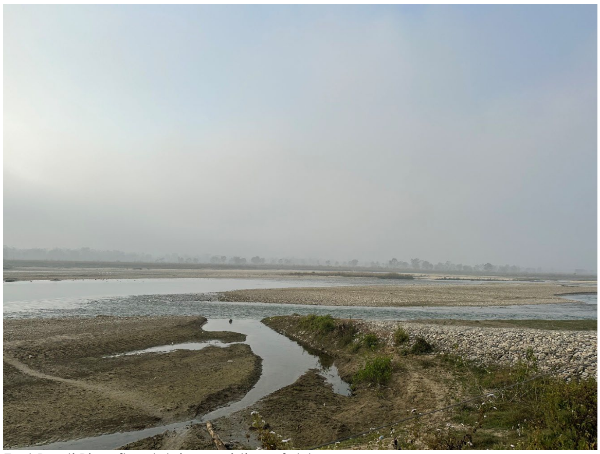
East Rapti River floodplain consisting of dykes.