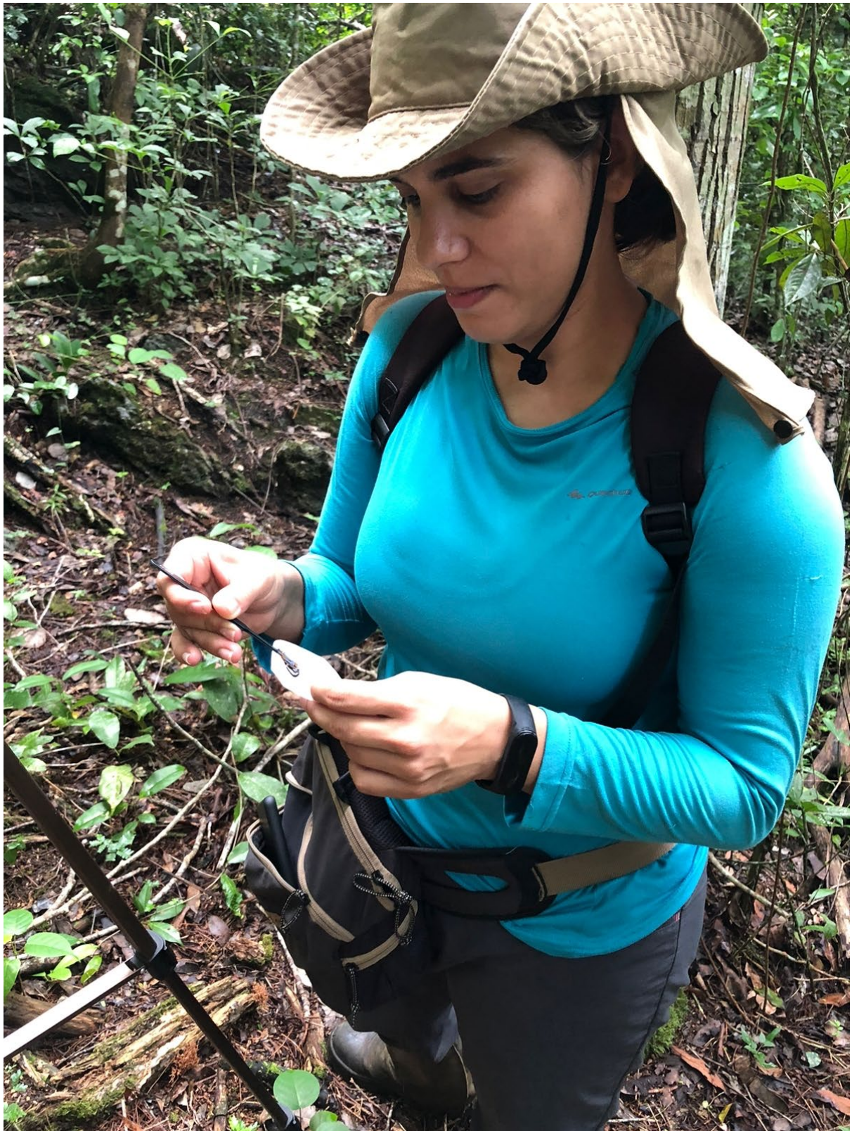
Figure 5: Butterfly sampling.