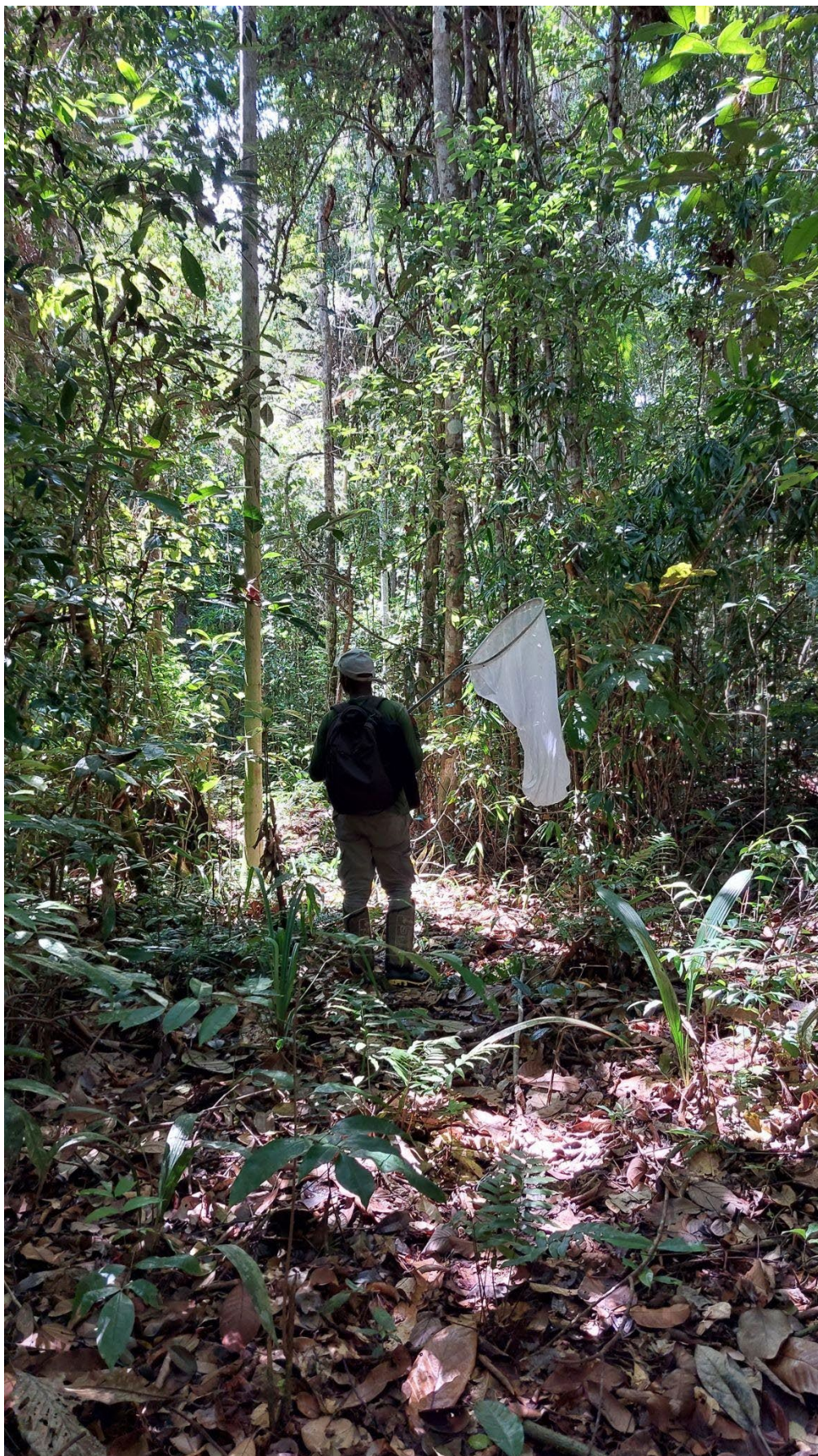
Figure 4: Butterfly sampling.