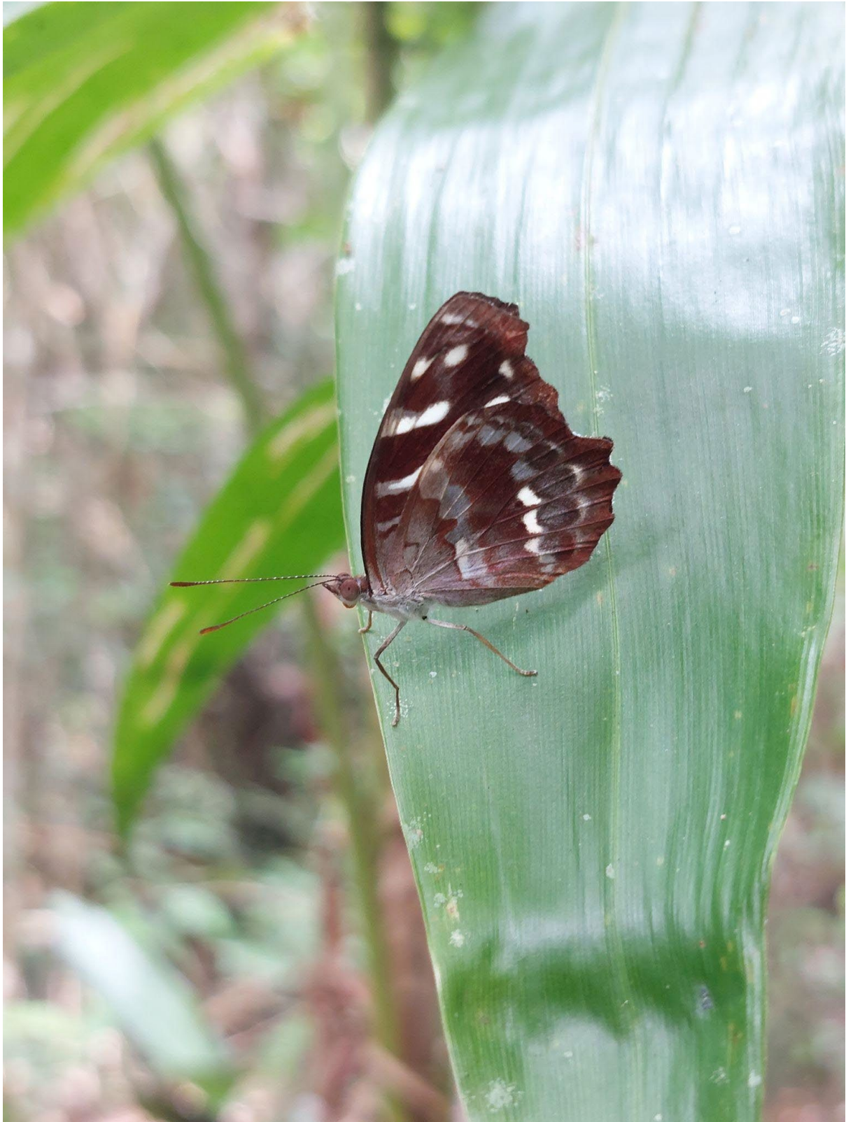
Figure 1: Myscelia orsis . © Geanne Pereira.

Between the 16th January and 17th February 2023 we carried out the first sampling of butterflies. We collect butterflies and take pictures from the canopy in fragments of the Atlantic Forest.