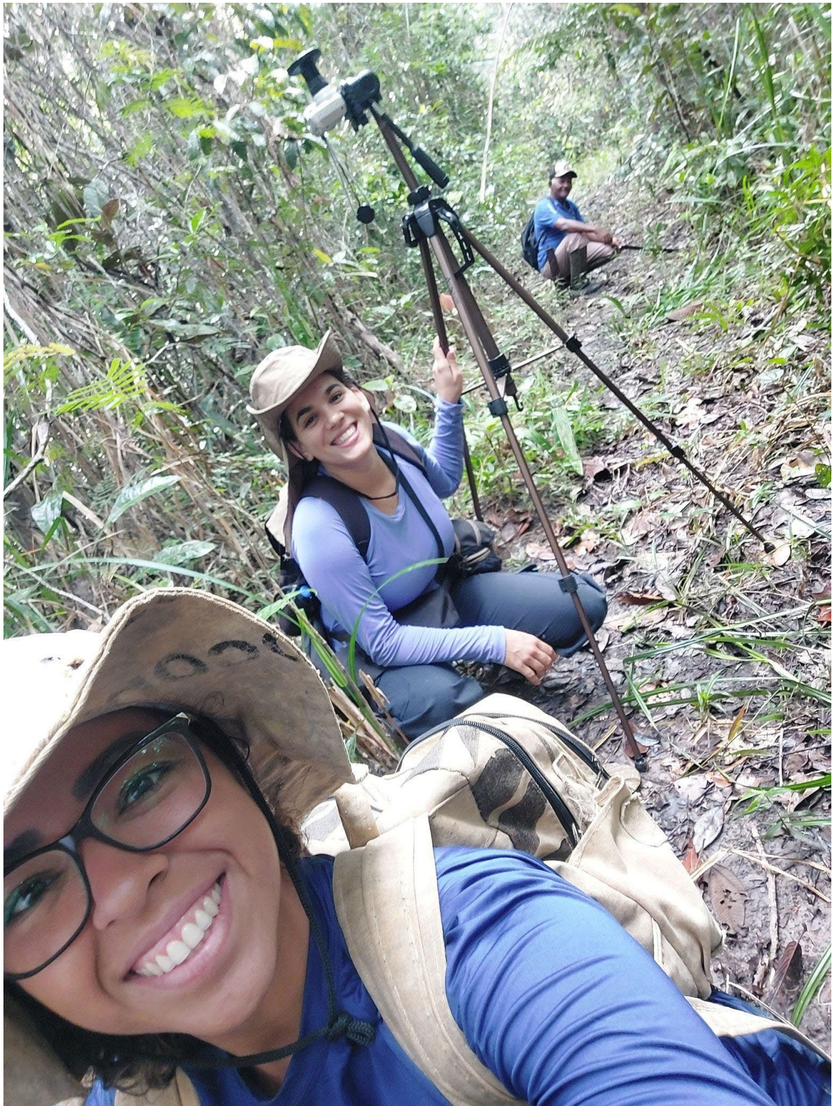
Figure 6: Taking canopy hemispherical photos using a fisheye lens