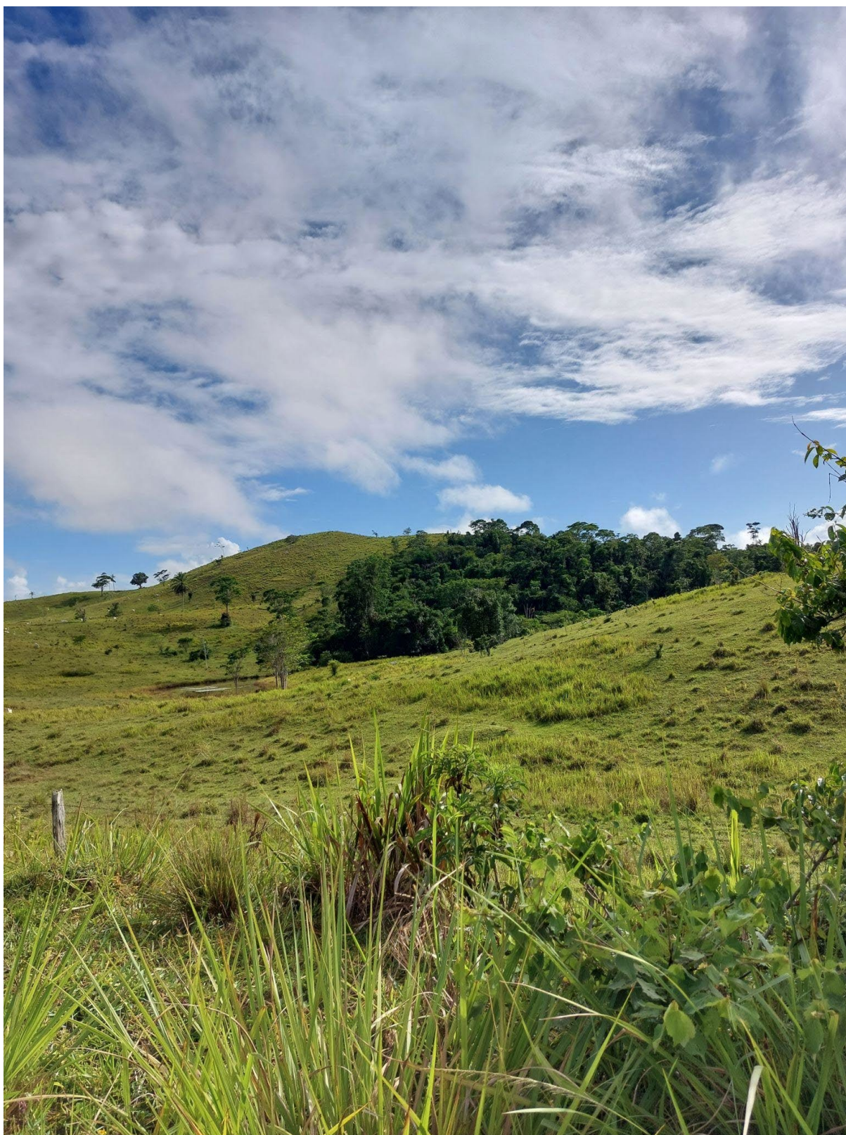
Figure 7: Atlantic Forest fragment