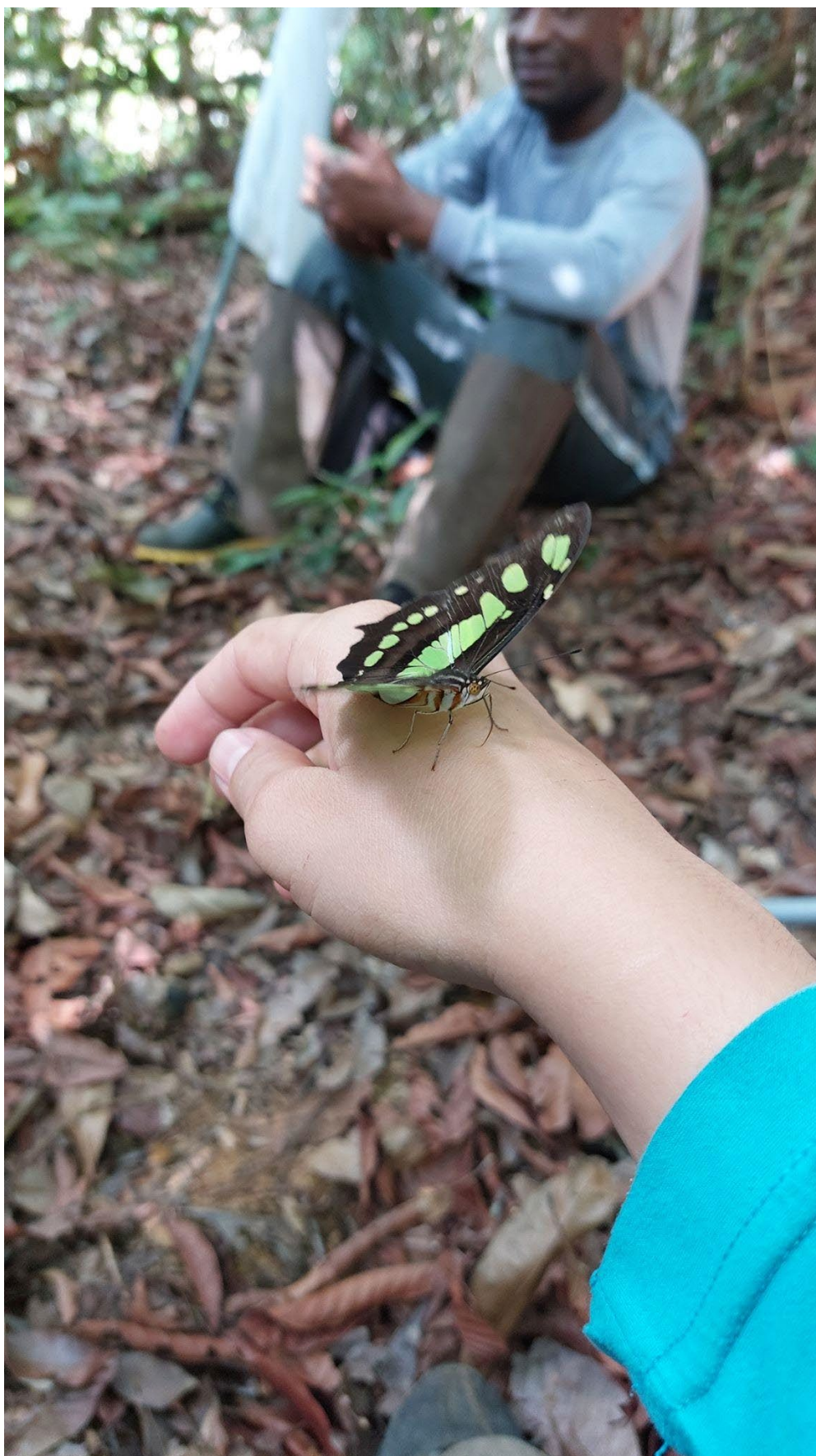
Figure 3: Siproeta stelenes .