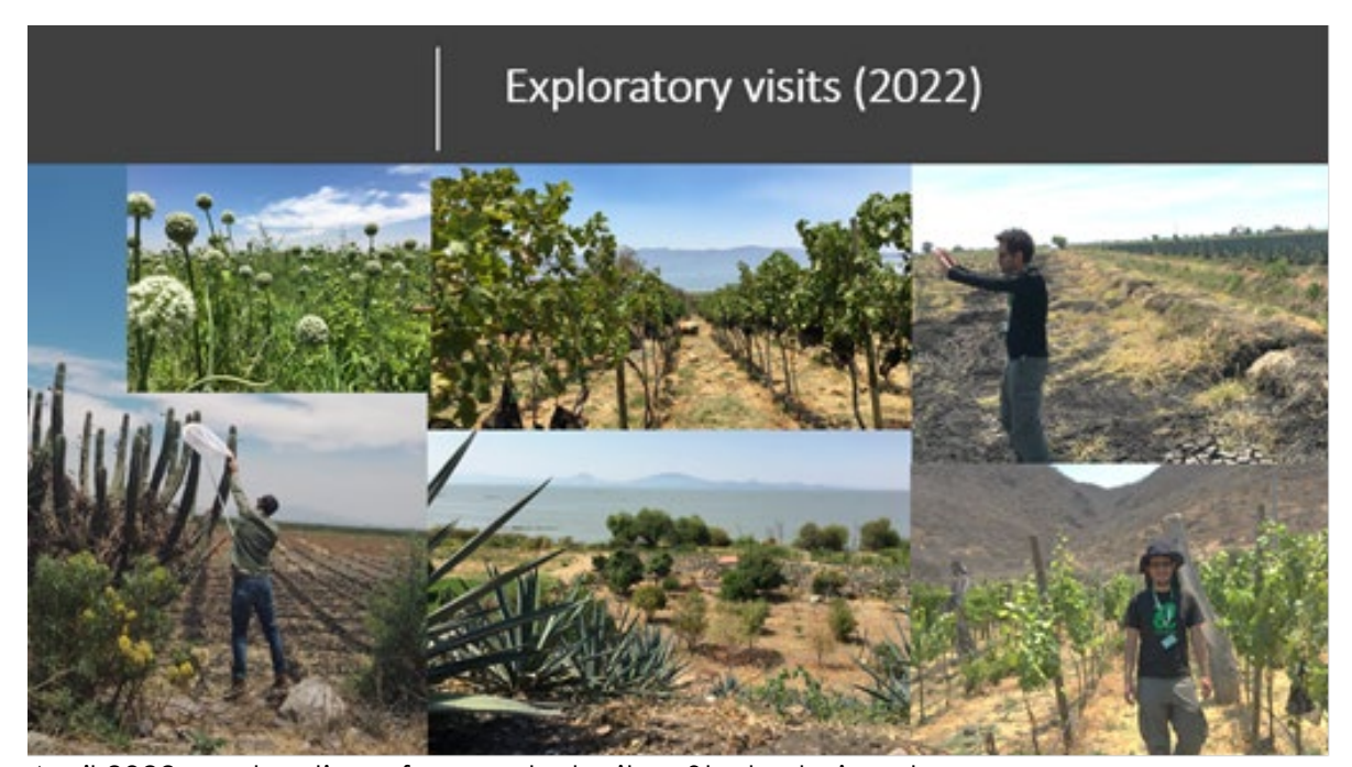
April 2022, exploration of some study sites. Study-design stage.

On the other hand, I had the second project evaluation seminar. Feedback has been given on some of the variables that will be studied in each landscape (image attached).