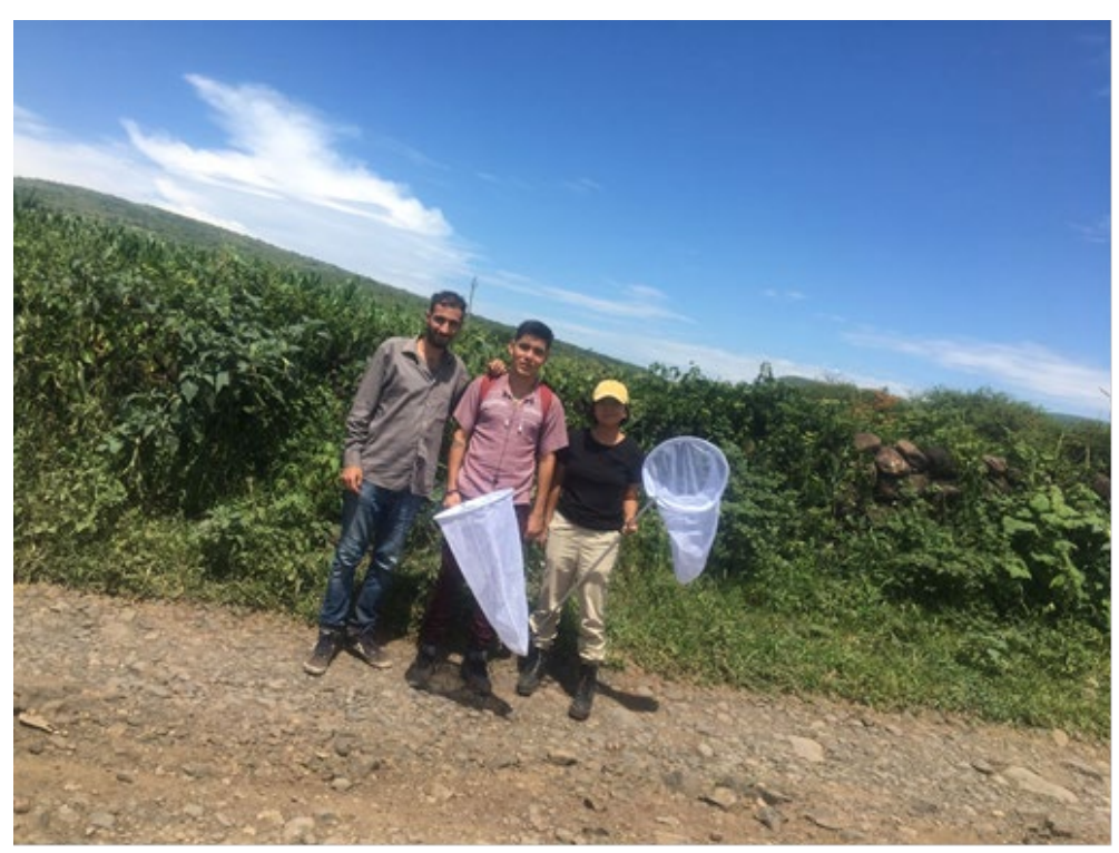
August 20, 2022. Exploration of 12 last sites. Contacting communities, checking environments.