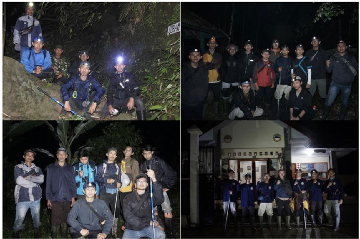
Figure 1. Our field survey team includes BTSNP and RPTN staff, BTSHC team, and volunteers.

The herpetological field survey at Bromo Tengger Semeru National Park (BTSNP) was scheduled between August and October 2022, according to our plan. Due to the requirements of team preparation, volunteer selection, and the risk of extreme weather and disaster (e.g., flooding, landslide, eruption), we believe it will be more practical to extend and conduct the monthly field survey from August to January 2023. (Including the report of species presence from native locals beyond the scheduled plan). Our survey team is comprised of BTSNP and RPTN staff, the Bromo Tengger Semeru Herpetofauna Conservation (BTSHC) team, and a selected number of volunteers (Figure 1).