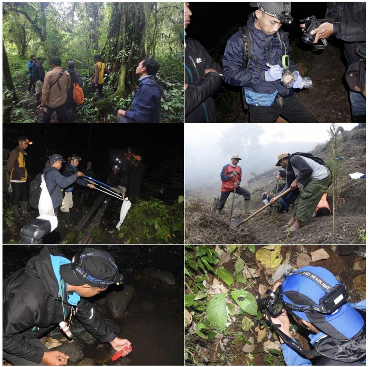
Figure 2. In the BTSNP and its buffer zones, our field survey team is investigating the diversity of herpetofauna and collecting abiotic data.

From 5 August to 13 November 2022, we conducted field surveys at 16 survey sites, including Resort Pengelolaan Taman Nasional (RPTN) in BTSNP (RPTN Jabung, RPTN Trisula, RPTN Ranu Darungan, RPTN Senduro, RPTN Ranu Pane) and buffer zone on the edge of BTSNP (Coban Pelangi, Coban Siuk, Pronojiwo, Jarak Ijo, Coban Jodo, Coban Siuk, Pronojiwo, Wonokitri) (Figure 3).