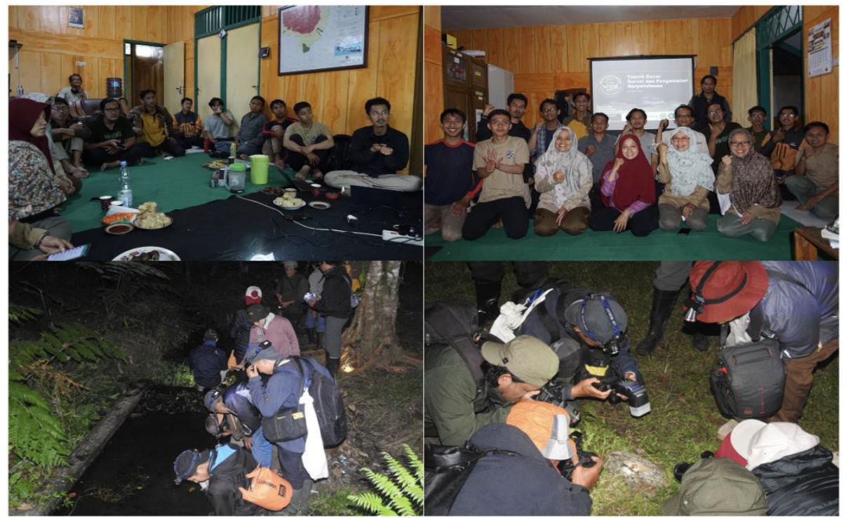
Figure 6. Training & workshop in RPTN Ranu Darungan participated by BTSNP and RPTN staff, and selected volunteers.

This initiative was followed by the creation of a herpetofauna inventory, as well as regular monitoring and surveys in RPTN Ranu Darungan. Herpetofauna species discovered during the training and workshop were afterwards presented in West Bali National Park during Hari Konservasi Alam Nasional (HKAN) 2022 (Figure 7).