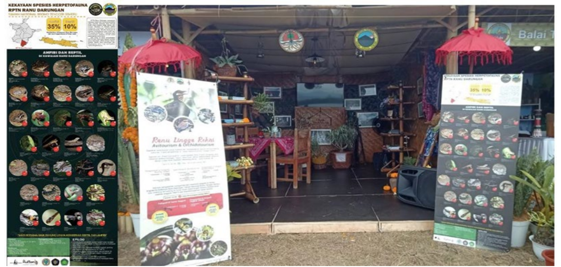
Figure 7. Checklist of herpetofauna species as the training & workshop follow-up's in RPTN Ranu Darungan, presented in HKAN 2022 in West Bali National Park.

Our team also designed the Species Identification Card (SIC) as an educational tool to encourage and cultivate awareness of herpetofauna conservation while collecting secondary data from native locals and visitors (Figure 8). Other than visitors to BTSNP, the SIC primarily targeted the indigenous Tengger tribe residing within BTSNP.