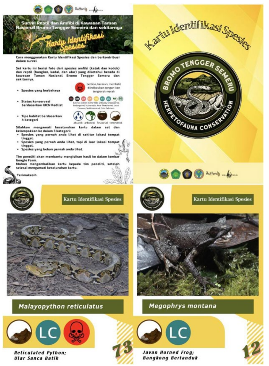
Figure 8. Design of Species Identification Card for this project.

Using a questionnaire, a survey will be undertaken along survey sites (i.e., Ranu Pani, Ngadas) in the enclaved zone to determine the perspectives of BTSNP locals and visitors regarding the conservation of herpetofauna.