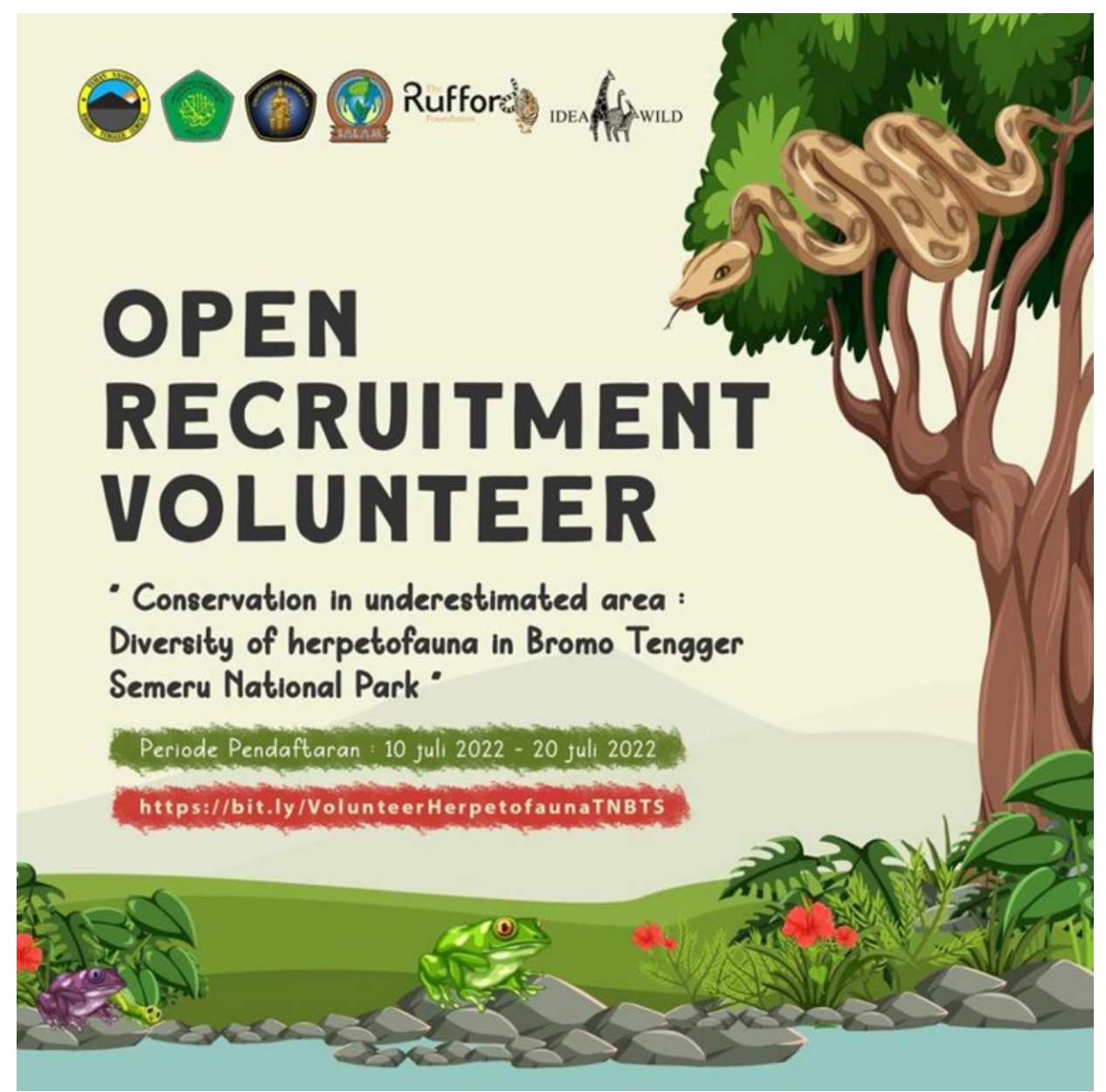
Figure 5. Flyer for open recruitment volunteer for undergraduate student for this project.

Prior to the initial surveys, we held a training and workshop for the selected volunteers and BTSNP and RPTN staff in order to establish standard operational procedures, provide insight into field research, emphasise the significance of herpetofauna conservation, and provide an overview of the project. Under the training and workshop titled Basic Technique, Surveys, and Observation of Herpetofauna in Bromo Tengger Semeru National Park, we disseminated a series of discussions on the introduction to herpetology, the history and future of herpetology in Indonesia, the scope of herpetology research, monitoring and survey technique, photography technique, diversity and abiotic data management, and identification of herpetofauna species. This training and workshop was held at RPTN Ranu Darungan on 23–24 August 2022, with attendance of 10 BTSNP and RPTN staff and five volunteers (Figure 6).