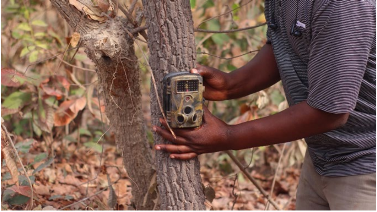
Fig 3: A trap in the field