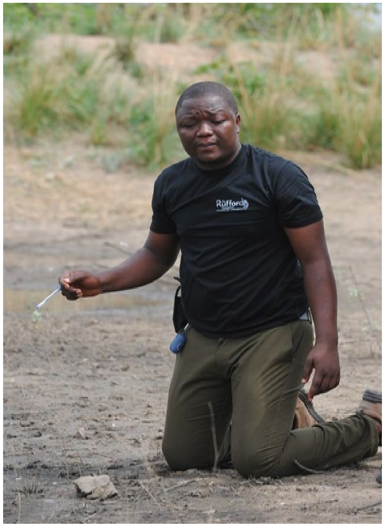
Trying to identify a carnivore footprint