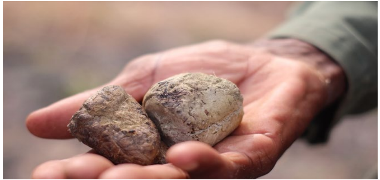
Fig 5: Faeces of a hyaena