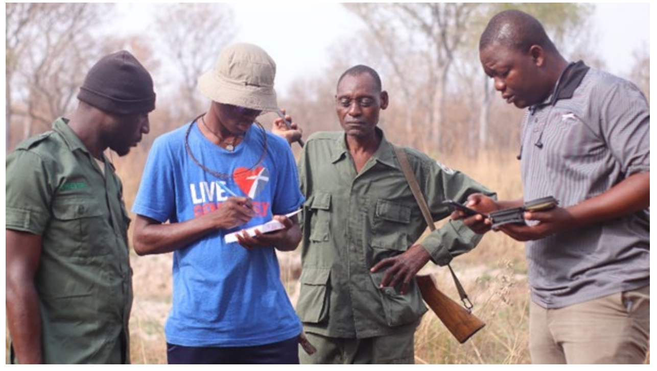
Fig 2: taking and recording the coordinates of the location where the trap would be mounted