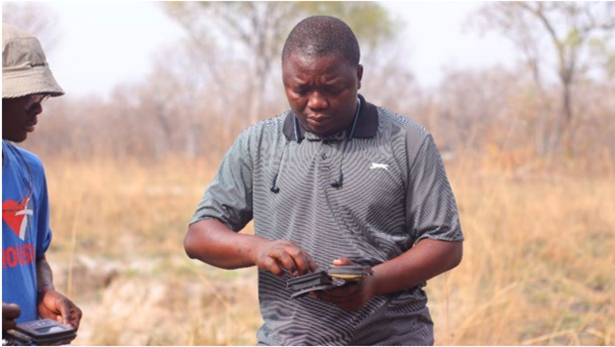
Fig 1: setting the trap before mounting it

The fieldwork to commence the deployment of camera traps began on the 25<sup>th</sup> February 2022 and below are some photos.