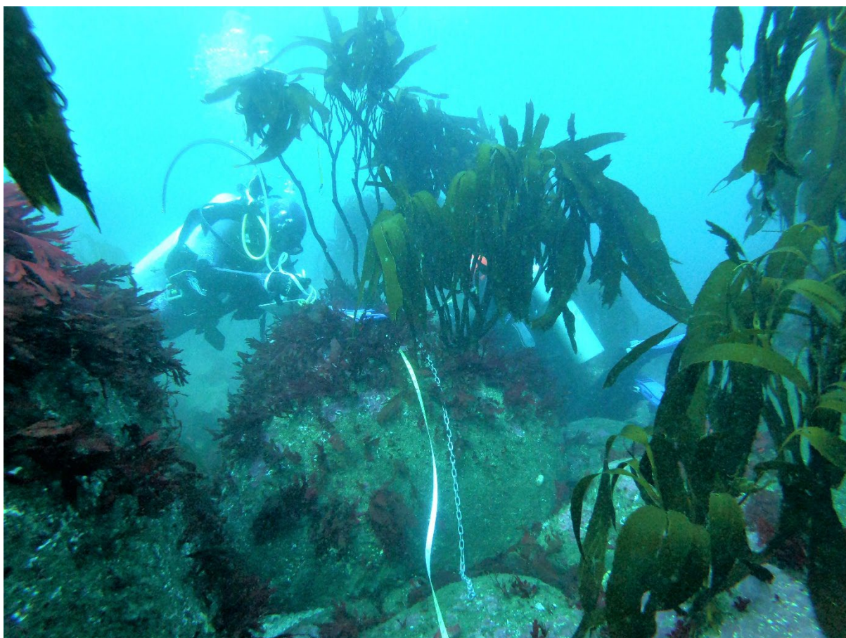
Top & Middle: Kelp forest in South Central Chile. Bottom: Sampling fish and habitat complexity in kelp forest.