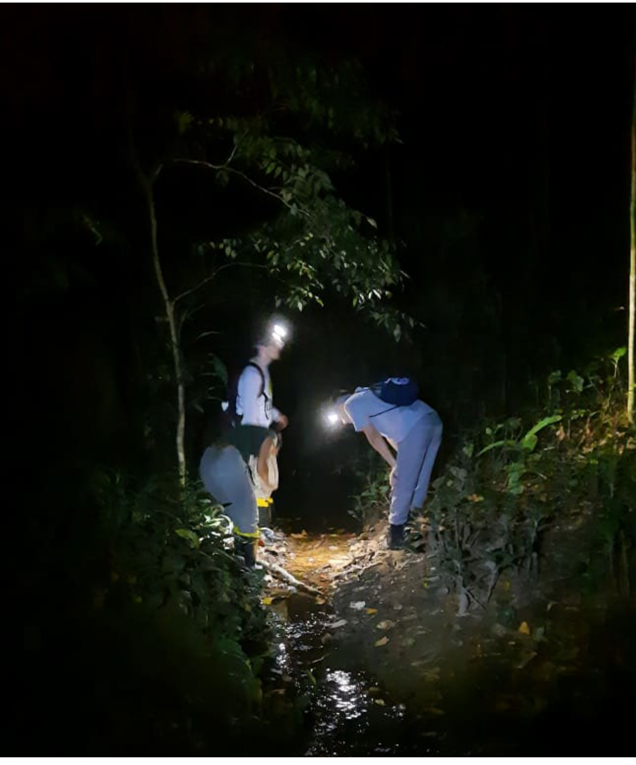
Figure 1. Night sampling in search of amphibians in the Duas Bocas Biological Reserve.

Based on the questions, objectives and activities proposed by the present project, the first development cycle of the project (January–September 2022) was basically focused on the survey, tabulation and organisation of secondary data collected through literature searches. In addition, some field campaigns were carried out in two sampling sites to recognise the areas, as well as a previous survey of the amphibian fauna and measure some variables to be tested in the multi-species occupancy models. In the field campaigns, 54 individuals of 14 amphibian species were recorded in the Duas Bocas Biological Reserve and 21 individuals of seven species in the Paulo César Vinha State Park. These records, as well as the information obtained from the secondary data, were tabulated into complete raw data sheets to proceed with the data analyses.