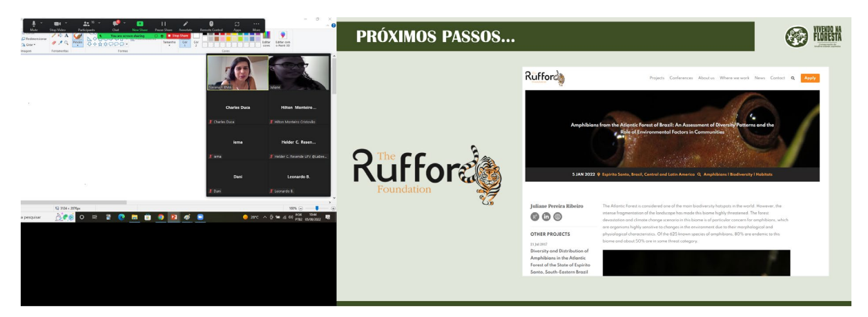
Figure 4. Presentation of the online lecture on the conservation of Atlantic Forest amphibians, highlighting the important support provided by the Rufford Foundation in the development of the projects.

Additionally, also in August 2022, a lecture was given at the Rio de Janeiro State University (PPGEE UERJ). The lecture was entitled "Amphibians from one of the largest remnants of the Atlantic Forest in Brazil: climatic factors and habitat structure affecting the local community".