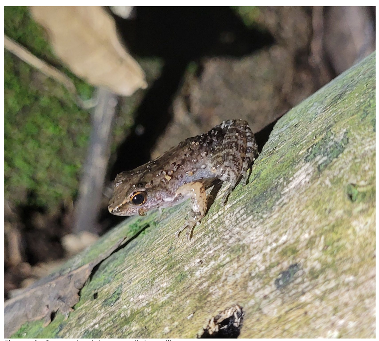
Figure 2. Crossodactylus gaudichaudii.

In the first cycle of the project, we wrote a manuscript on the detectability of a frog species from the streams of the Atlantic Forest ( Crossodactylus gaudichaudii ). In this article, we discuss the importance of water conditions in streams for the conservation of the species. The manuscript is submitted to the scientific journal Austral Ecology.