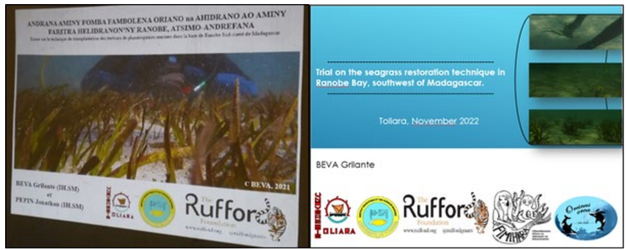
Photo 3: Examples of events where the Rufford Foundation logo was used (Left: Presentation during the community awareness session, Right: Presentation during the Blue Carbon workshop at the Institute of Fisheries and Marine Sciences, University of Toliara, Madagascar).

partnership with the Indian Ocean Rims Association (IORA) on November 27th to December 2nd, 2022.