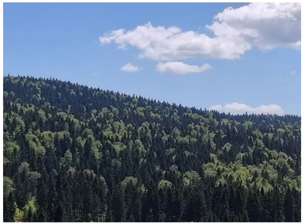
Fig. 4. Mixed three-dominant forests of beech, spruce, and fir cover 85% of the forest area on Tara Mt.