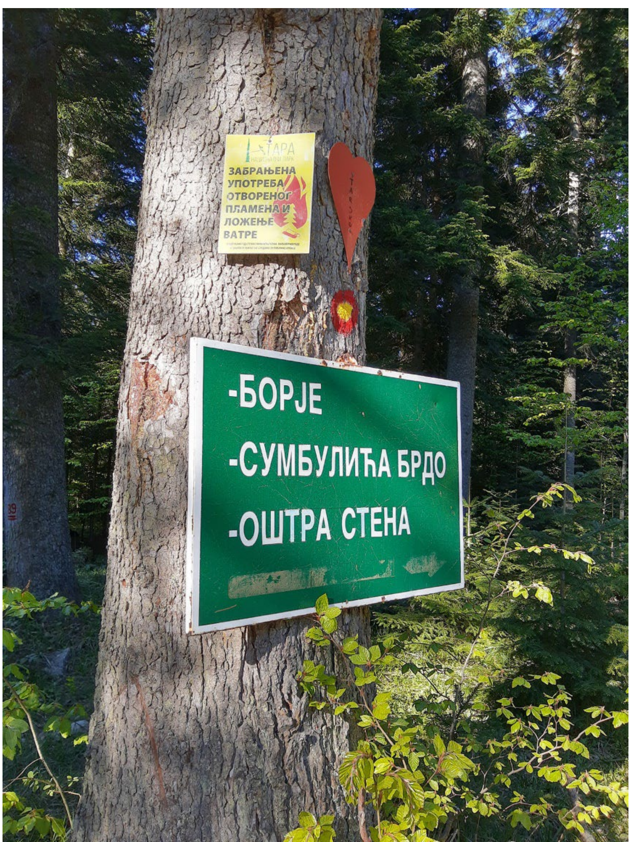
Fig. 5. A sign prohibiting the use of fire.