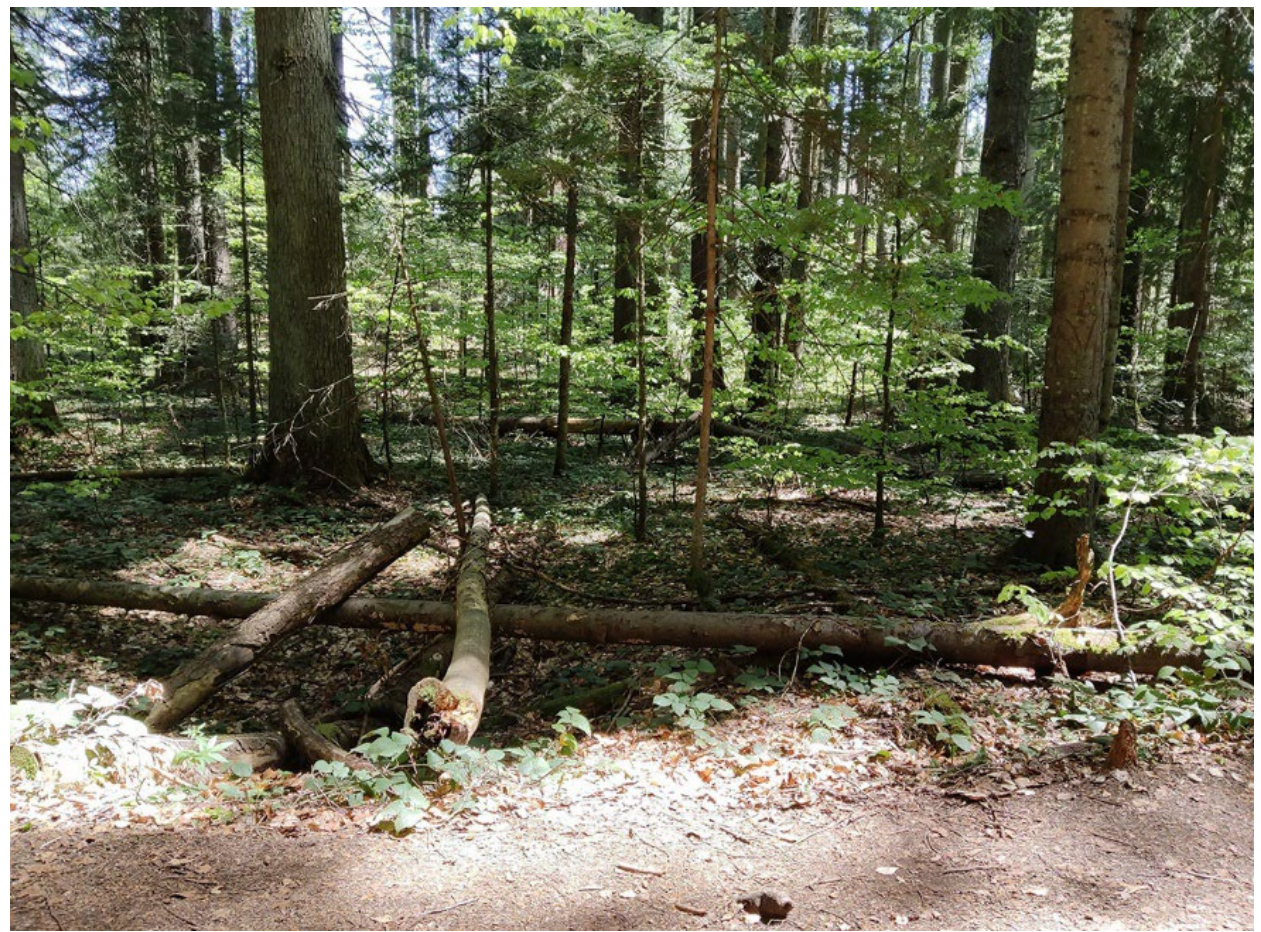
Fig. 2. An example of management in the First regime of conservation, Crveni potok.

We submitted a request for a research licence, and after an assessment by the Ministry of Environmental Protection of the Republic of Serbia, we were provided permission to conduct scientific surveys (License No 351-01-1319/2022-04, issued May 20, 2022, and valid for 2022).