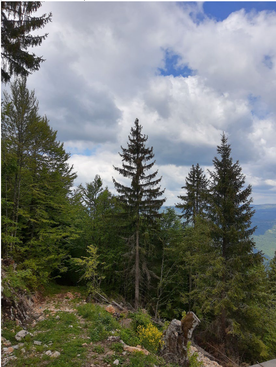
Fig. 1. A view of the Serbian spruce.

We conducted an initial ecological survey of the terrains in the Tara Mountain during the first months of our study. We surveyed many areas in the Tara National Park, including natural habitats of Serbian spruce (Fig. 1). There are 12 populations located in the first regime of protection (Fig. 2), i.e., natural reserves, and one in the second regime of protection. Because the number of Serbian spruce specimens in reserves ranges from 1 (Gorušice) to 50.000 (Zvezda), their contribution (percentage) to forest communities varies from negligible (Gorušice, Aluška planina, Crveni potok) to significant (Zmajevački potok 34% and Bilo 38%).