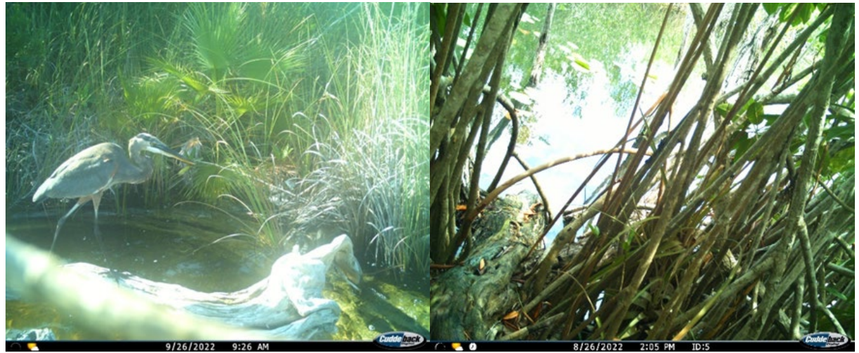
Fig. 5. Photographic captures of two camera trap stations installed in the Bacalar lagoon during August-September 2022.