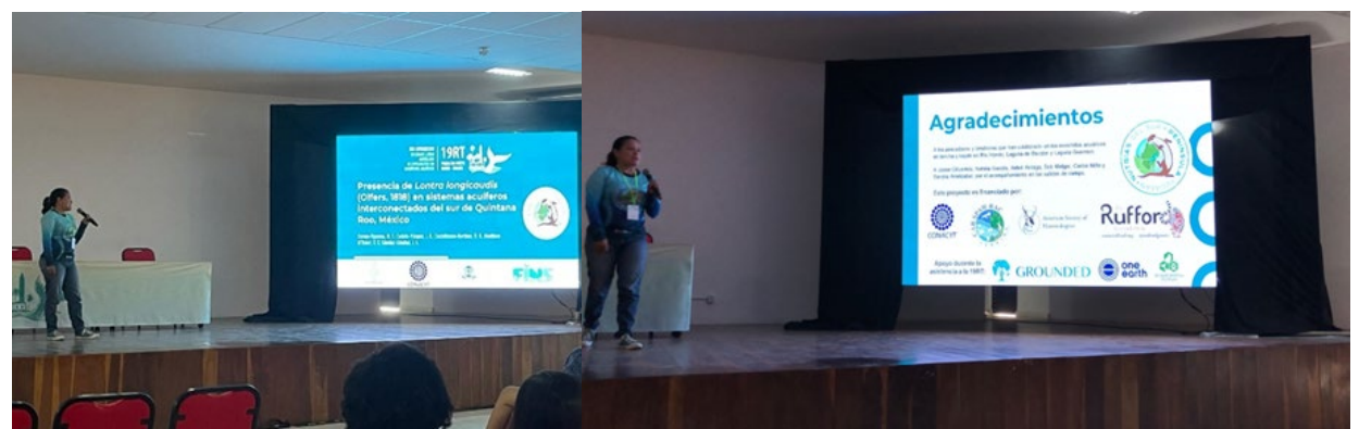
Fig. 6. Presentations made during the SOLAMAC Congress, in Praia do Forte, Bahia, Brazil.