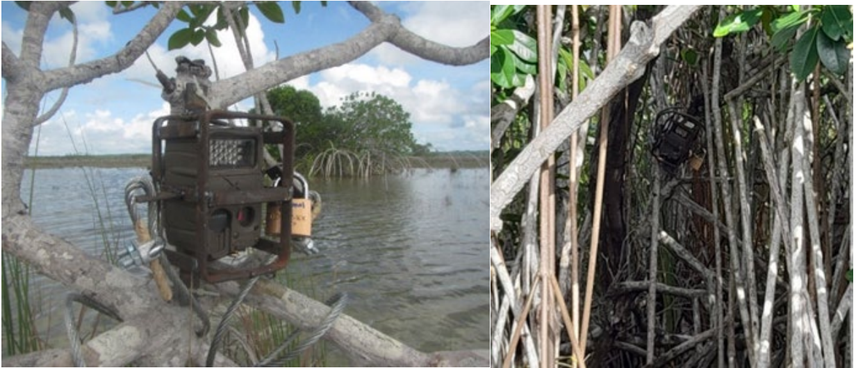
Fig. 4. Camera trap stations installed in the study area.

At the end of August 2022, 12 photo-trapping stations were installed in Río Hondo (n = 6) and in Laguna de Bacalar (n = 6). The cameras were installed in the places where indirect evidence of the presence of otters (footprints, faeces) was found, adjusting themselves in the trunks of pucté, red mangrove or buttonwood trees, at a height of approximately 1 m, to avoid immersion in case the water level rises. In addition, the cameras were installed with a metal casing to prevent uninstallation by people outside the project. Each camera targeted the area of the water surface and the shoreline of the body of water. The configuration assigned for each camera was two photos and one video of 10 seconds. It is important to mention that the camera traps were monitored by local people who have supported the field trips for this research.