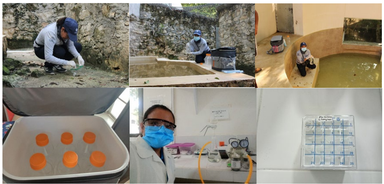
Fig. 1. Activities related to the eDNA technique. Above: Collection of feces and water samples at Akumal Monkey Sanctuary. Below: water samples, filtration process and filtrates obtained in the eppendorf tubes.

In June 2022, the vacuum pump, and the filtration equipment (kitazato flask, funnel, handle and hoses) were acquired to filter DNA in water samples. In June and July, the first tests of the equipment were carried out with different water samples to estimate the filtering time. On August 12, 2022 the Akumal Monkey Sanctuary in Quintana Roo was visited, where three Neotropical otter specimens are in captivity. The purpose of the visit was to collect six water samples (1 I each) from the pools where the otters are kept, as well as faeces samples, as a positive control for environmental DNA analysis. The samples were filtered with the filtration equipment using 0.40 \mu m cellulose membrane filters. Filters were stored in sterile Eppendorf tubes in a freezer until extraction.