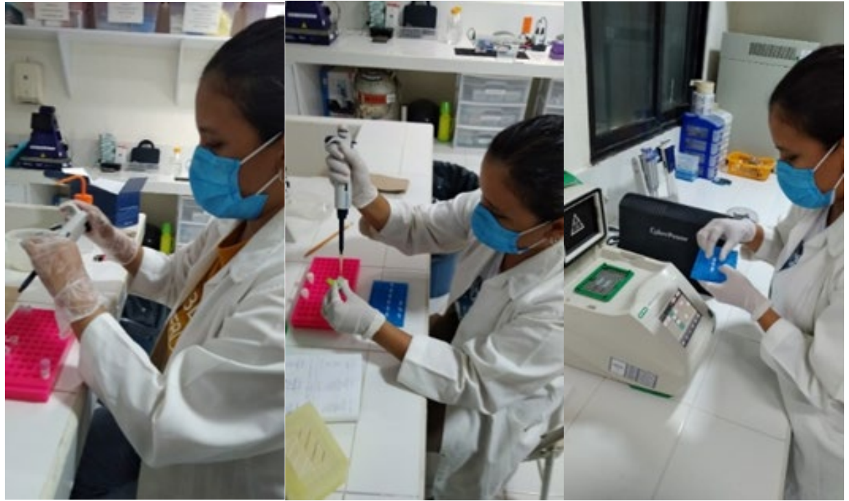
Fig. 2. DNA extraction activities in water and feces samples and sample preparation for PCR amplification.

from the water. Therefore, modifications to the PCR conditions will be made to obtain the expected results.