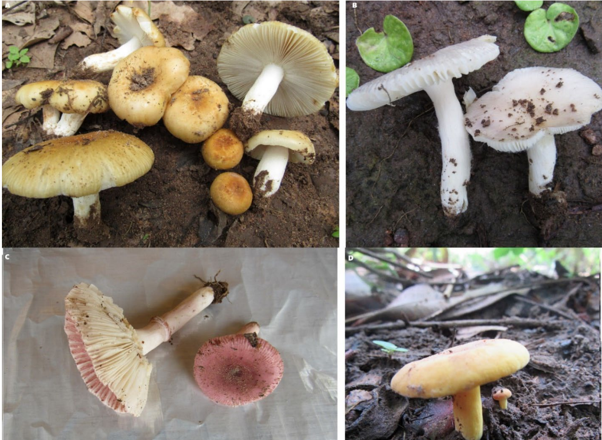
Fig. 6. A. Russula sp (HLA0919), B. Russula sp. (HLA0904), C. Russula sp. (NY00137) and D. Lactifluus cf. flammans (NY0053).