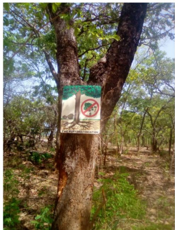
Fig 3. Installation of wild fungal warning signs in the forests