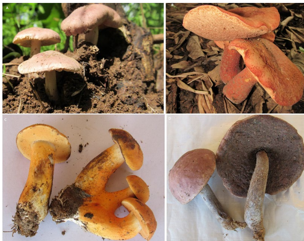
Fig 5. A. Boletus sp. (NY0004), B. Boletus sp. (NY0035), C. Boletus sp. (NY0043) and D. Boletus sp. (NY0075).