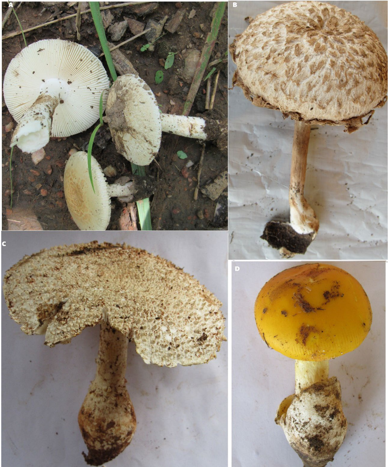
Fig.8. A. Amanita subviscosa Beeli (NY0049), B. Amanita sp. (HLA0428), C. Amanita sp. (NY0031) and D. Amanita masasiensis Härk. & Saarim.