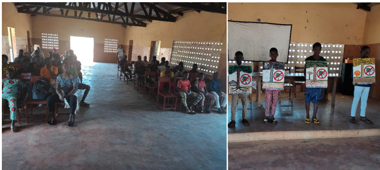
Fig 1. Realization and explanation of wild fungal warning signs

These wild mushroom warning signs will facilitate ongoing communication between local people and mushrooms and their habitats for sustainable mushroom conservation.