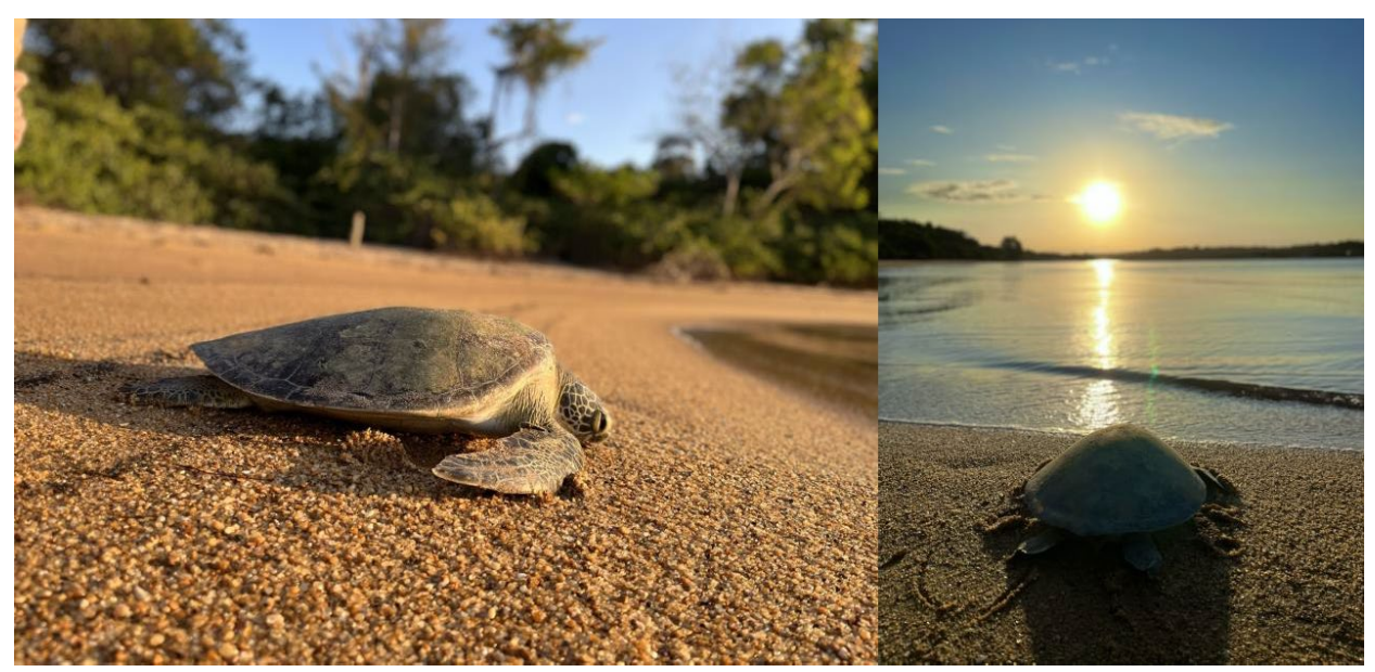
Figure 4. A green sea turtle going back to the sea after the health assessments.