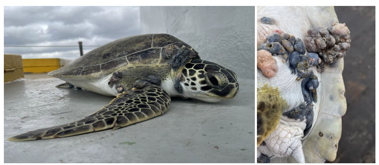
Figure 2. A sea turtle with fibropapillomatosis, a debilitating disease that is present in 50% of the sea turtles from Santa Cruz.