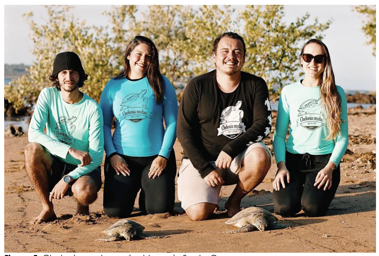
Figure 5. Chelonia mydas project team in Santa Cruz.