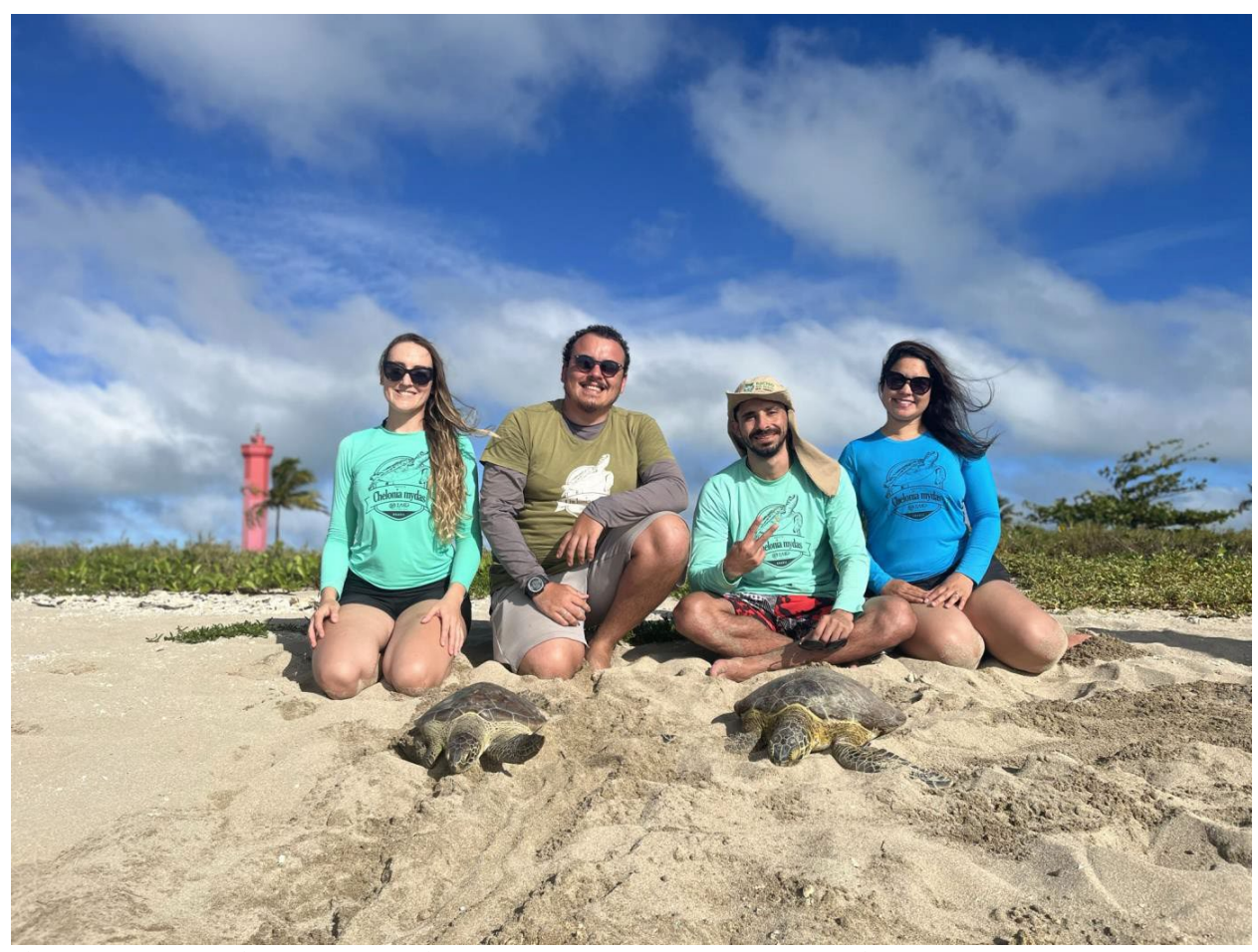
Figure 6. Chelonia mydas project team on Coroa Vermelha island.