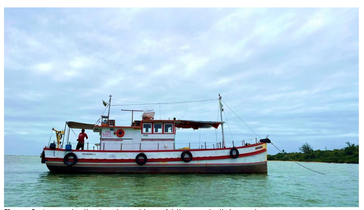
Figure 3. Armando, the boat used to assist the sea turtle's capture.