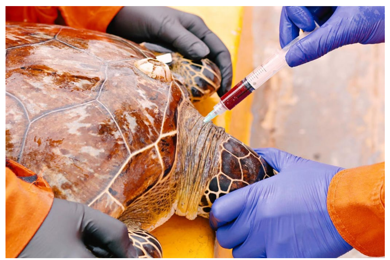
Figure 6. Blood sampling

We were at Coroa Vemelha Island between August 27th and 31st 2022. We were able to collect blood samples and perform a physical examination on 45 green sea turtles.