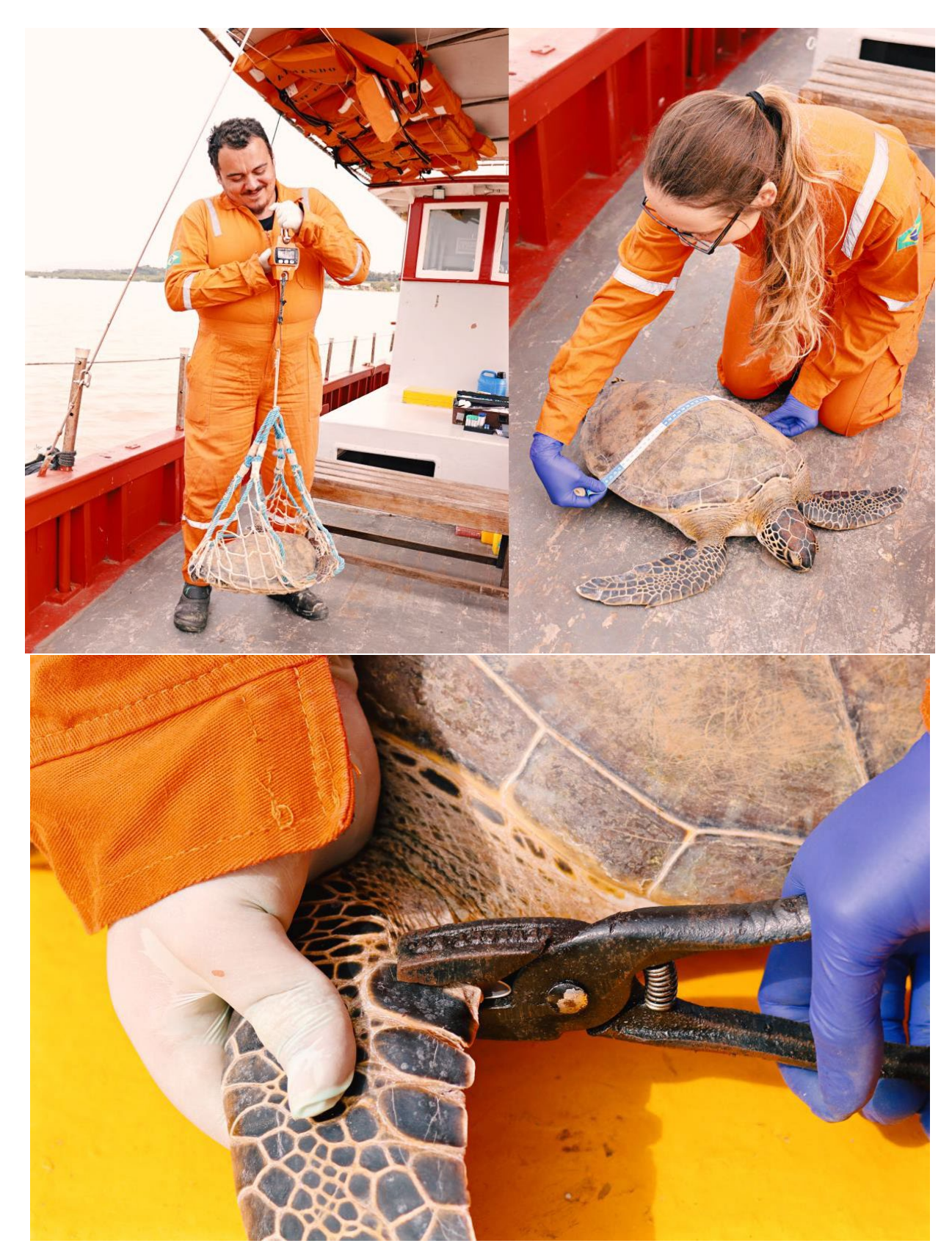
Figure 7. A green sea turtle being weighted, measured, and tagged during the field work.