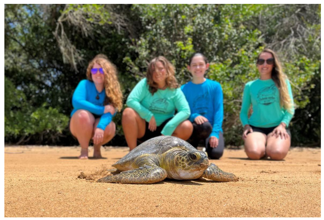
Figure 3. Chelonia mydas Project team.