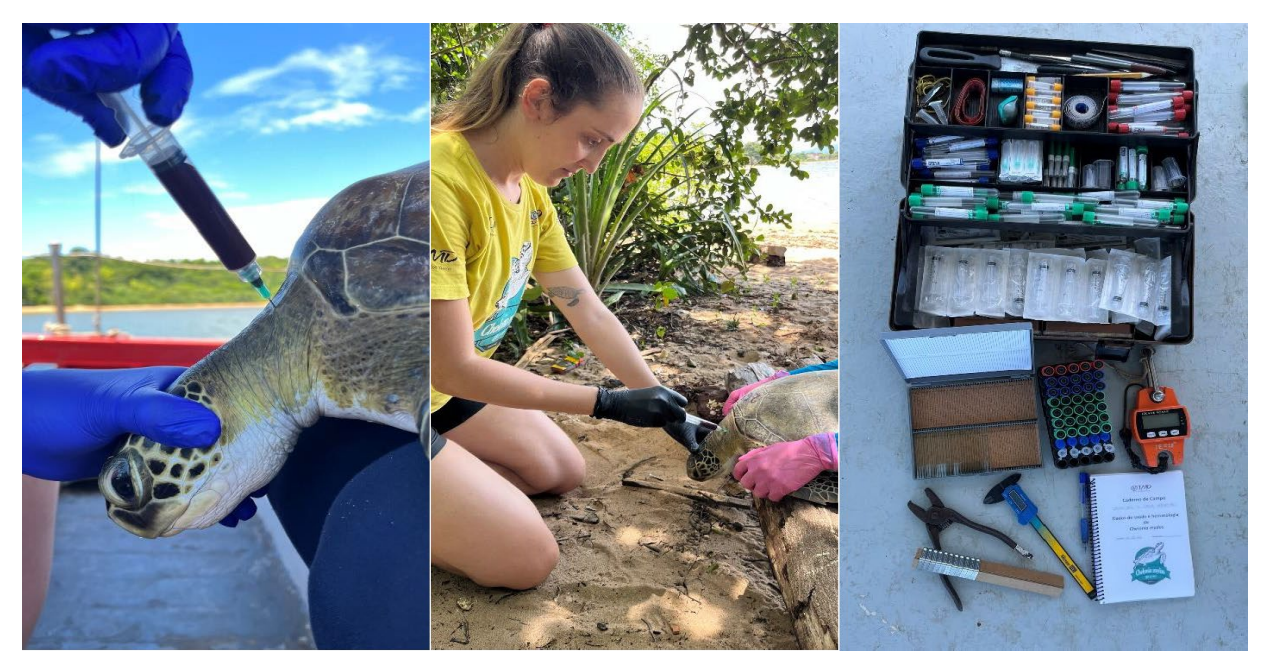
Figure 4. Blood sampling and field work materials

We were at Coroa Vemelha Island between January 27<sup>th</sup> and 31<sup>st</sup> 2022. We were able to collect blood samples and perform a physical examination on 45 green sea turtles.