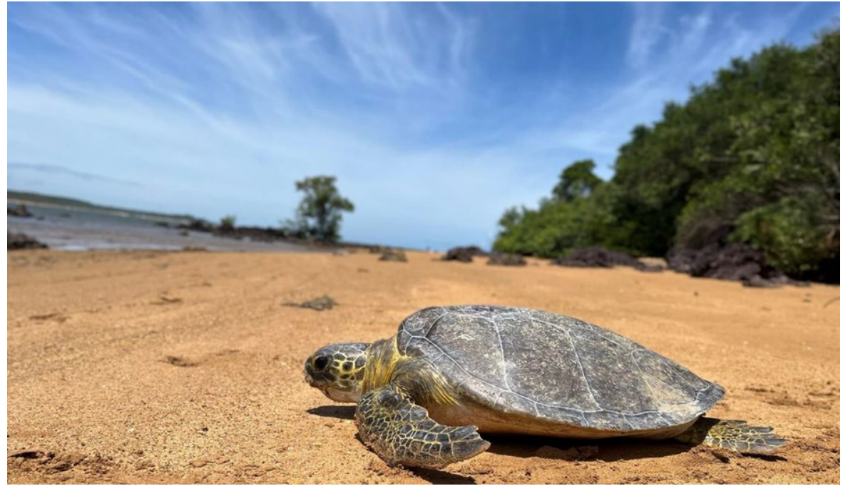
Figure 2. A green sea turtle going back to the sea after the health assessments.