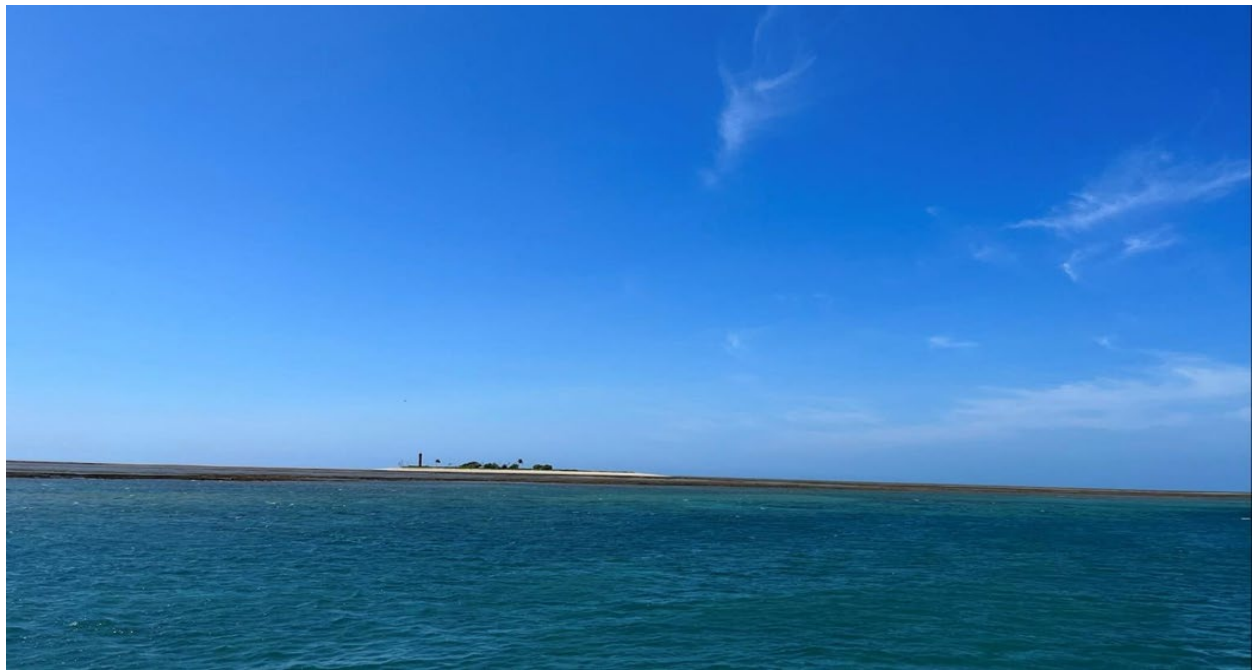
Figure 6. Coroa Vermelha Island in low tide.