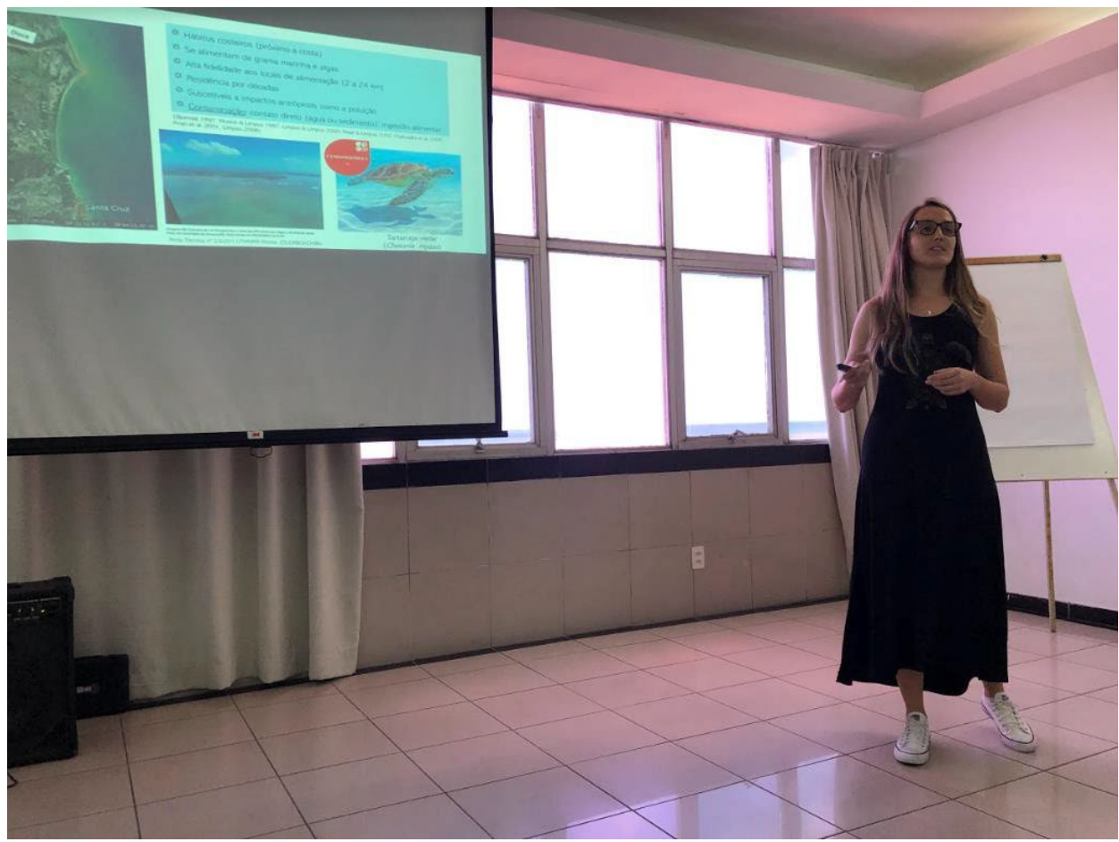
Figure 9. Project presentation at Rufford Conference.