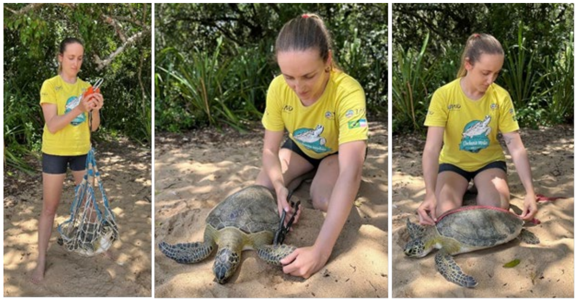
Figure 1. A green sea turtle being weighted, tagged, and measured during the field work.

We were at Santa Cruz between January 17<sup>th</sup> and 25<sup>th</sup>. We collected blood samples and performed a physical examination on 45 green sea turtles.