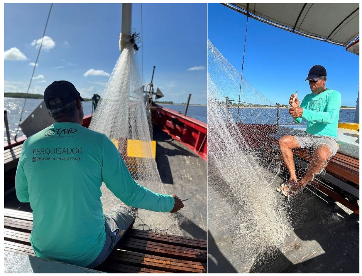
Figure 5. A fisherman fixing the net used to capture sea turtles.