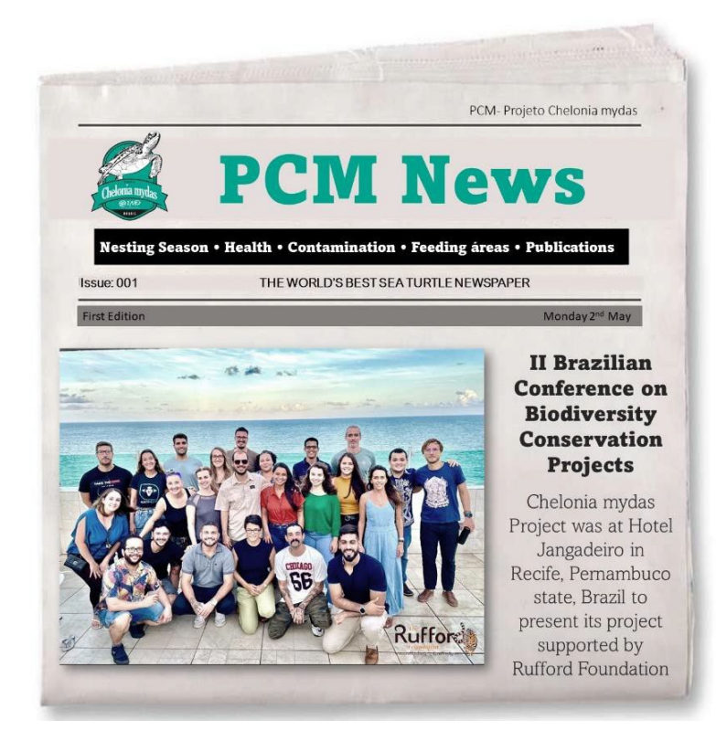
Figure 8. The post about the event in our Instagram page (@projetocheloniamydas).

In April 2022, Chelonia mydas Project was at Hotel Jangadeiro in Recife, Pernambuco state, Brazil to present its project supported by Rufford Foundation on the II Brazilian Conference on Biodiversity Conservation Projects.