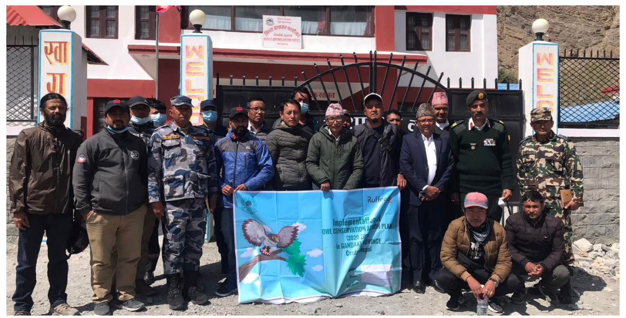
Workshop on owl conservation in the Mustang district, which borders China. The workshop was attended by all local politicians, law enforcement agencies, and stakeholders.