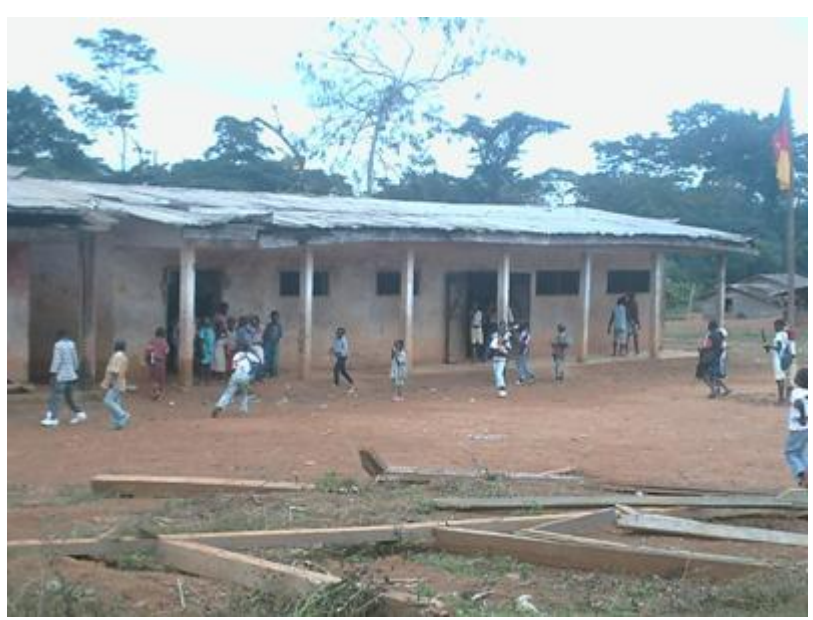
Children of classes one to six coming out of the two classes where they attend lectures presently taught by three teachers in Government primary school Deng Deng

See statistics for teachers and pupils in various schools for last year. These teachers are either government employed, Rural Council of Belabo employed or Parents employed.