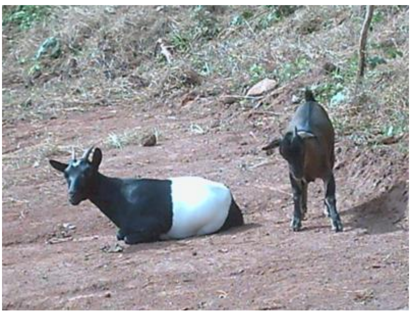
Animals are seen moving without control in the region