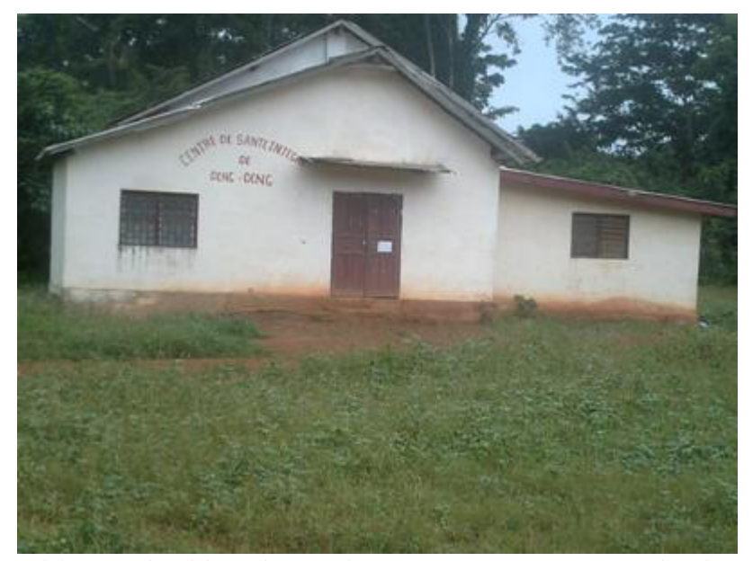
Health Post building located in Deng Deng constantly closed.

When we failed to meet the Chief of Post for Health, we talked with the retired nurse who informed us that all through his working life in Deng Deng he had seen that the following diseases are common in the region: malaria, diarrhoea, romatism, eye problems, yellow fever, skin infectious, hernia, tuberculosis and onchocerciasis (river blindness). He said HIV/AIDs could be present but he had not yet seen any case. There could be a possibility to determine the HIV/AIDS infection rate if there is available laboratory equipment to test for HIV/AIDs.