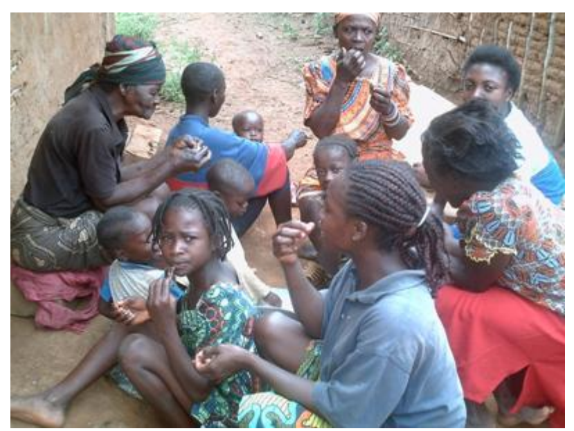
A family sharing a meal prepared from cassava and okra together at Deng Deng

Agriculture is given little attention in this region by the population because it takes much time to yield fruits as compare to fishing, hunting and artisanal logging that gives fast and immediate money with comparatively little straining. Agricultural methods used in this region are inferior resulting in poor output. No credit facilities are available to promote investment in the agricultural sector and so this sector remains under developed and can not improve on the living standards of the population. Prices of agricultural products remain low in the region as there exist a lot of difficulties to sell agricultural produce, firstly due to poor roads linking the area to nearby towns and secondly due to the lack of a market and a fixed market day in Deng Deng for trading to occur.