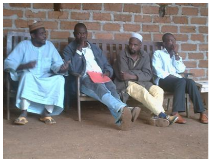
Traditional Chiefs say nobody can enter the forest without passing through them

The traditional authorities say nobody can enter the forest without passing through them and negotiating with the families that owned the piece of forest. If anybody attempt to do so, their ancestors will not let them in, lamented the chief of Lom Pangar. The traditional chiefs of the region can have a strong role to play in stopping this forest exploitation by foreigners from happening.