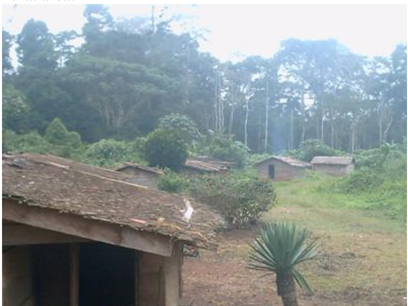
The population of Deng Deng live closer to their forest as it is a source of their livelihood. They say the forest is the backbone of their community

The people of Képéré Deng Deng depend highly on the forest for their livelihood. Their culture, tradition, feeding habits and livelihood had evolved closely with the forest. They depend on the forest for vegetable, fruits, food, water, protein, shelter, medicine, nuts, palm wine and for many more other needs. The forest gives them a source of subsistence activities. One village youth told us that 'the forest is the backbone of the Deng Deng community'. We were made to know that from the ancestral period the forest had been divided to various families in the forest community and those generations that follow only come in to inherit. This, the new generation has come to meet. They said, no stranger could come in to the forest for any activity without consulting and paying some money to the family concern and the traditional chief of that area.