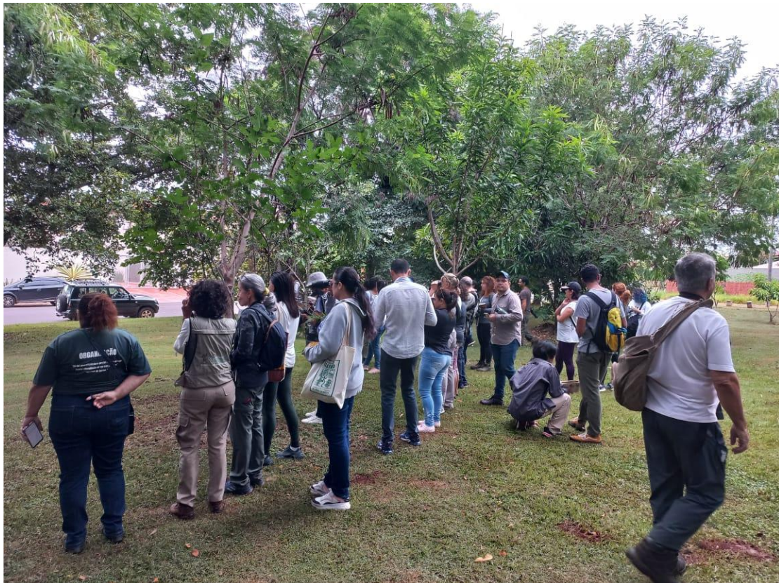
Photos taken during the event of birdwatching and results' dissemination.

This first launching event included the participation of people of different ages and interested in observing and photographing wildlife. It took place in