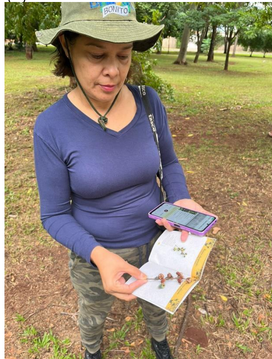
Photos taken during the event of birdwatching and results' dissemination. (A) (B-D)

See a report about the event published in a local newspaper (@campograndenews): https://www.campograndenews.com.br/lado-b/comportamento-23-08-2011-08/com-plantas-em-todo-canto-passarinhada-rola-ate-no-quintal