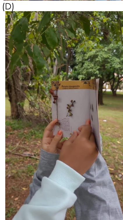
Photos taken during event of birdwatching and results' dissemination. (A-B, D) (C)