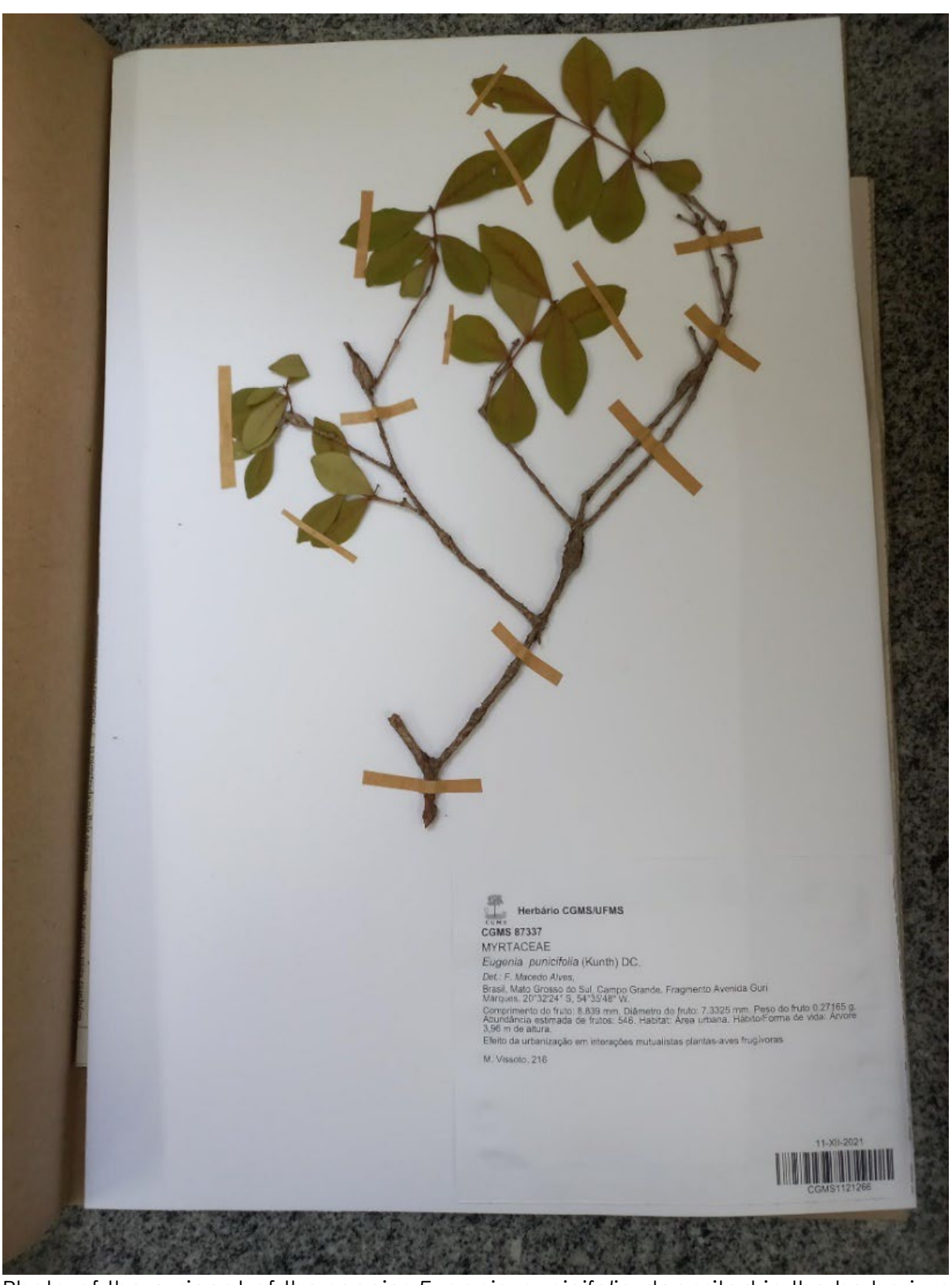
Photo of the exsiccat of the species Eugenia punicifolia deposited in the herbarium collection of the Federal University of Mato Grosso do Sul.