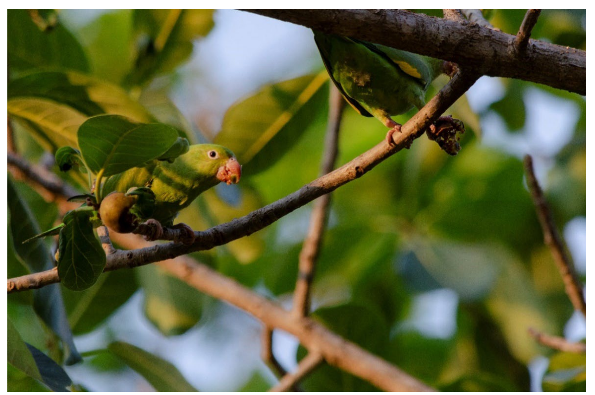
Pictures in the field: Yellow-chevroned Parakeet (Brotogeris chiriri) consuming fruits of Ficus obtusifolia.

See video recording of Toco Toucan (Ramphastos toco) consuming fruits of Schefflera morototoni: <a href="https://youtu.be/Gql0qZvDStA">https://youtu.be/Gql0qZvDStA</a>