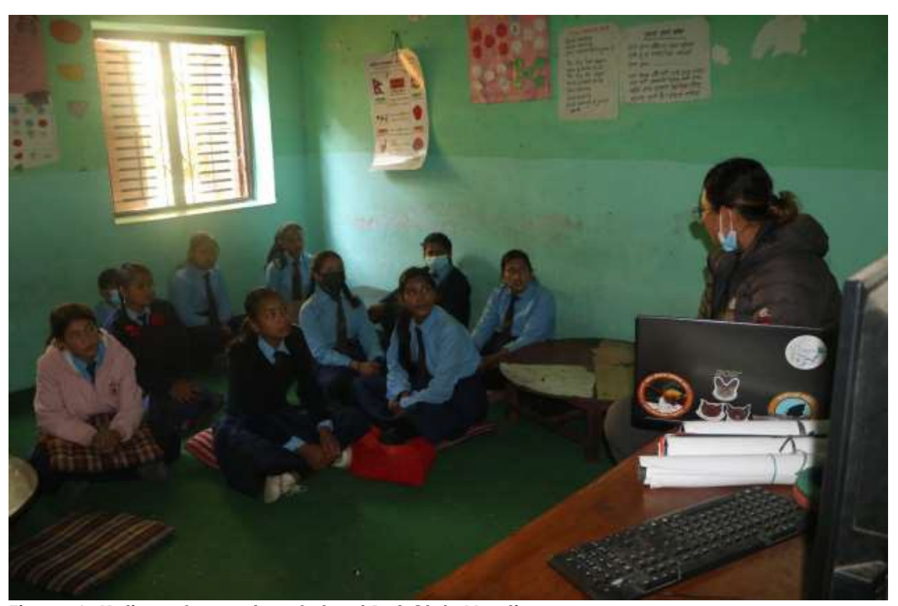
Figure 6: Kalinag Secondary School Bat Club Meeting