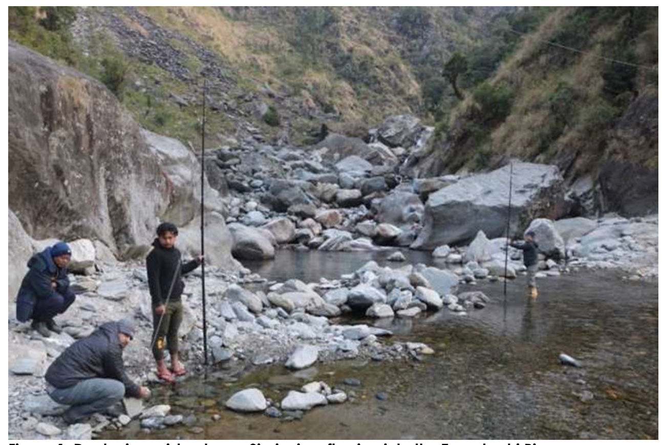
Figure 1: Deploying mist net over Siprin river flowing into the Tamakoshi River

During the third phase (06-23 December 2022), we conducted mist-netting and roost search at 23 sites of which 18 sites were new. This makes our total number of sampling sites 35 till date. GPS coordinates, habitat type, temperature and relative humidity were recorded at all sites. We installed a two banks of harp traps near the entrance of a hydropower testing tunnel. Acoustic surveys were also carried out simultaneously in those sites. Jagat Youth Bat Club members were actively involved during bat survey at Jagat.