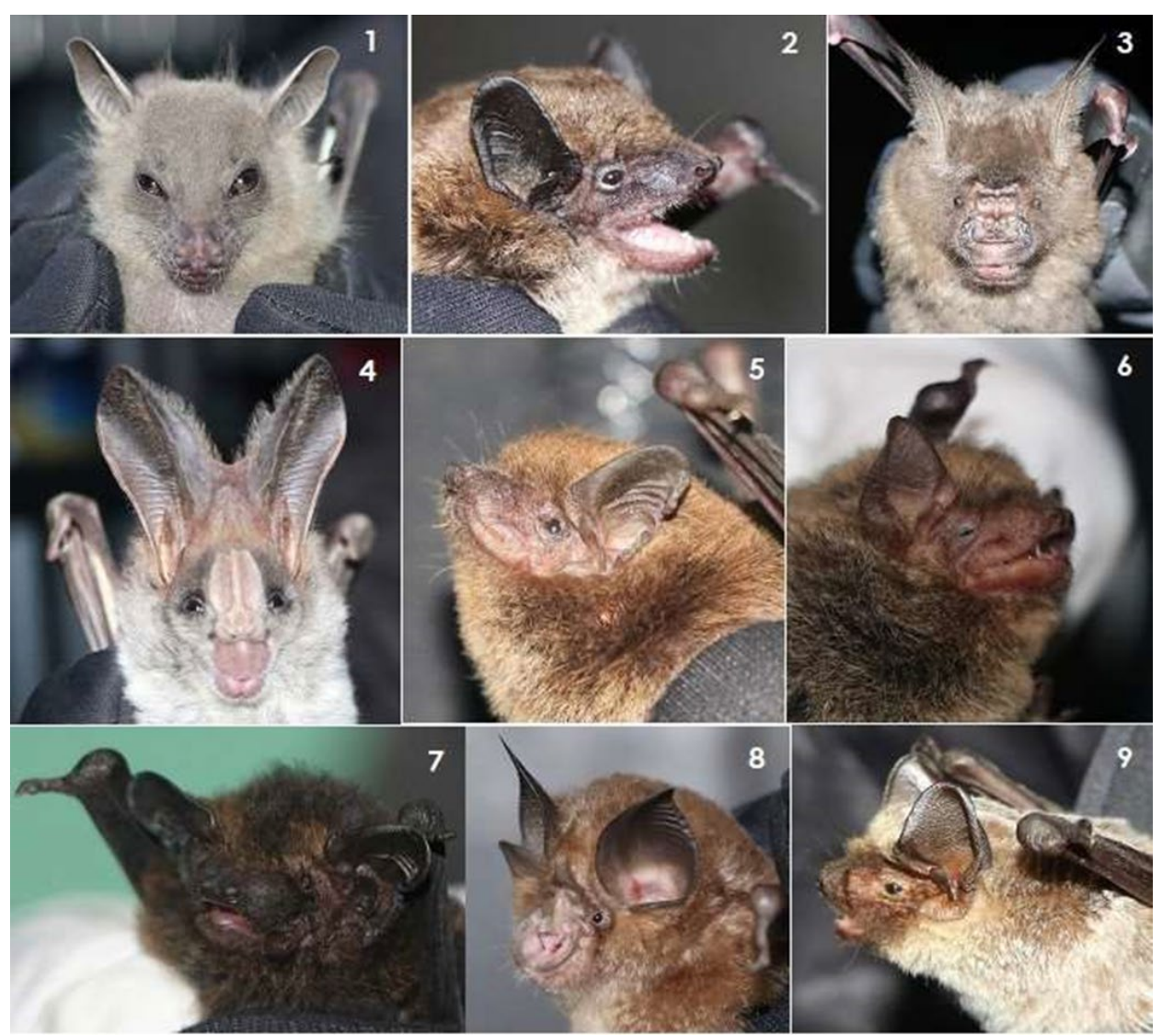
Figure 3: Bat species captured during the third phase in the Tamakoshi River Corridor; 1-Cynopterus sphinx, 2-Eptesicus serotinus, 3-Hipposideros armiger, 4-Lyroderma lyra, 5-Pipistrellus coromandra, 6-P. javanicus, 7-Pipistrellus sp., 8-Rhinolophus lepidus, 9-Vespertilio sp.