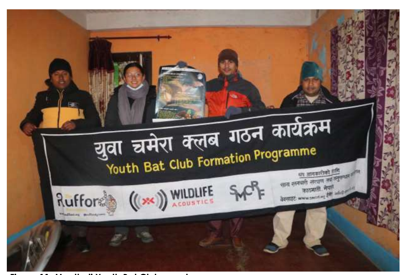
Figure 11: Manthali Youth Bat Club members