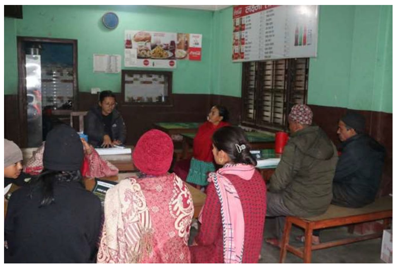
Figure 9: Community outreach session in Khimti

We conducted two remaining community outreach sessions in Khimti and Manthali in Ramechhap district, which included a short lecture, documentary show, open group discussion and distribution of bat conservation materials such as posters and stickers. The response of locals has been encouraging as they were happy and amazed to learn about bats and their importance and actively participated in the programs. The most important question in most of these sessions was about the relationship between bats and COVID-19. The participants were curious if bats were actually responsible for the spread of this disease. Through the discussion, we found that some people still believed that bat meat could be used to cure the blood urine problem "Laumutta" in cattle. Also, participants mentioned that some had seen bats living in bamboo of the bamboo thatched houses and one had seen a couple of bats roosting inside old shoes hung on the entrance of houses (to ward off the evil eye) a very long time ago.