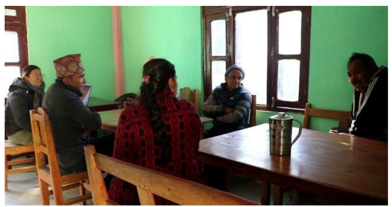
Figure 7: Bhorle Youth Bat Club Meeting

we can definitely say that such outbreak of diseases will lessen if humans learn to live in harmony with nature and be appreciative of what it has to offer. We, as researchers, have been working with bats for many years following strict protocols such that no animal is harmed and have not contracted any such disease till now. Thus, we should not fear bats, but learn and teach others to appreciate what bats do for us and let them be".