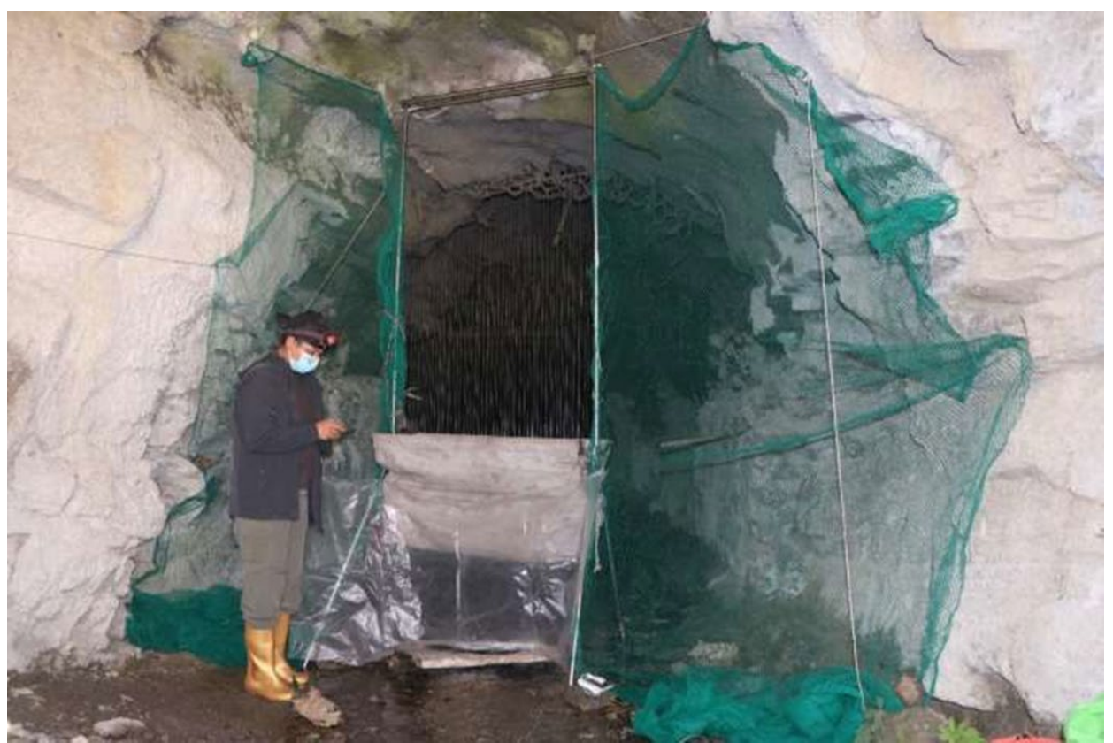
Figure 2: A two-bank harp trap installed near the entrance of a hydropower testing tunnel.

It was noticeable that the water level in the Tamakoshi River increased a lot during the evening every day. As per the local people and Gaurishankar Conservation Area Project (GCAP) officials, the Upper Tamakoshi Hydropower Project released water in the river during the evening. Due to this, we were not able to conduct mist netting along the Tamakoshi river even during the winter months when the water level in the rivers is supposed to be low. Despite the information we administered a mist net on a bank of the river at Singati and at about 7:20 PM the water level rose and we dismantled the mist net. The sampling sites included rivers, caves, hydropower testing tunnel, farmlands, man-made structures and ponds. Most of our bats were caught in mist nets near water sources, while all caves that were searched had no bats but bat guano on the floor.